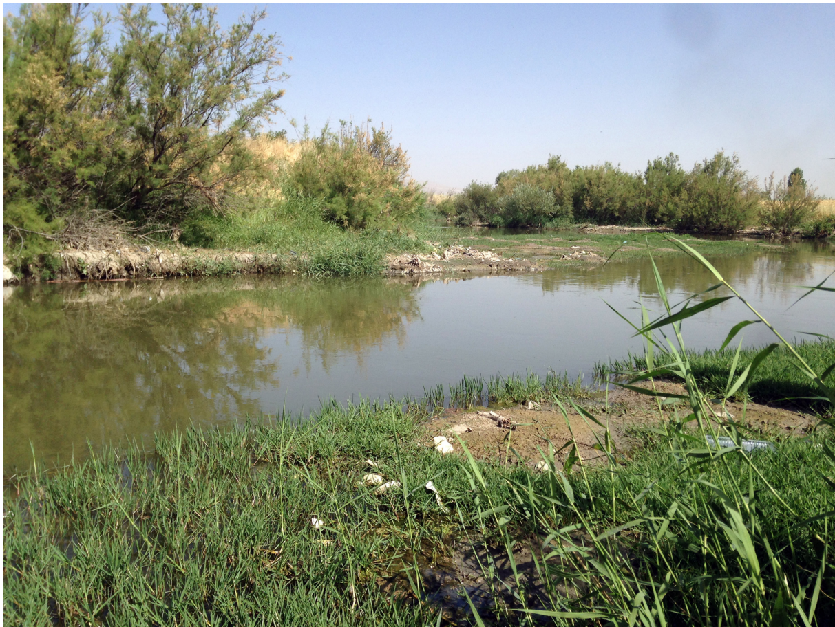
Fig. 9. Habitat of Poecilobothrus lorestanicus Grichanov et Ahmadi, sp. n. and Poecilobothrus regalis (Meigen, 1824) in the Lorestan Province, Iran, June 2016.

Diagnosis. Antenna with scape and pedicel mostly yellow, blackish dorsally; postpedicel entirely black; face yellowish grey pollinose, clypeus white pollinose; legs mostly yellow; male mid tarsus with 2 nd –3 rd segments elongated and laterally flattened, with dorsal and ventral rows of long setae; cercus regularly triangular, large, as long as wide, with long, curved marginal setae, with apical and lateral margin jagged, with elongate digitiform projections.