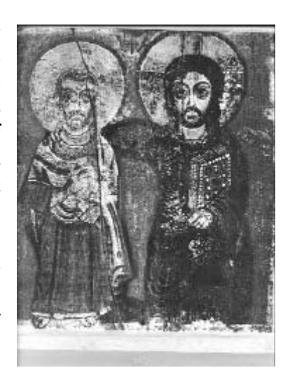
The arm of the Lord on the shoulder of St. Mina in friendship. 6 th century, The Louvre, France

There is hardly a notable museum in the world which has not devoted a special section or department to exhibits of Coptic provenance. In originality, depth of feeling, and unusual vigor, Coptic art has earned for itself a position of independence in Christian antiquity. The motifs