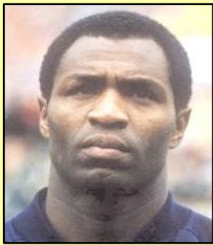
After two substitute appearances to begin his record-breaking first-team career, Luther Blissett scored when he made the starting line-up for the first time