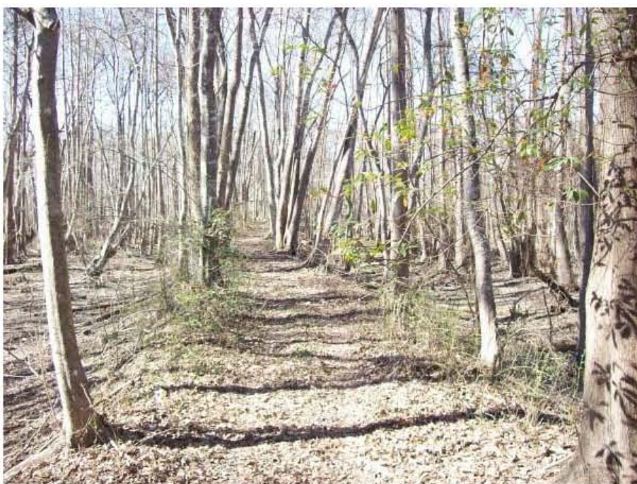
Figure 4. Augusta Road Causeway at Ebenezer Creek, Facing North.