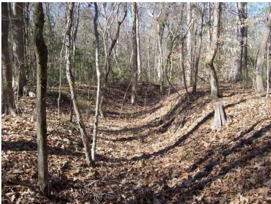
Figure 3. Augusta Road at Ebenezer Creek, Facing South (Courtesy of Daniel Battle).