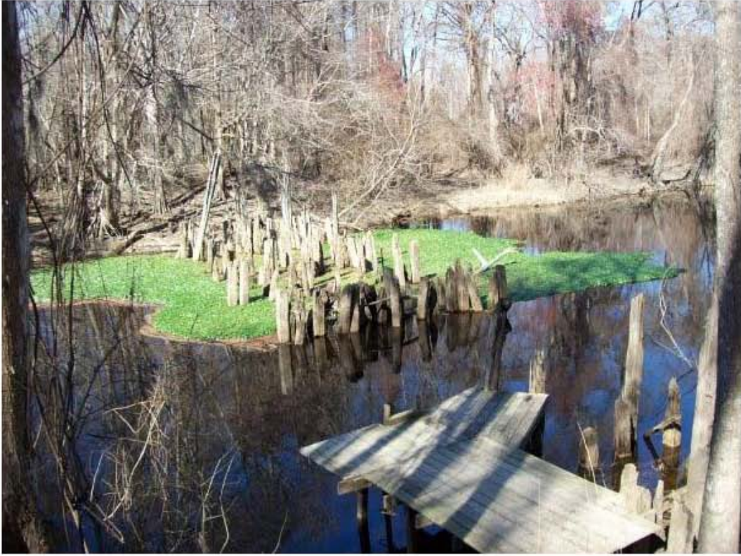
Figure 5. Remnants of Augusta Road at Ebenezer Creek.