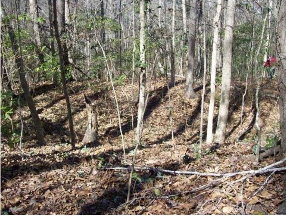
Figure 6. South View of Redoubt 6, 9Ef290.