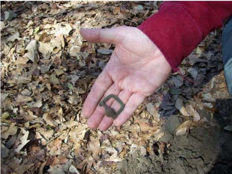
Figure 7. Brass Buckle, Redoubt 6, Ebenezer, Located by Metal Detector.