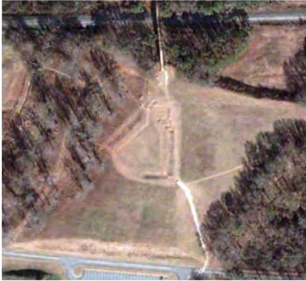
Figure 1. Aerial View of the Excavated Trading Post at 9Bi1.

Construction of Fort Hawkins began in 1806 and was mostly completed by the time of Childers' writing in 1810 (Elliott and Dean 2007; Elliott 2009). Prior to its construction, the U.S. Army had a military post and Trading Factory at Ocmulgee Old Fields in the first few years of the 19 th century. The former presence of aboriginal mounds on the site where Fort Hawkins was constructed is independently verified by land surveyor records. Three mounds were located on the hill top where Fort Hawkins was constructed and two of these were likely situated within the confines of the fort. Upon careful reading and re-reading of Childers' account, Childers' Site 1 is not located at Fort Hawkins, but is more likely at the Ocmulgee Old Fields, which is several miles removed from Fort Hawkins.