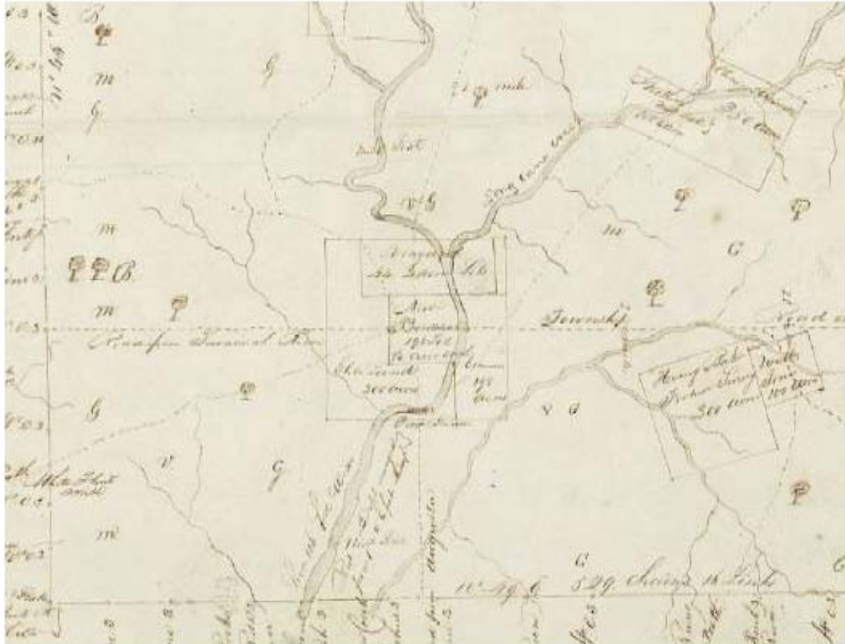
Figure 3. Portion of Calhoun's 1765 Plan of Hillsborough Township (SCDAH 2006).

New Bordeaux and the St. James Santee settlement (Logan n.d.; Anderson and Logan 1981). Few archaeological studies, however, were conducted on these settlements during this period (Elliott 1983).