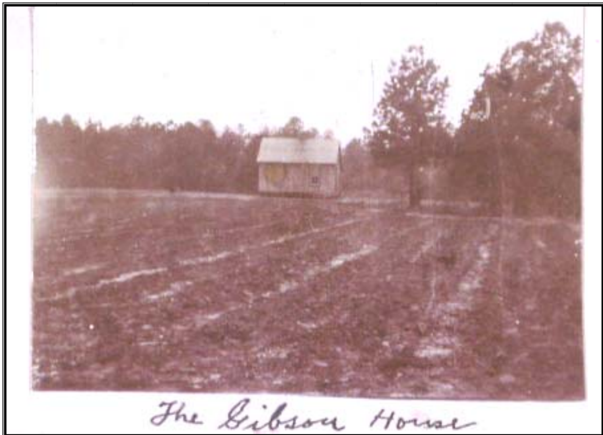
Figure 7. Another View of the Gibson House, or Rose Cottage.

By June 1898, the Commonwealth colony reported: