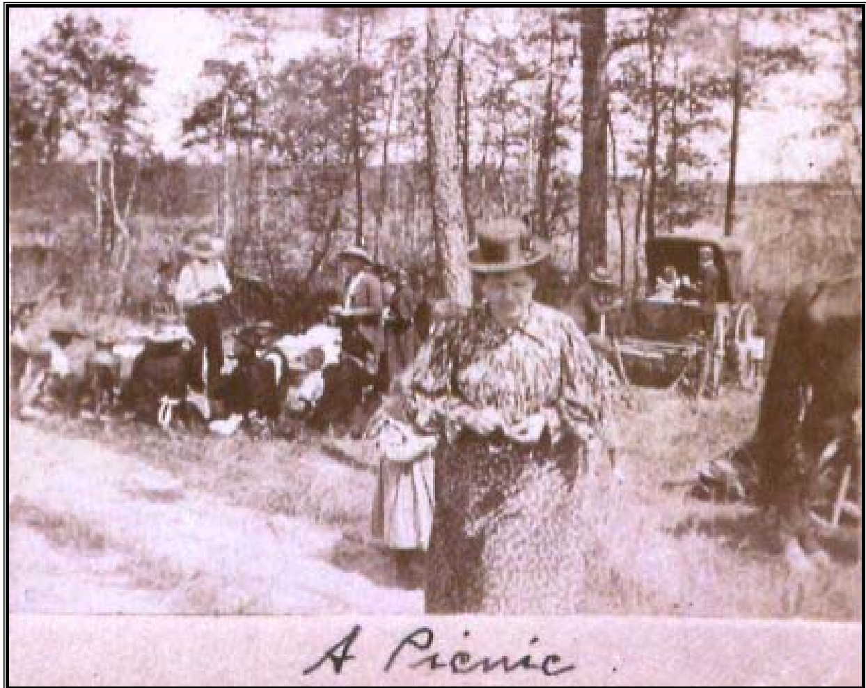
Figure 4. A Picnic at Commonwealth.