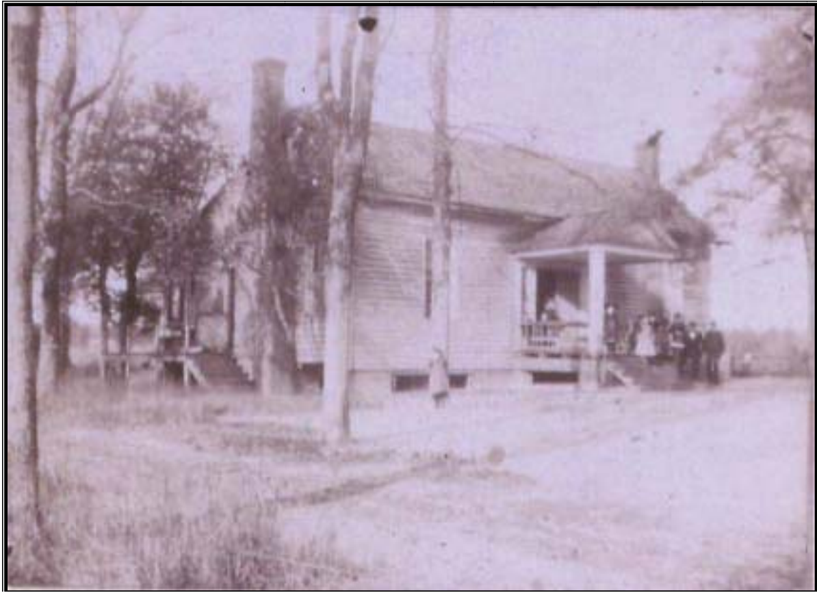
Figure 8. The Elms at Commonwealth (Courtesy, Hargrett Rare Book and Manuscript Library, University of Georgia).

Their magazine further noted: “Our sawmill has a 25-horse power boiler and engine and has a capacity of from six to ten thousand feet of lumber a day. Connected with it are an edger, a cut-off saw, a saw-gummer, a feed mill and a shingle machine. The shingle machine will cut 10,000 shingles a day” ( The Social Gospel , June 1898, I(5):23, 25). The saw mill machinery had been shipped to Commonwealth, as early as December 1896 and was presumably in use soon thereafter (Peddy Collection 1896).