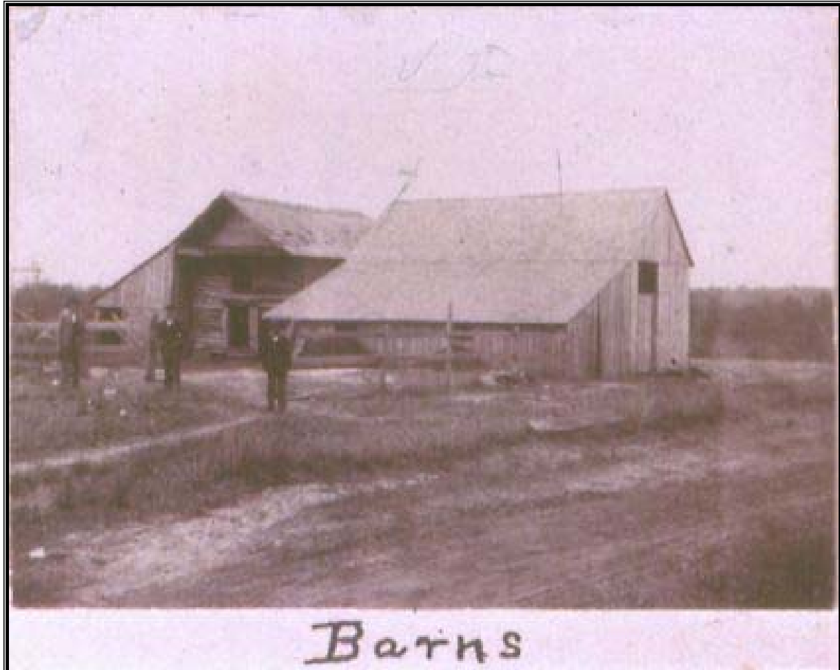
Figure 11. Barns at Commonwealth (Courtesy: Hargrett Rare Book and Manuscript Library).

mostly African-American share croppers. One neighbor is described in an anecdotal fashion: