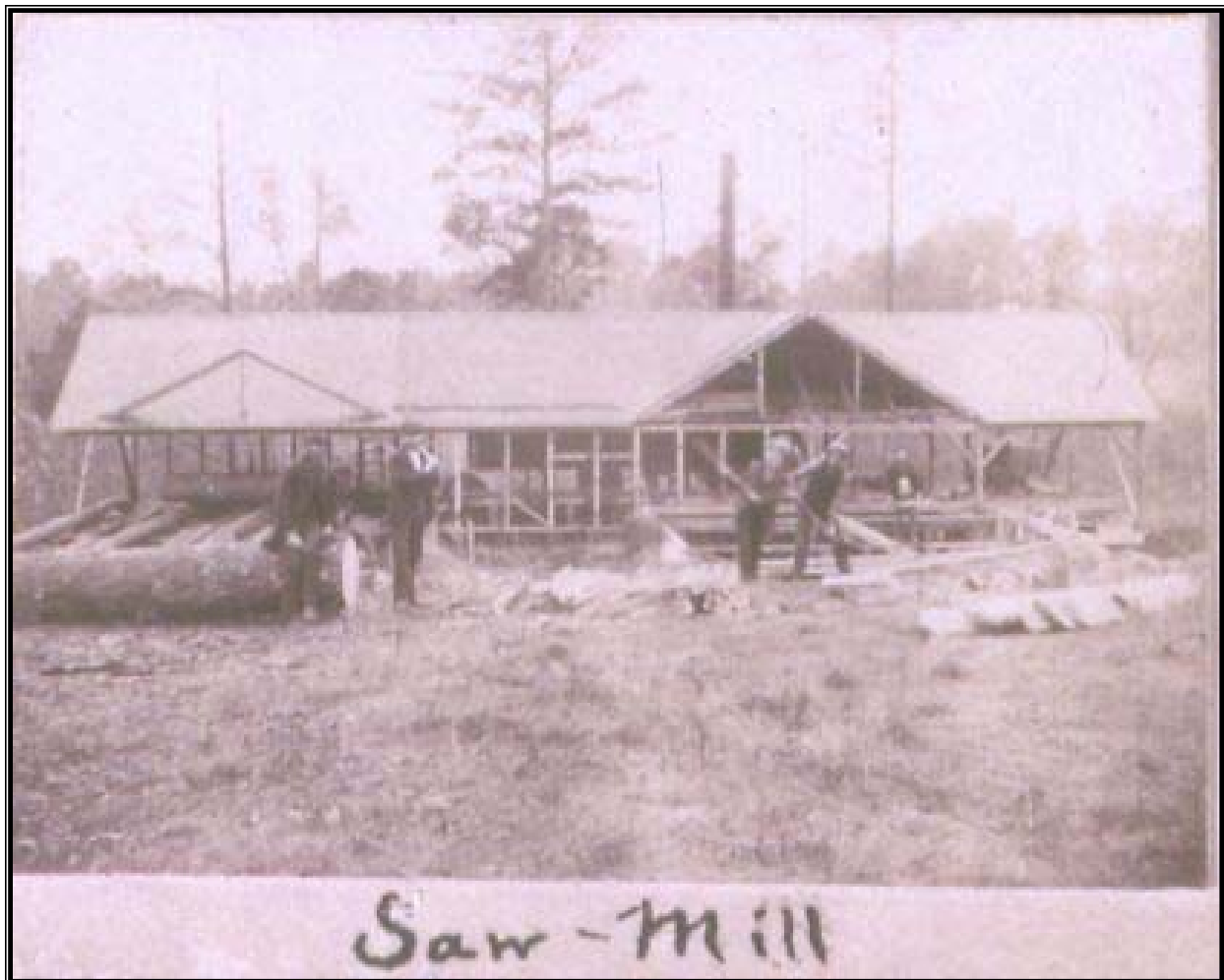
Figure 3. Saw Mill at Commonwealth.