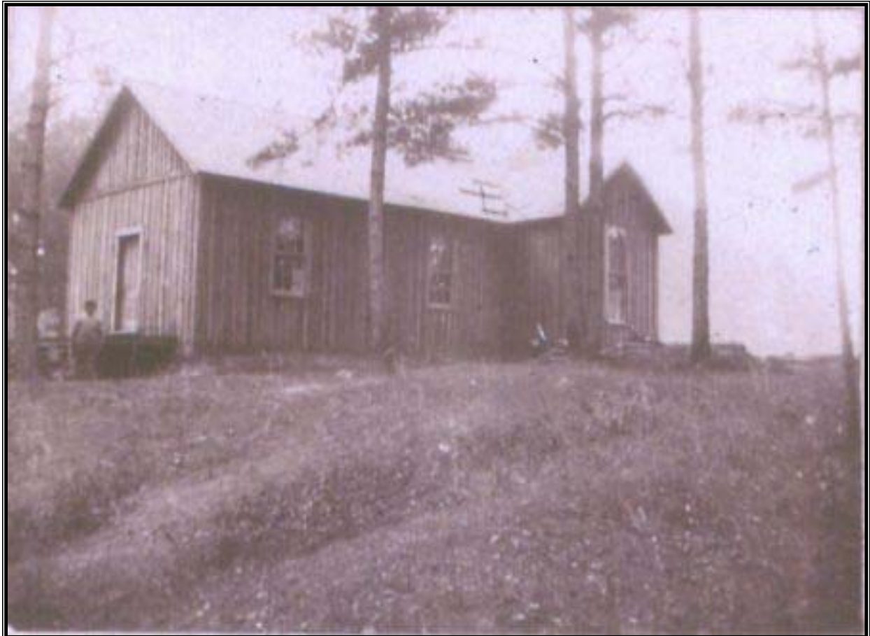
Figure 10. School House at Commonwealth.

on a cottage for the Henry family and the east end of the Commonwealth property was extensively cleared and farmed. They noted that “Other clearing has greatly extended the view in almost all directions from our houses. The trains are now visible from our windows in their passage across the whole breadth of our plantation”. The population of the colony was 95 that month ( The Social Gospel , March 1899, II(3):22, 25).