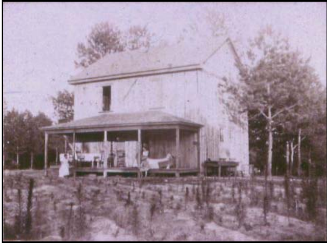
Figure 9. The Barracks at Commonwealth.

One of the logging trucks, a large flatbed wagon pulled by two mules, was published in a photograph in the February 1899 issue of The Social Gospel . The wagons were able to haul an average of 15 logs to the saw-mill per day ( The Social Gospel January 1899, 2(2):23). This truck, although non-motorized, was better than any other in the neighborhood and was in great demand on neighboring plantations. Two mule teams were used on alternate occasions to pull the truck.