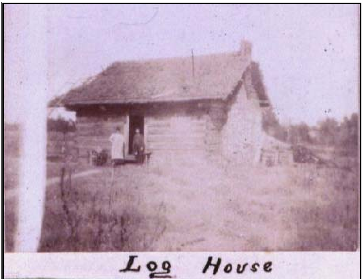
Figure 5. Log House at Commonwealth.

A few weeks since, at sheriff's sale, the Christian Commonwealth Colony in Georgia, founded in February, 1898, near Columbus, ceased to be a socialist community, and the land and buildings will revert to private ownership. Most of the members of the community came originally from Indiana, Illinois, and Ohio. They were of more than usual intelligence, and they started with considerable capital. For a time the colony prospered, then dissensions, arose, and now the usual fate of such projects has come.