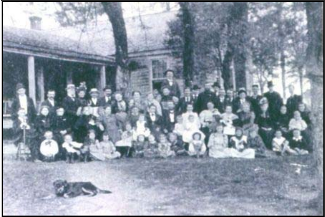
Figure 2. The Residents of Commonwealth, Georgia.

Colonists began arriving in late November 1896. By December 1896 the population of Commonwealth was 38 persons. That number had climbed to 85 by December 1898 (Peddy Collection 1896, 1898). With plans of self-sufficiency, the colonists experienced their greatest success during 1898, two years after the purchase of the land. During the year, the population of the society had grown to 100, in spite of more hopeful predictions stating that “Thousands of dollars will be spent by these colonists and the population of Commonwealth will soon mount into the hundreds” (Enquirer-Sun, December 20, 1896). During 1898, the 35 acre orchard consisted of 7,396 fruit trees, and the nursery contained over 53,000