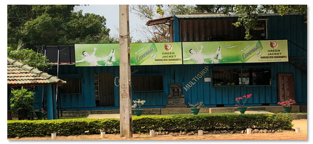
(Latitude: 9° 10' 28.71" N, Longitude: 80° 50' 58.32" E)

(Latitude: 9° 5′ 27.53″ N, Longitude: 80° 53′ 52.422″ E) Green Jacket Multi Shop – Kokkilai Road, Alampil, Mullaithivu