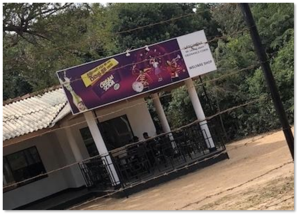
(Latitude: 9° 15' 29.718" N, Longitude: 80° 45' 40.92" E)

7 Regiment Sri Lanka Army Ordnance Corp Welfare Shop Keppapilavu bypass road, off Puthukudiyiruppu-Mulliyawalai Road, Mullaithivu