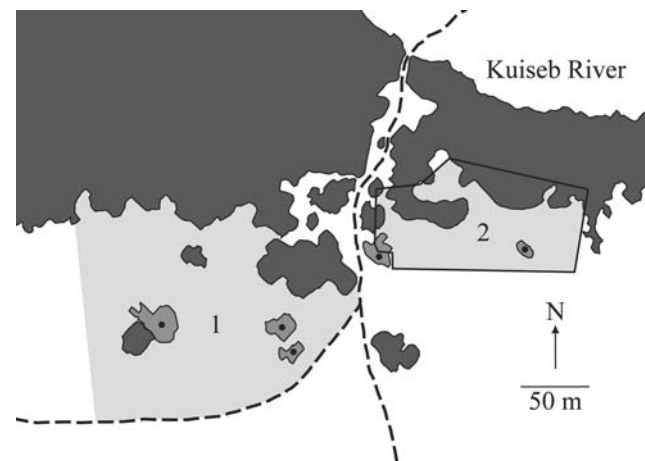
Fig. 1 Map showing the spatial layout of the major landmarks in and close around the experimental areas. The light grey areas show the experimental areas themselves. Area 1 is where the spider displacements took place. The black polygon shows the fence surrounding area 2 where the burrow displacements took place. The four medium grey areas are hummocks formed by Acanthosicyos horridus with heights approximately between 1 and 3 m. Dark grey areas are trees and shrubs, mainly Acacia erioloba , Faidherbia albida , Tamarix usneoides , and Salvadora persica with heights approximately between 3 and 10 m. The stippled lines are car tracks. The male spiders used in the experiments were found throughout the areas. In the well-populated research areas the distance to the nearest neighbour was almost between 3 and 8 m. The sex ratio is roughly 1 male to 3 females

Male spiders were found by searching for their telltale tracks in the sand in the early hours after sunrise (Henschel 2002; Nørgaard et al. 2003). Spiders identified as adult males (Henschel 1990; Nørgaard et al. 2006b) were dug up and marked with individual colour codes (small dots of non-toxic paint applied to the