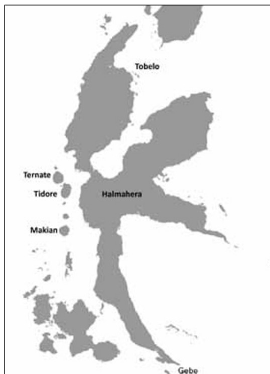
Picture 1. Indigenous languages and dialects of North Maluku referred to in text.

In this paper, I begin with a brief discussion of what we might call the North Maluku linguistic area (see Picture 1) and how North Maluku Malay fits into it. In section four I provide an overview of the semantics of directionals in North Maluku Malay and in section five I discuss briefly the semantics of North Maluku Malay directionals. (The interested reader is directed to Bowden 2005, for more detail.). Section six goes on to compare the semantics of North Maluku Malay directional with those of some of the indigenous languages from the region while in section seven I go on to explore the striking similarities in the syntax of directionals in three languages of the region: Taba, Tidore and North Maluku Malay. In section eight, I argue that the changes that have taken place in the North Maluku Malay directional system are an example of what Ross (2006) calls metatypy , characterized as "a diachronic process in the course of which the syntax of one of the languages of a bilingual speech community is restructured on the model of the syntax of the speaker's other language". Finally, in section nine I will turn to questions of speaker identity and language endangerment in eastern Indonesia.