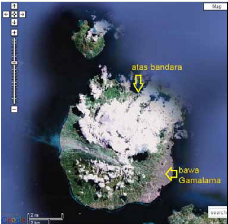
Picture 2. Ternate Island showing locations referred to in text.

Table 1 lists directional terms from North Maluku Malay and a selection of other local languages, Austronesian and Papuan. 4