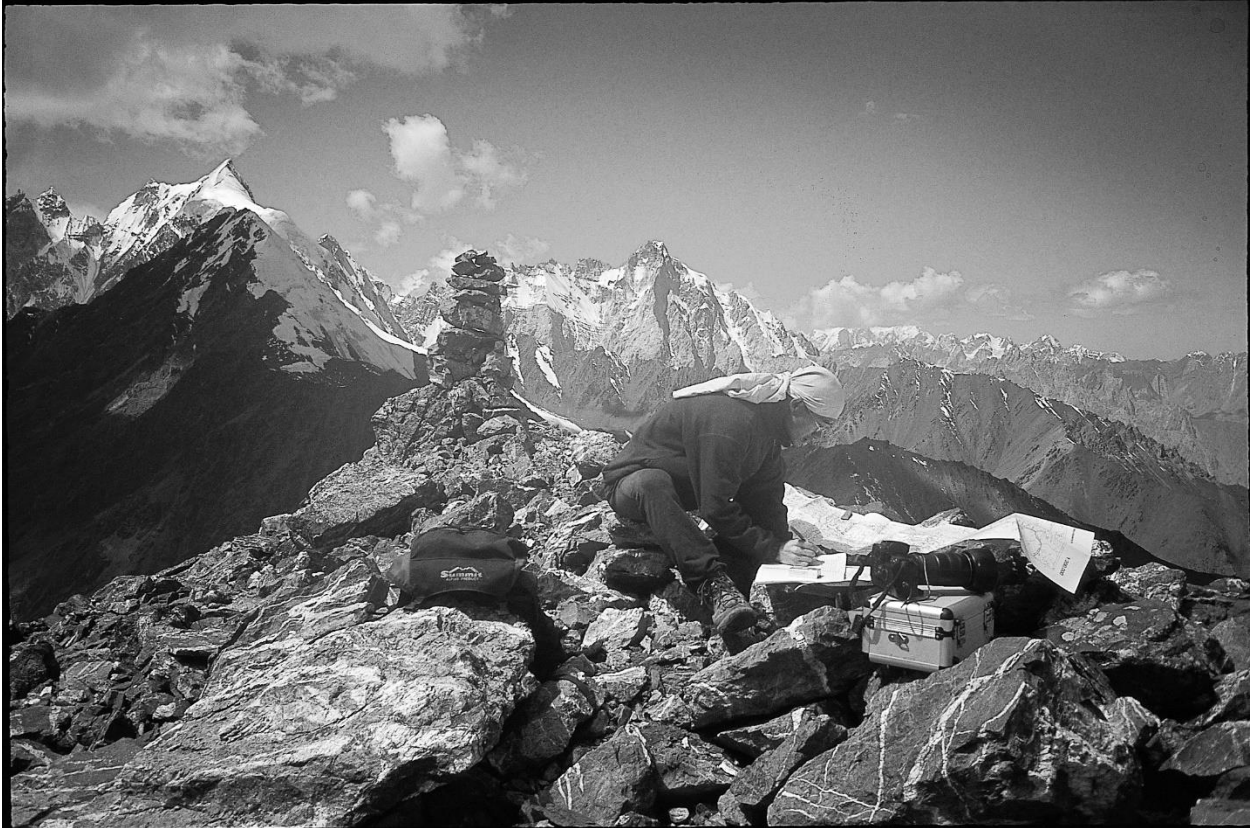
Figure 3 Kim Chang-ho studying a map on the top of a pass in Karakoram, 2000.

He read books and reports on Karakoram exploration, in English and Japanese; collected about five thousand books mostly on the particular subject; and picked up words of nine local languages used around northern Pakistan enough to communicate with villagers and herders. While in villages, he labored for and stayed with the residents, enabling himself to converse long hours in order to collect geographic information and regional myths associated with the mountain landscape surrounding.