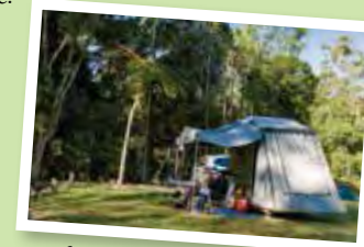
Camping at Broken River Bush Camp

History information boards are on display at most businesses and community facilities throughout the area. Further information is available at www.history.eungella.com.au