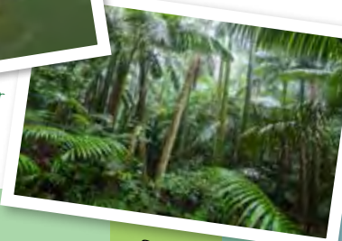
Eungella National Park