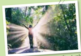
25km of graded walking tracks