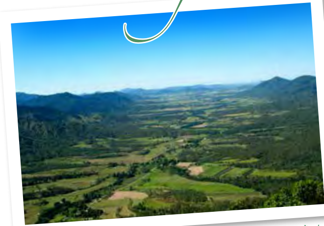
View from Sky Window

Approximately an hour west of Mackay, the township of Eungella boasts a unique environment. Where else can you see Platypus in the wild, choose from 25kms of bush walking tracks in sub-tropical rainforest and experience great food and accommodation with mountain top views?