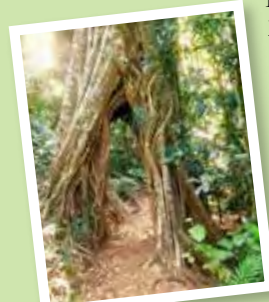
Strangler Fig Tree Arch on Cedar Grove track