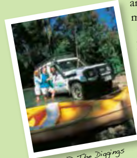
4WD The Diggings

Spending a day in Eungella is easy, both Peases Lookout and Sky Window offer spectacular views of the Pioneer Valley