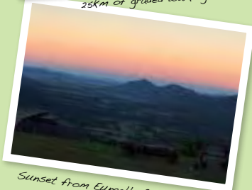
Sunset from Eungella Chalet

Eungella has some charming cafes and restaurants, a historic pub, food and souvenir outlets and a range of accommodation and camping options. Picnics in the crisp mountain air are popular at any of the well equipped picnic grounds throughout the area.