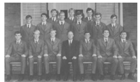
Photo: The Prefects of 1985.