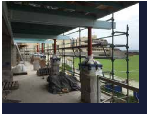
Photo: New toilet facilities on the first floor of Kirkland House.