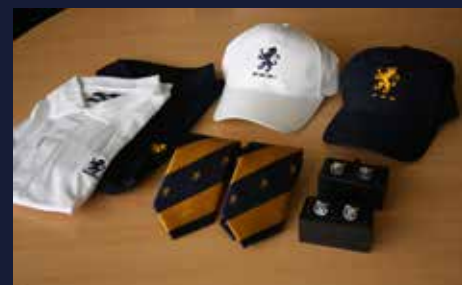
Photo: Some of the range of Old Boys' Union items that can be purchased.