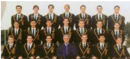
The Lion & Lang Syne • Issue 01 • Vol. 26