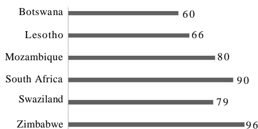
Fig. 2. Students' trafficking in Southern African universities

implies the element of personal privacy, while confidentiality indicates the handling of information in a confidential manner. Sieber (2002: 146) views confidentiality as a continuation of privacy, which refers to agreements between persons that limit others' access to private information. Information was provided anonymously to ensure the privacy of both participants and institutions. Thirty-six interviewees were identified for the interview process in their own institutions. These interviews consist of focus groups of six members each per institution. In a brief time, the researcher created a thoughtful, permissive atmosphere, provided ground rules, and set the tone of the discussion. Participants were informed that there are no wrong answers but rather differing points of view. They were also made to feel free to share their point of view even if it differs from what others have said. Interviews were recorded, transcribed and analysed. The sad stories related in participants' research interviews formed the research findings, and as such, were subject to analysis. The institutions of Higher Learning chosen from the above countries were selected on the basis of their documented high statistics of student trafficking (See Fig. 2 for statistics relating to these SoA universities).