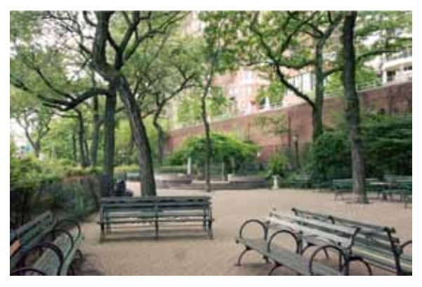
Plans for the Future of Detmold Park

This past summer, the TBA's Parks Committee initiated a survey of Peter Detmold Park to provide input to a plan of action for renovating and refurbishing the benches, gardens and architectural elements, as well as exploring improvements in security, signage and lighting. Overnight security has been one matter of recently increas-