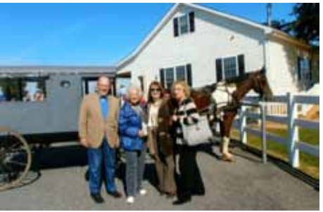
In Amish Country

Thirteen hours later, we were home in Turtle Bay. Given a great guide, a fascinating culture and countryside, good food, a comfortable ride, and, especially, the easy and engaging conversations among members of the Turtle Bay family, yet another special event was deemed a great success. The last question everyone asked as they exited the bus was, "When is the next trip? We want to sign up now!" It was the end of a happy day of discovery, learning and great fun.