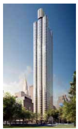
The Turtle Bay Association was not Zeckendorf Holdings.)

the 20 percent maximum permitted by zoning. The developer. Zeckendorf, obtained this concession on grounds that the apartment units are much larger than usual and intended for diplomats. Bay Associainvited to par-