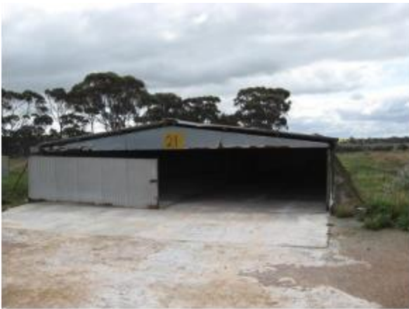
Building 21 – Fertiliser Shed