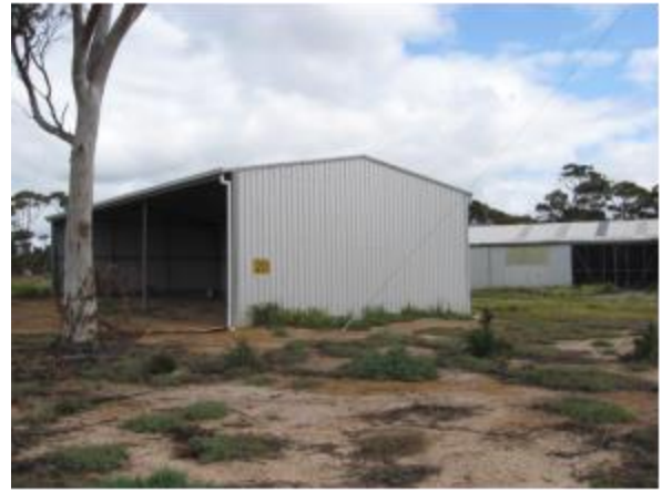
Building 20 – Machinery Shed