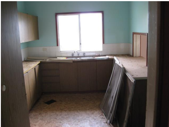
House 1; Kitchen