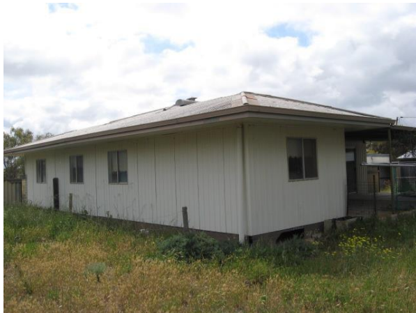
House 1; Rear