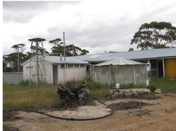
Building 8; rear