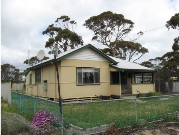
House 4; Front garden with chain link fence