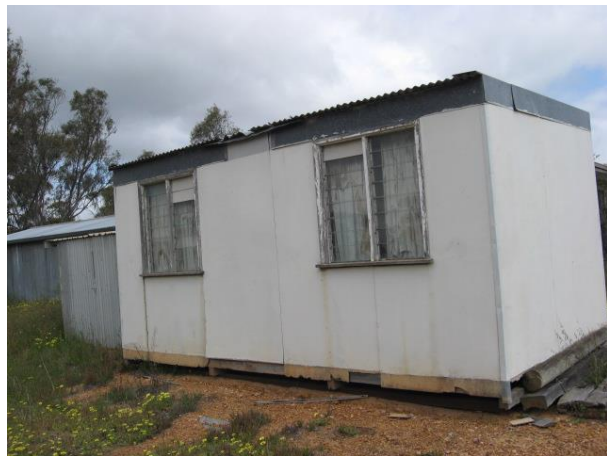
House 1; Associated Donga, located at rear.