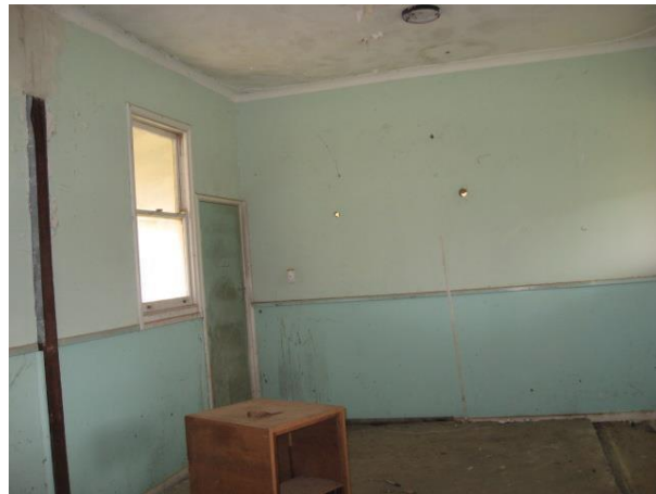
Building 8; interior