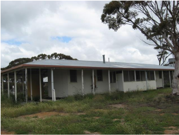
Building 8; Front view