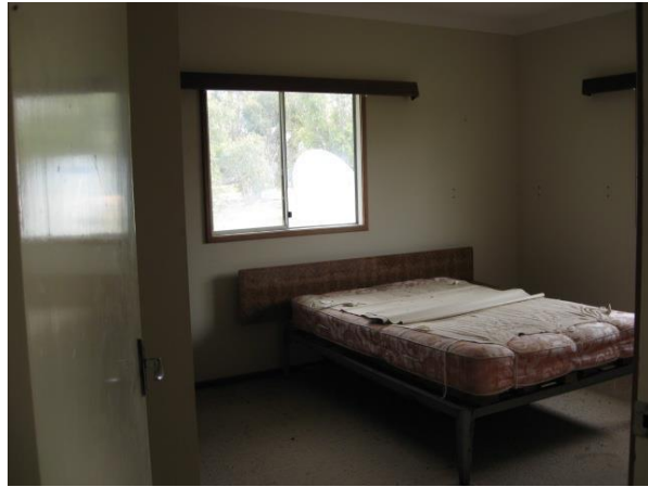
House 1; Bedroom