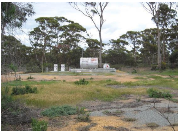
Fuel Bowser and ULP Tank