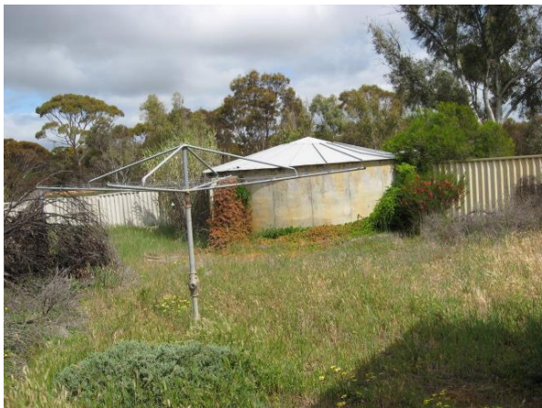
House 1; Rear yard, fibrous asbestos fence, clothes line and water tank.