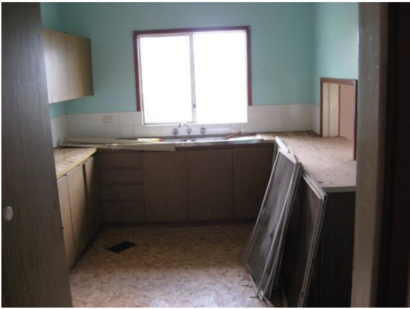
House 1; Kitchen