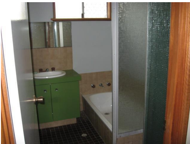
House 2; Bathroom