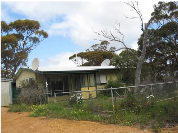
House 8; Front view of house with chain link fence