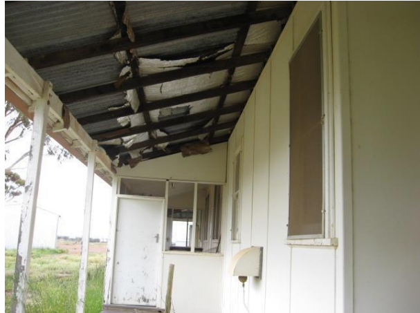
Building 8, front verandah