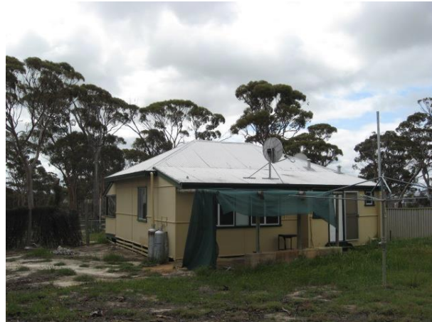
House 4; Rear view of house with clothes line