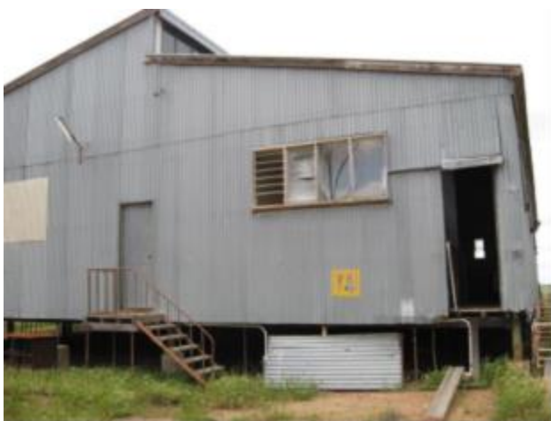
Building 14 – Shearing Shed