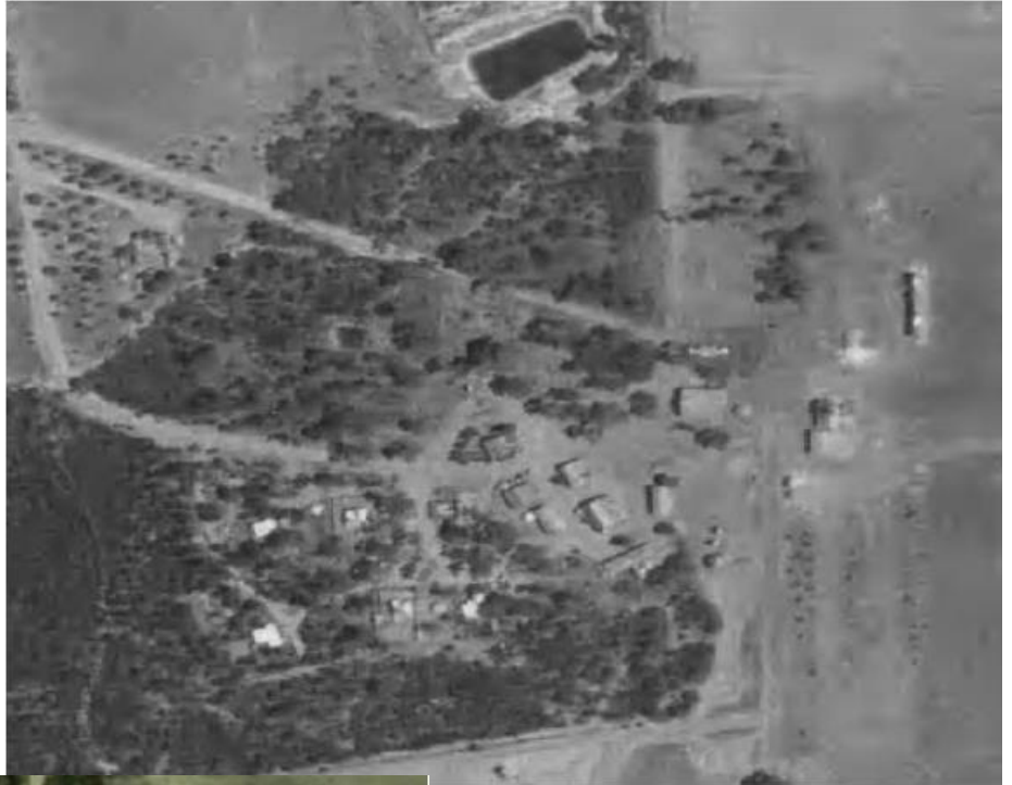
Aerial image of Newdegate Farm during operation, January 1998