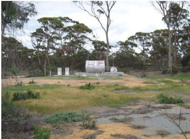
Fuel Bowser and ULP Tank