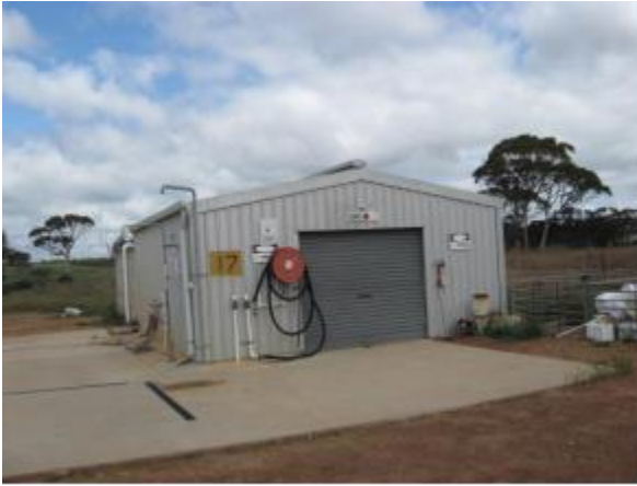
Building 17 – Chemical Shed