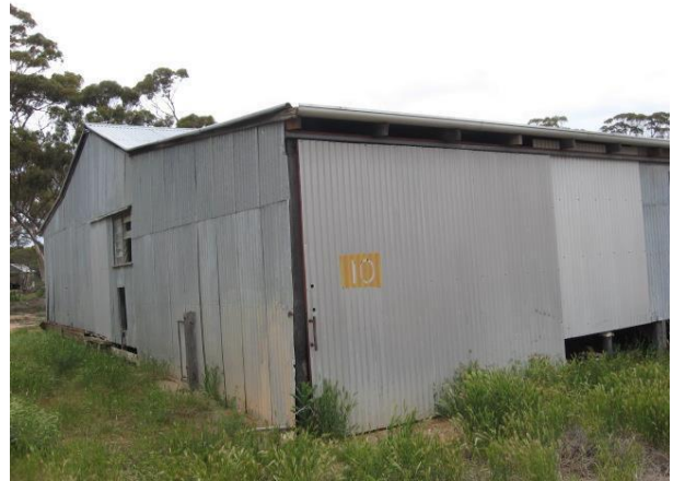
Building 10 – Store