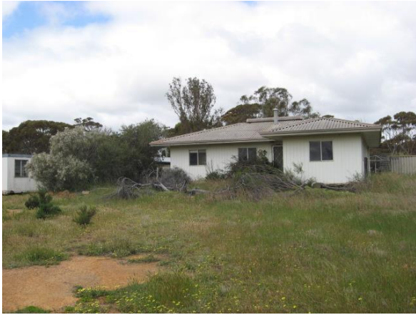
House 1; Front View