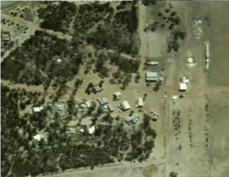
Aerial image of Newdegate Farm during operation, circa 2000