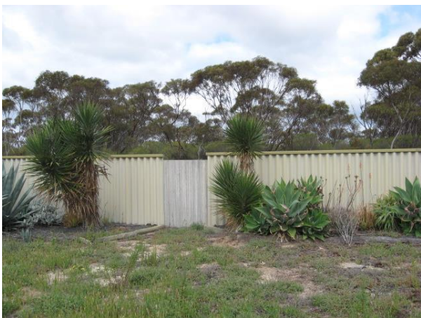
House 4; fibrous asbestos fence (to be removed)