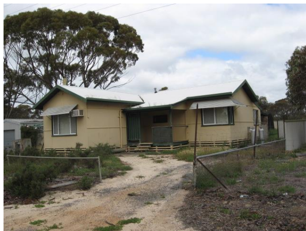
House 5; Front yard