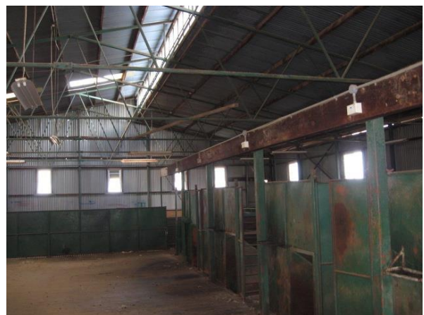
Building 14 – Shearing Shed, Interior