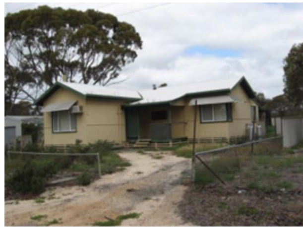
House 5; Front yard