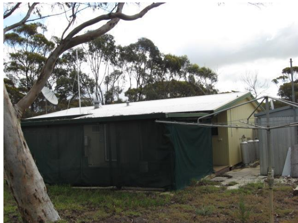
House 8; Rear view of house with chain link fence