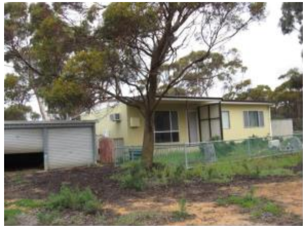
House 2; Front yard