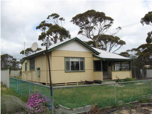
House 4; Front garden with chain link fence