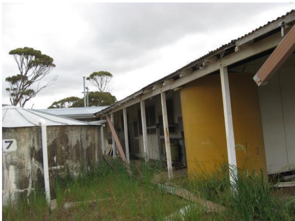
Building 8; rear