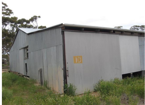
Building 10 – Store