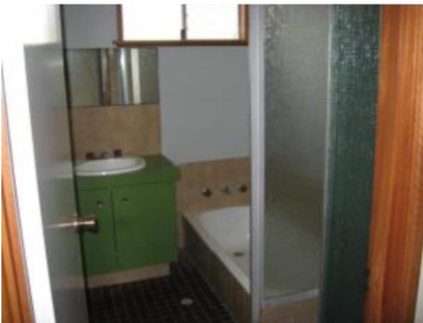
House 2; Bathroom