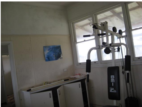
Building 8; interior