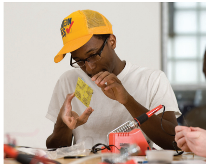
A student prepares to solder a circuit board during a Creative Electronics Workshop