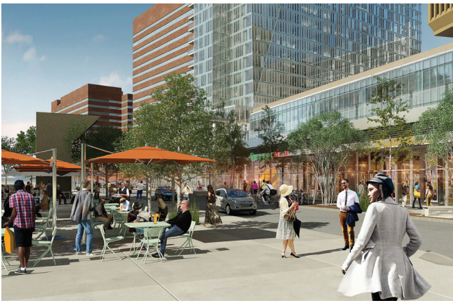
An artist’s conception of a future Kendall street scene

MIT would be a very different institution had its campus been based anywhere but Cambridge. This extraordinarily diverse community has inspired some of the world’s great writers, scholars, scientists, musicians, artists, and global leaders. Today, MIT and the City are welcoming to Cambridge companies that are shaping the future of the planet, as seen in the Cambridge Innovation Ecosystem map on the facing page.