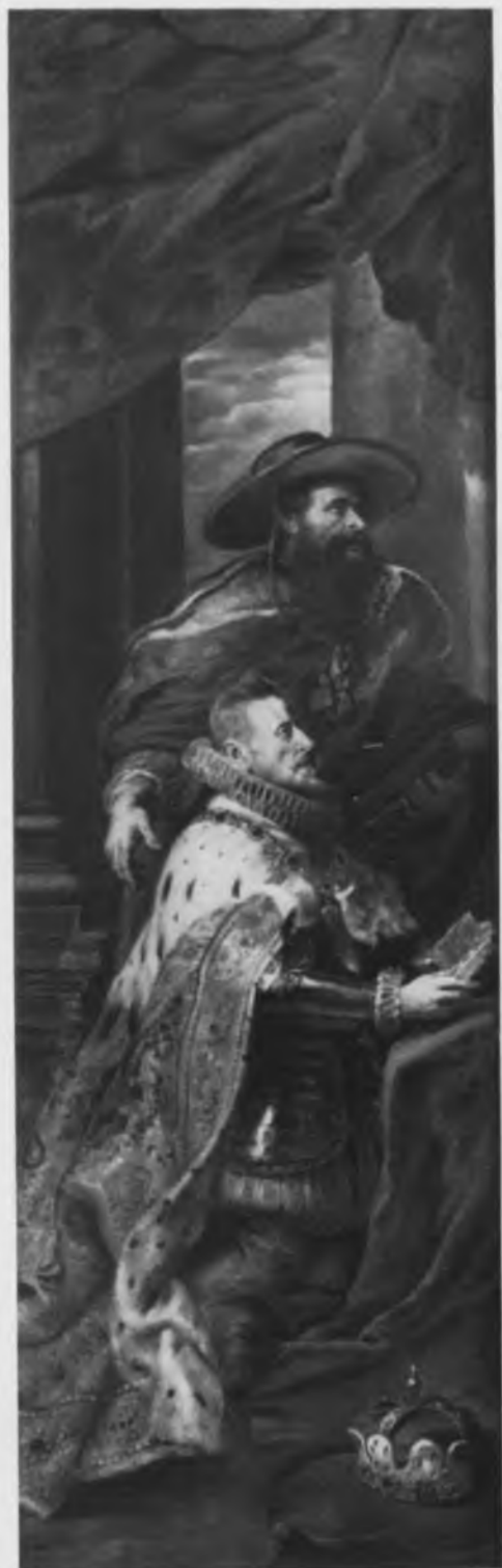
51. Rubens, Archduke Albert with his Patron St. Albert of Louvain (No. 117). Vienna, Kunsthistorisches Museum