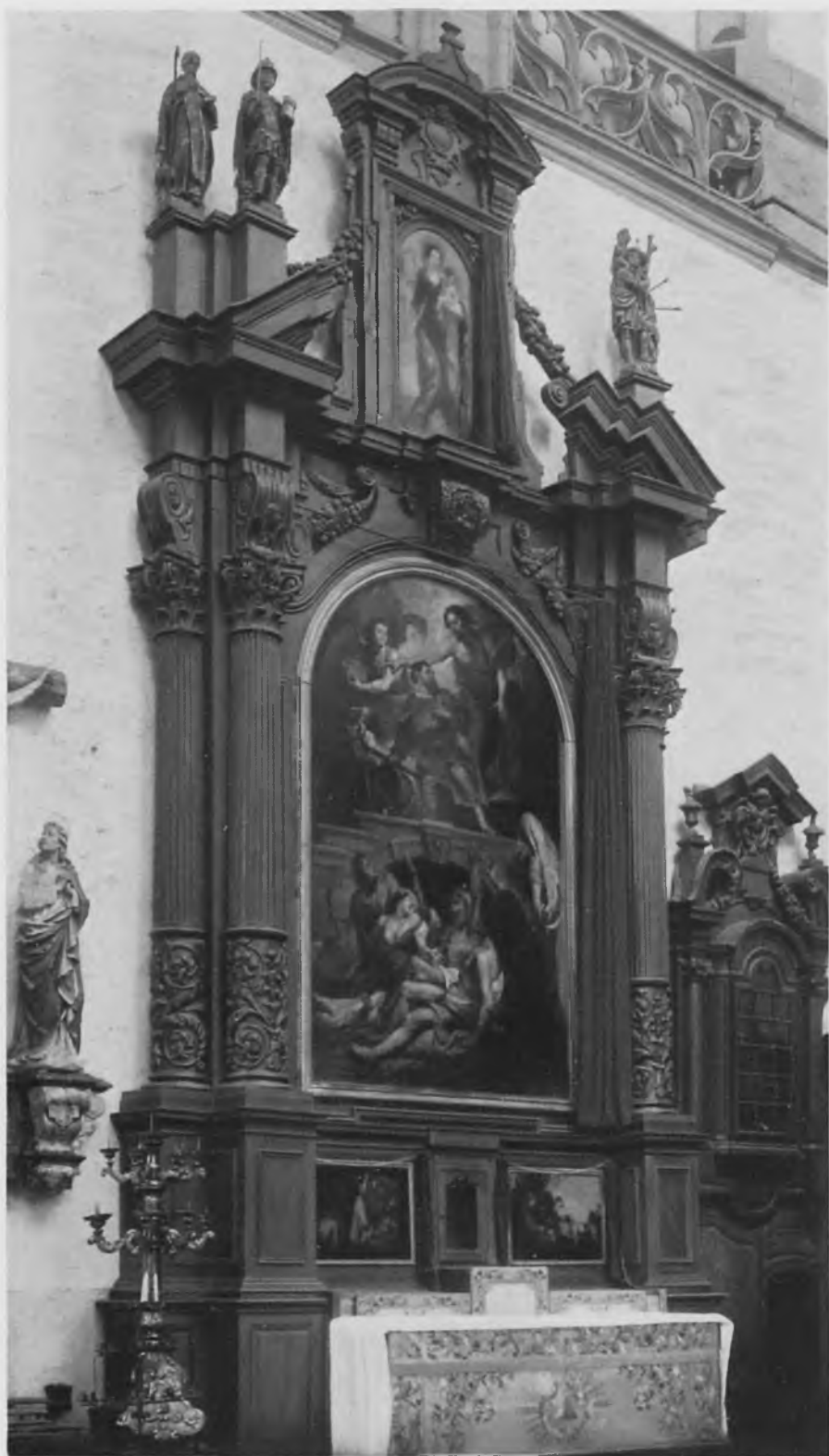
100. The Altar of St. Roch. Alošt, St. Martin's Church