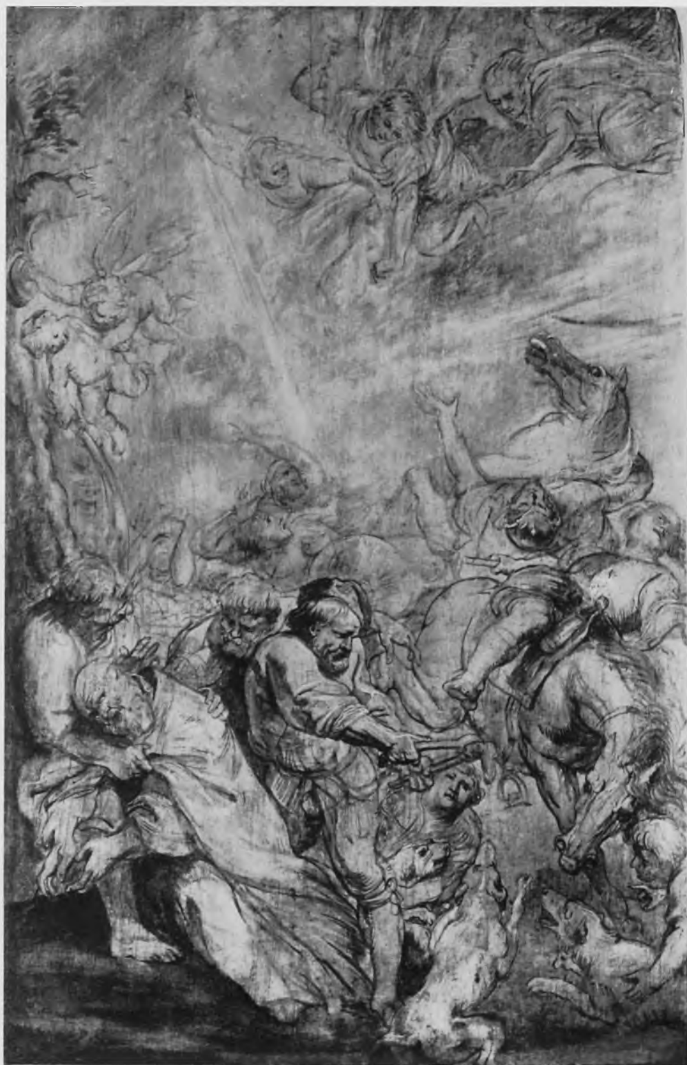
75. Rubens, The Martyrdom of St. Livinus , oil sketch (No. 127a).