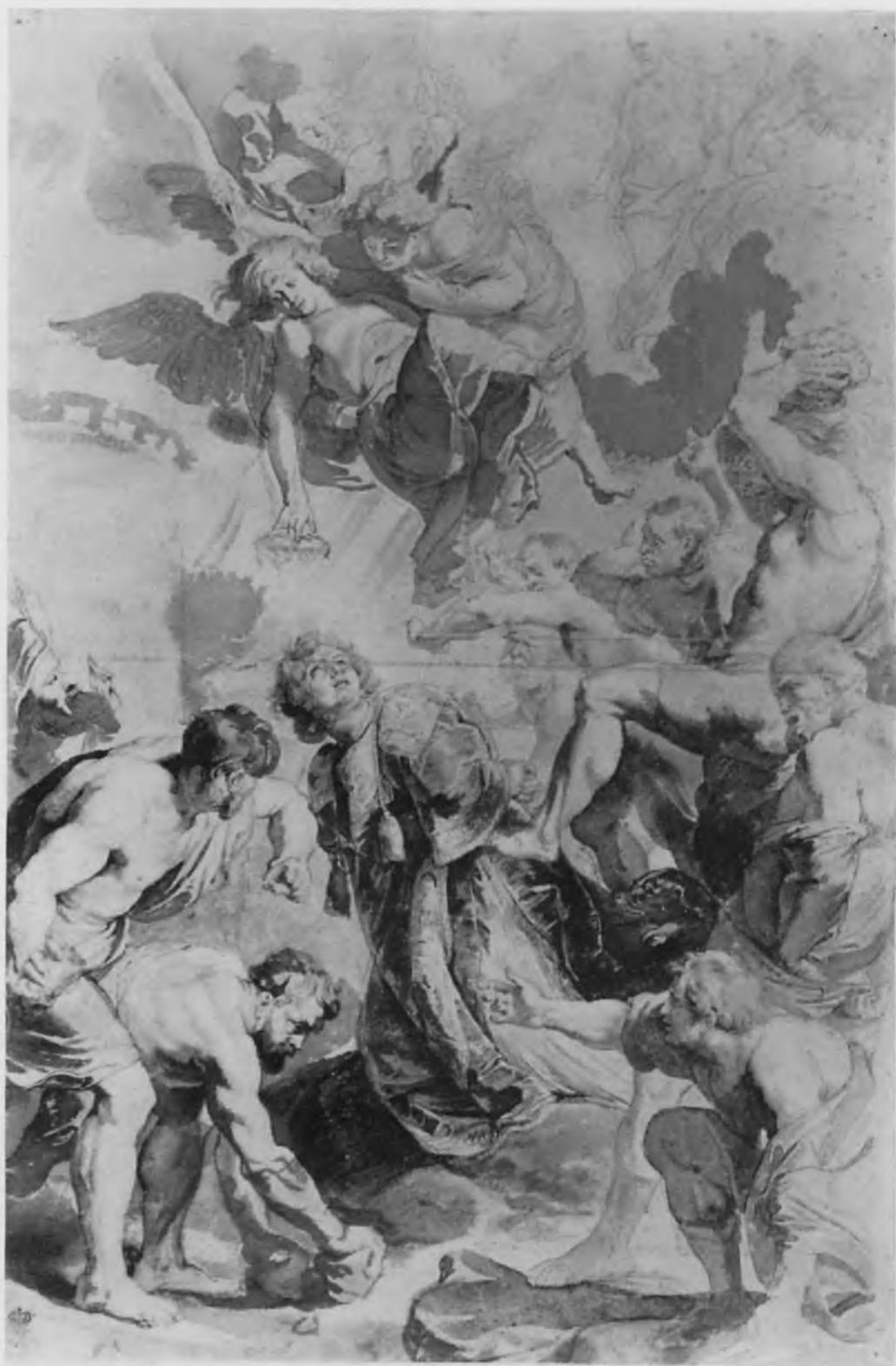
114. Rubens, The Martyrdom of St. Stephen , drawing (No. 146c). Leningrad, Hermitage