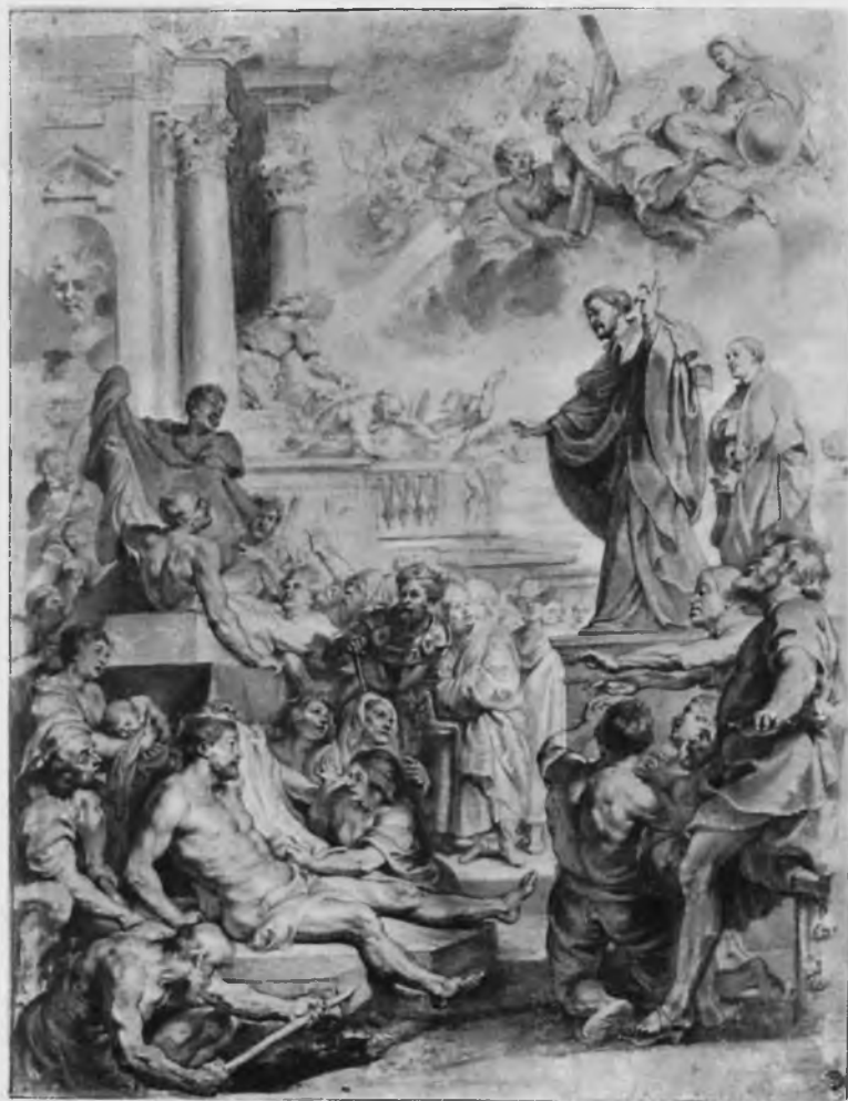
15. ? Retouched by Rubens, The Miracles of St. Francis Xavier , drawing (No. 104h). Paris, Cabinet des Dessins du Musée du Louvre