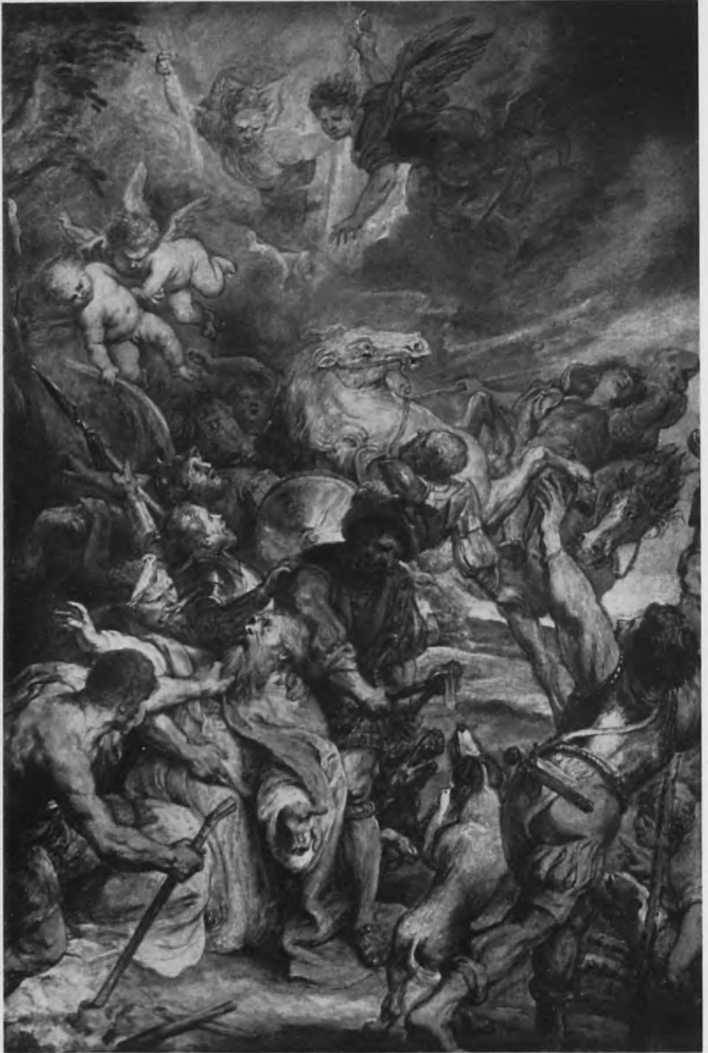
77. Rubens, The Martyrdom of St. Livinus , oil sketch (No. 127b).