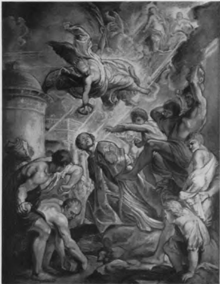
110. After Rubens, The Martyrdom of St. Stephen (No. 146a). Brussels, Royal Palace