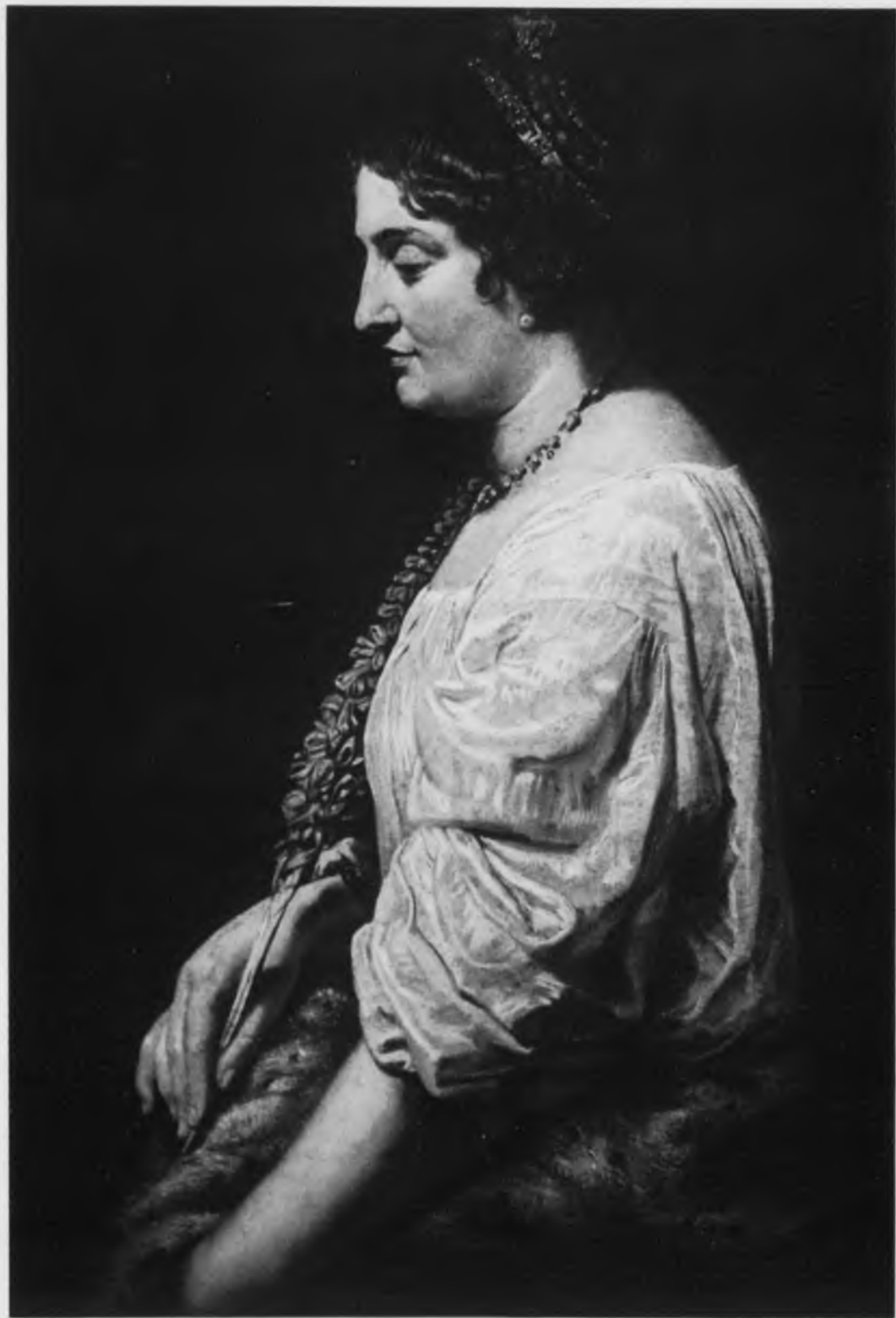
28. Rubens, Bust of St. Domitilla , oil sketch (No. 109c). Bergamo, Accademia Carrara