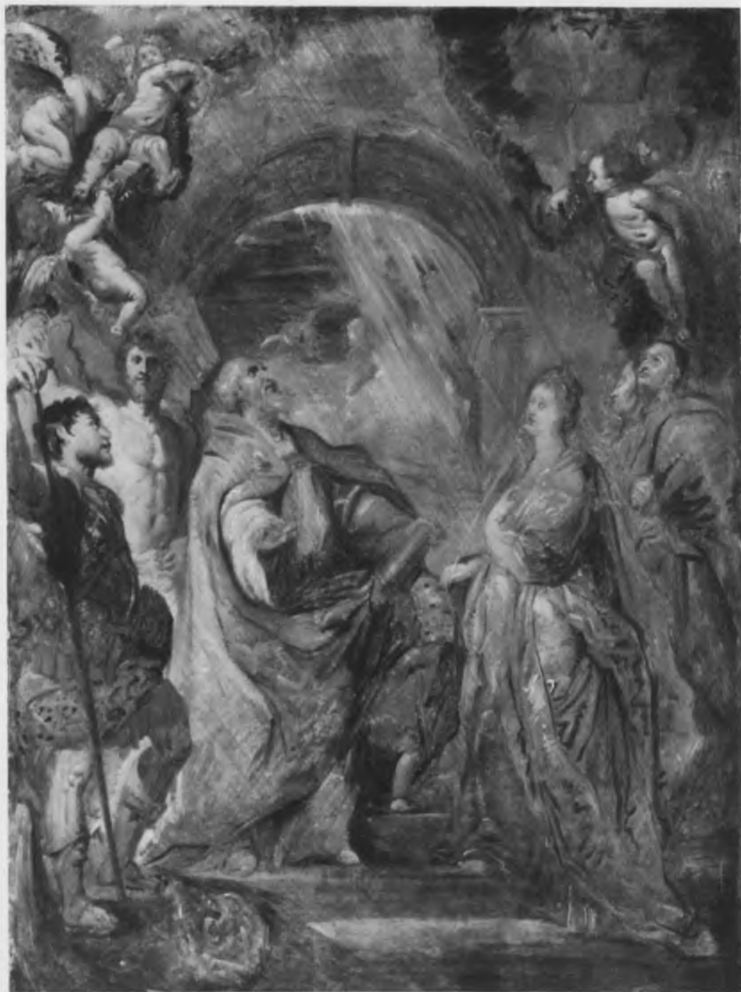
30. Rubens, St. Gregory the Great Surrounded by Other Saints , oil sketch (No. 109g).