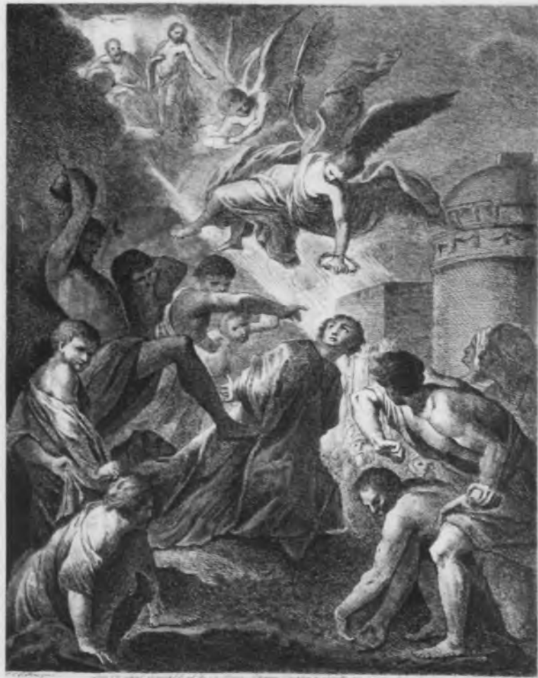
111. J.F. Oeser, The Martyrdom of St. Stephen , etching (No. 146a)