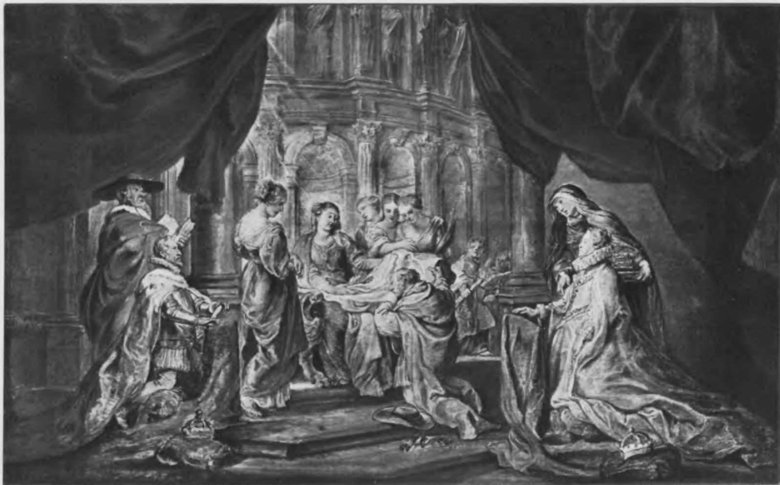
49. Rubens, St. Ildefonso Receiving the Chasuble from the Virgin in the Presence of Archduke Albert and the Infanta Isabella , oil sketch (No. 117b). Leningrad, Hermitage