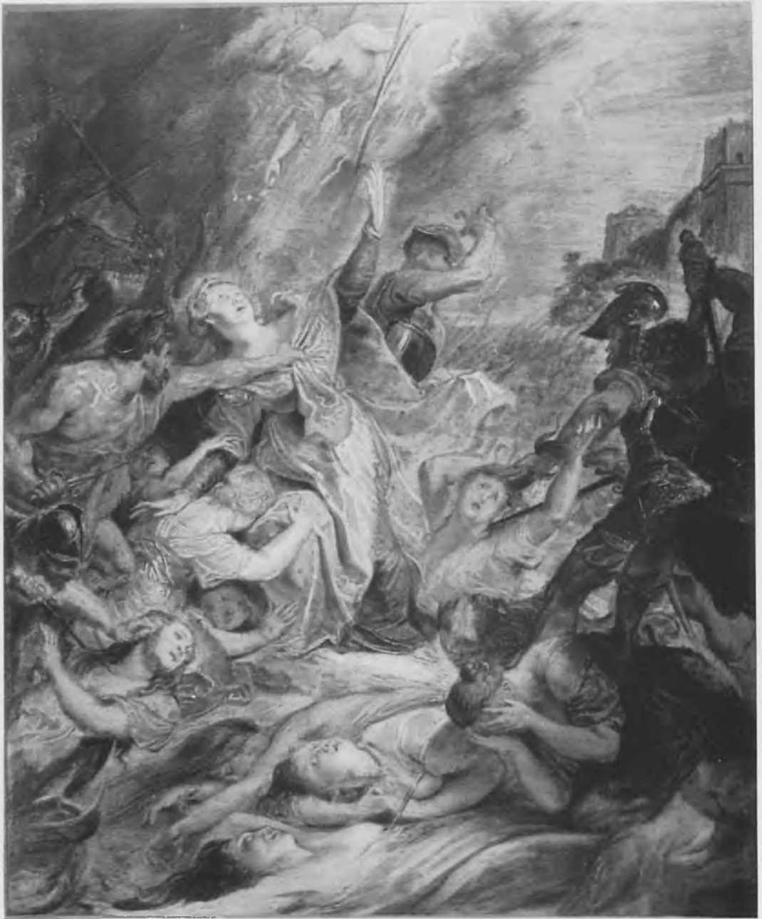
132. Rubens, The Martyrdom of St. Ursula and her Companions , oil sketch (No. 159). Brussels, Musées Royaux des Beaux-Arts