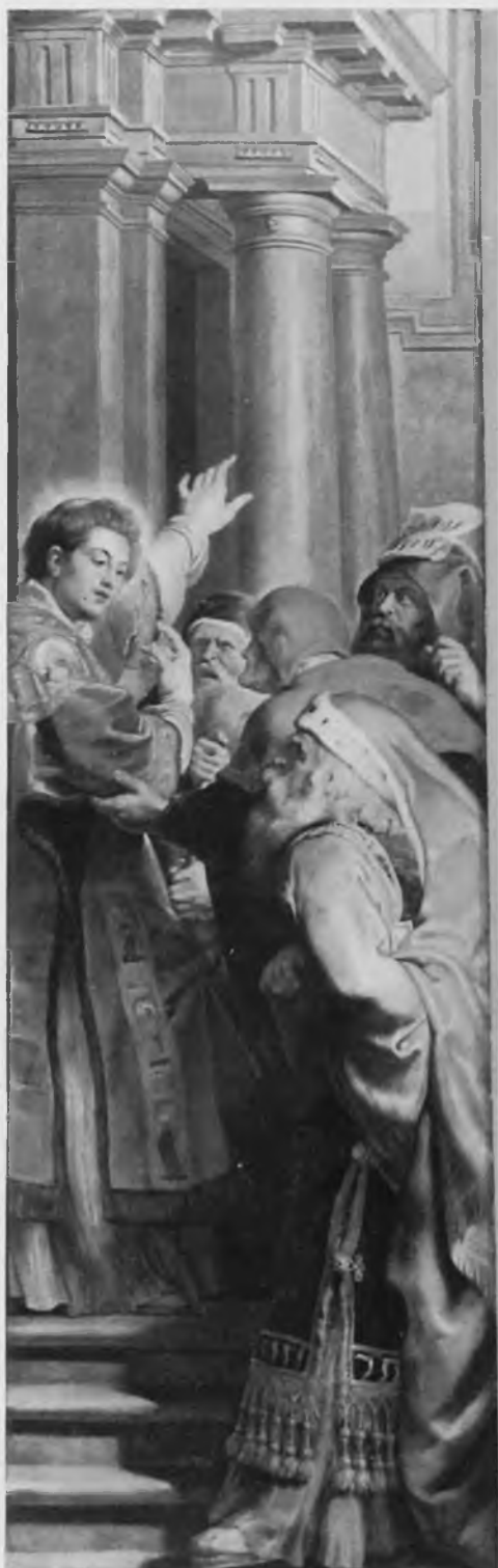
116. Rubens, The Dispute between St. Stephen and the Jewish Elders and Scribes (No. 147). Valenciennes, Musée des Beaux-Arts