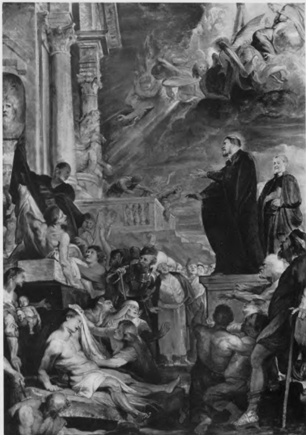
7. Rubens, The Miracles of St. Francis Xavier . oil sketch (No. 104a).