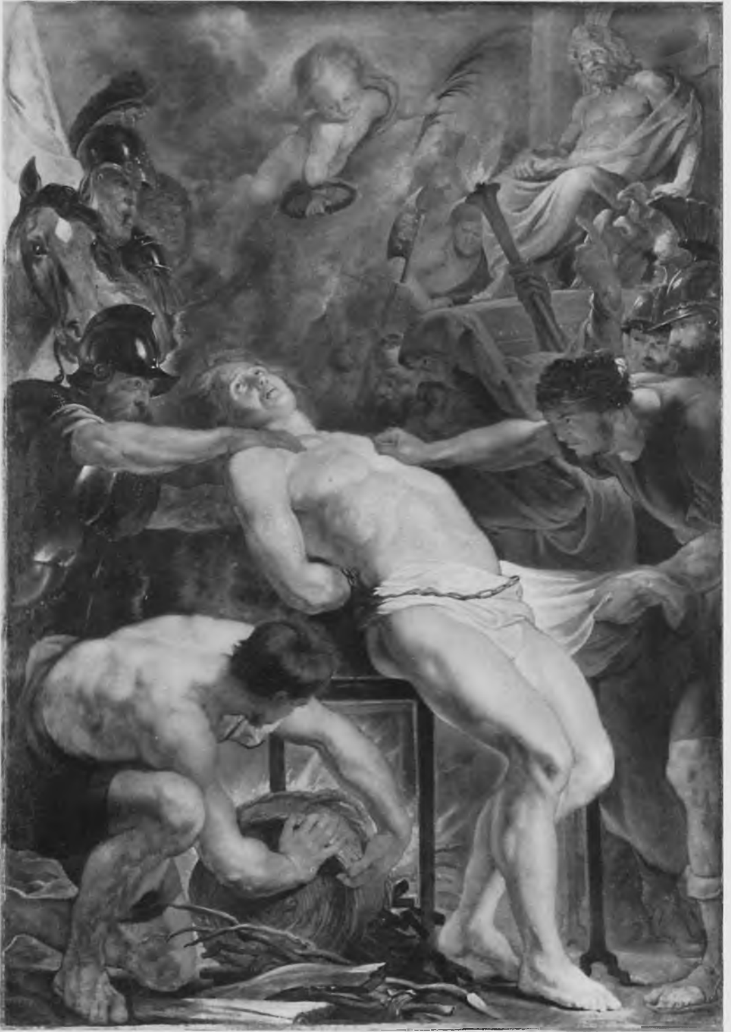
71. Rubens, The Martyrdom of St. Laurence (No. 126). Schleissheim, Schloss