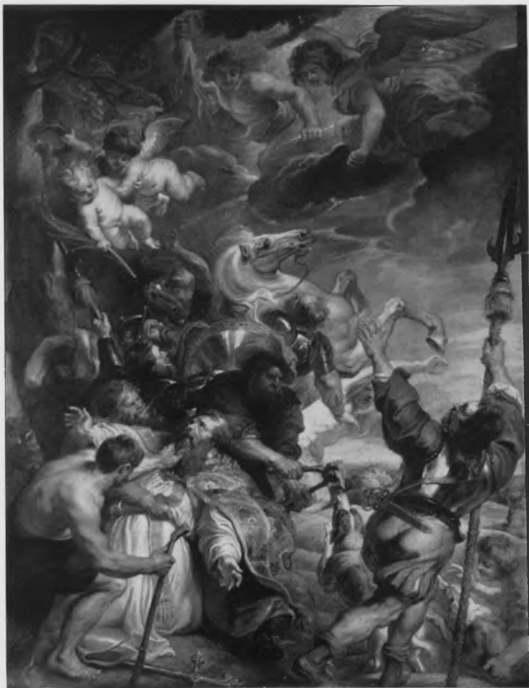
74. Rubens, The Martyrdom of St. Livinus (No. 127). Brussels, Musées Royaux des Beaux-Arts