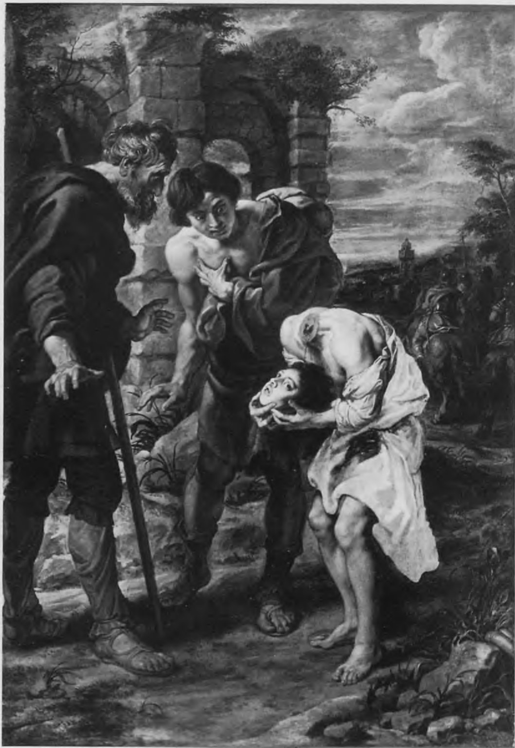
69. Rubens, The Miracle of St. Justus (No. 125). Bordeaux, Musée des Beaux-Arts