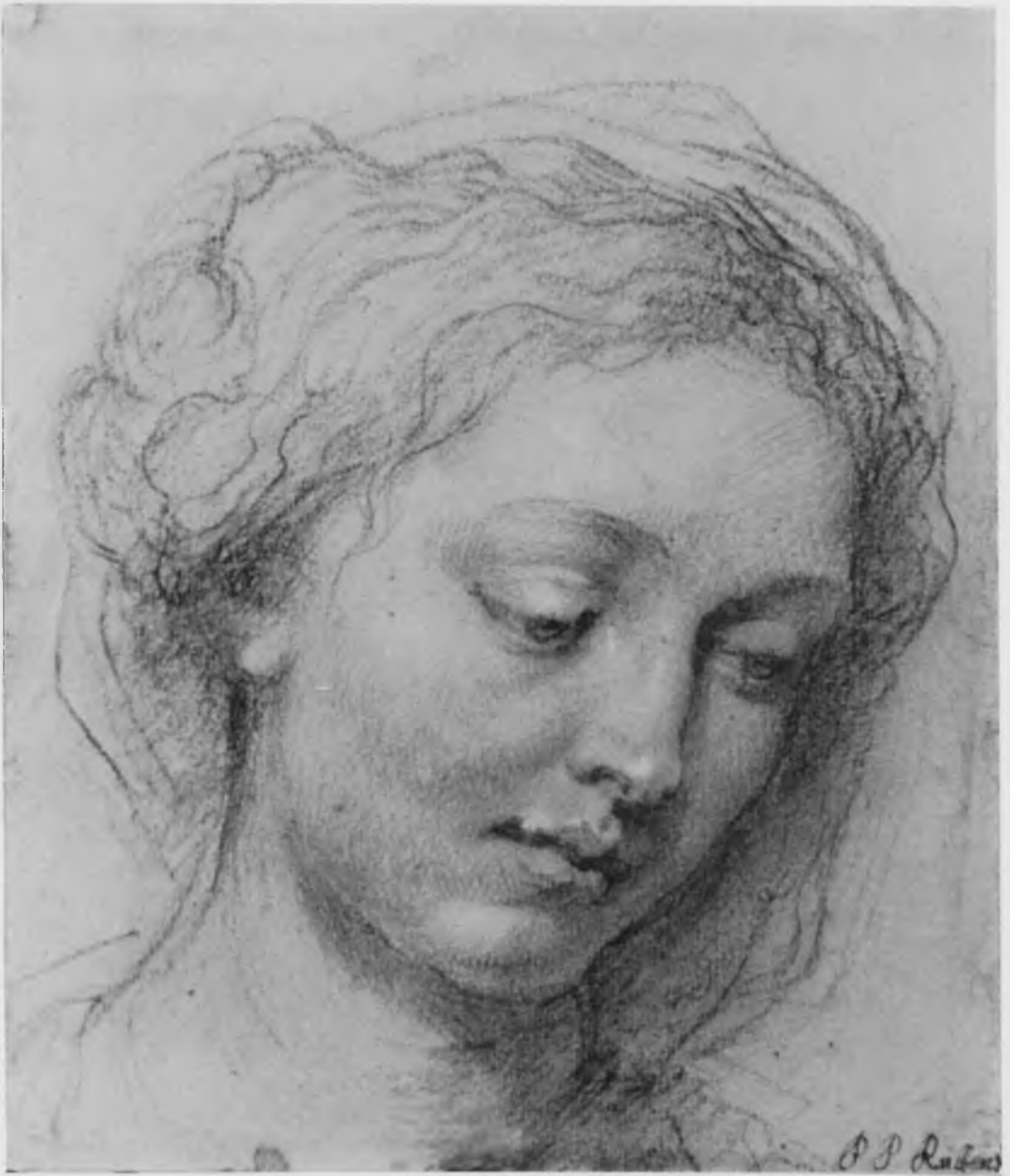
56. Rubens, Study of a Head of a Woman Looking Downward , drawing (No. 117e). Vienna, Albertina