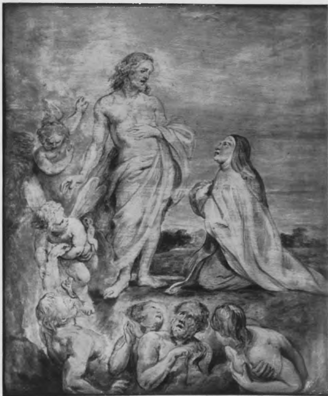
126. Rubens, St. Teresa of Avila Interceding for Bernardino de Mendoza , oil sketch (No. 155a). Lier, Museum Wuyts-van Campen-Caroly