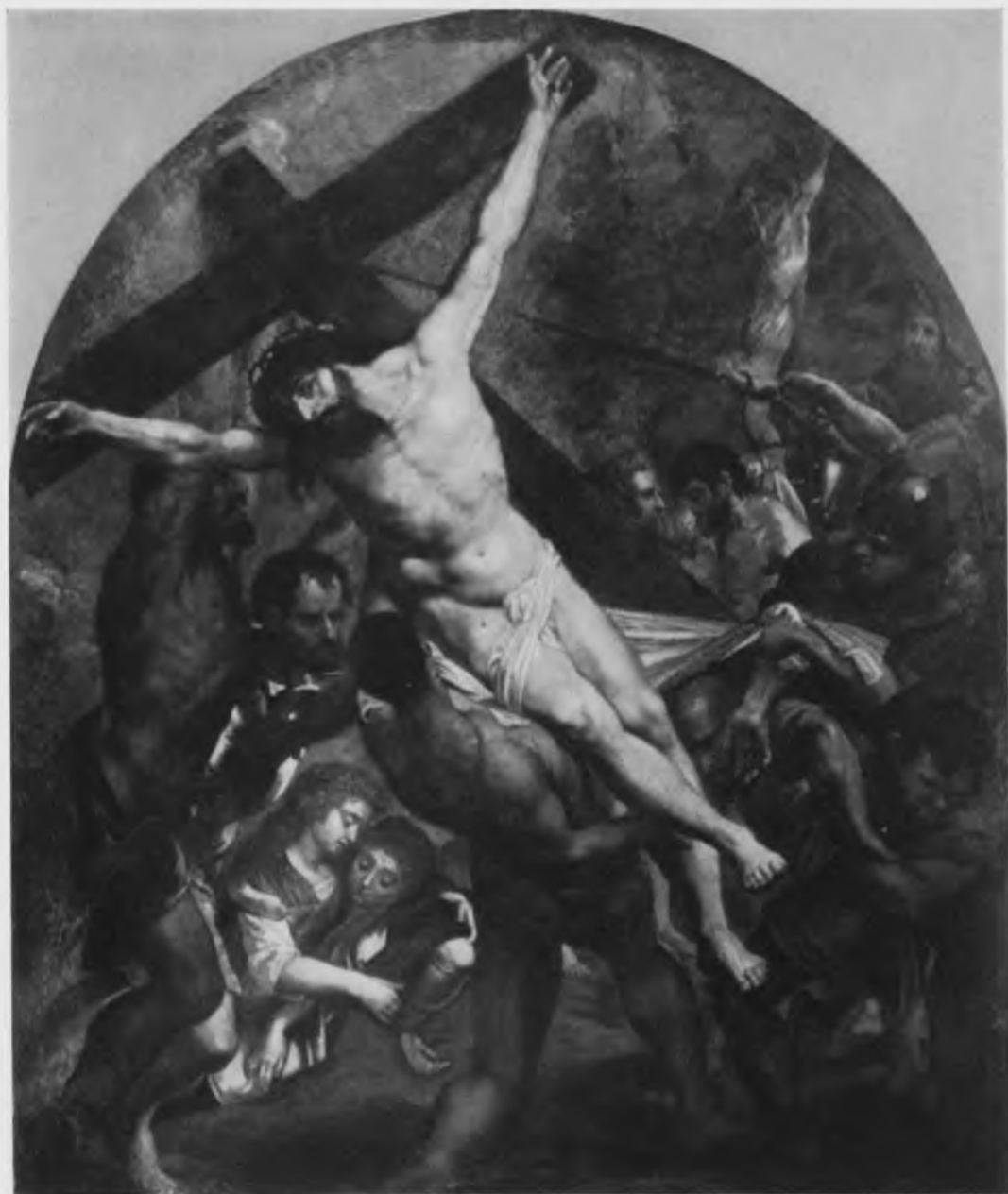
35. After Rubens, The Raising of the Cross (No. 112). Grasse, Chapel of the Municipal Hospital