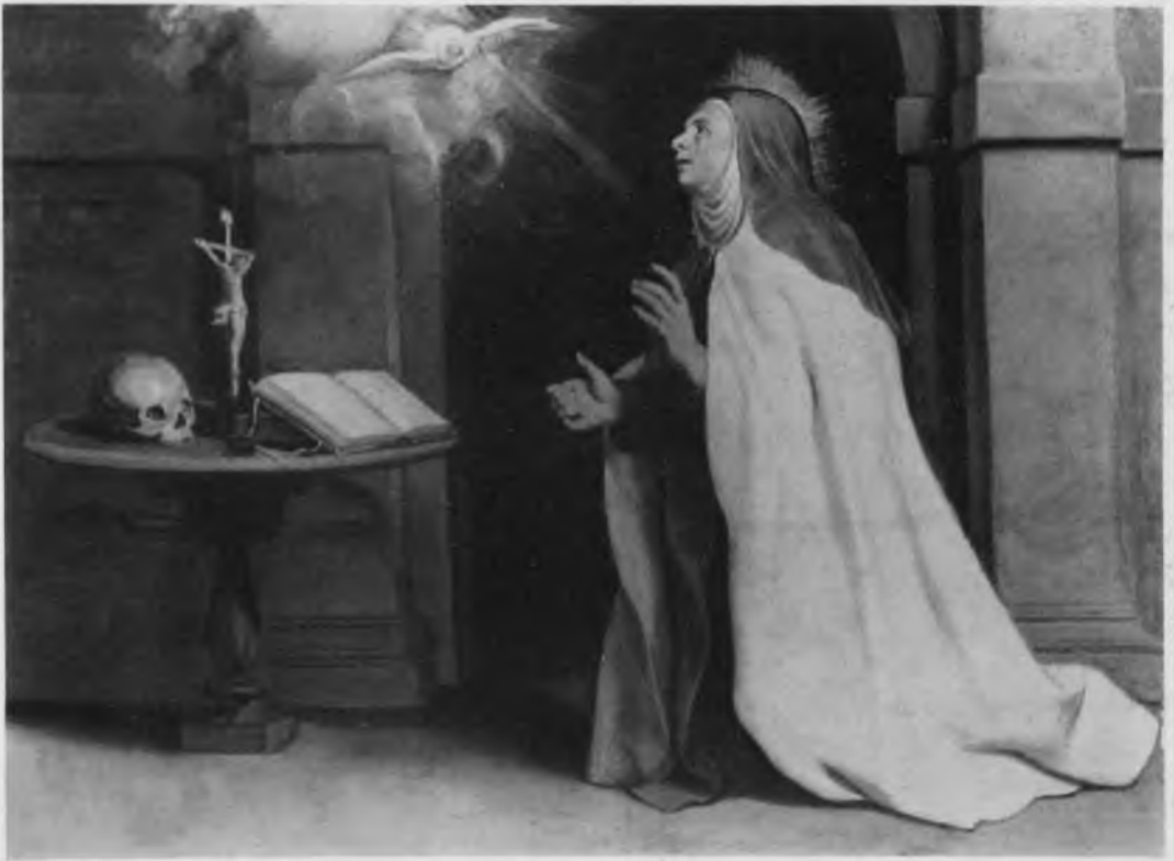
121. Rubens, St. Teresa of Avila's Vision of the Dove (No. 152). Rotterdam, Museum Boymans-van Beuningen