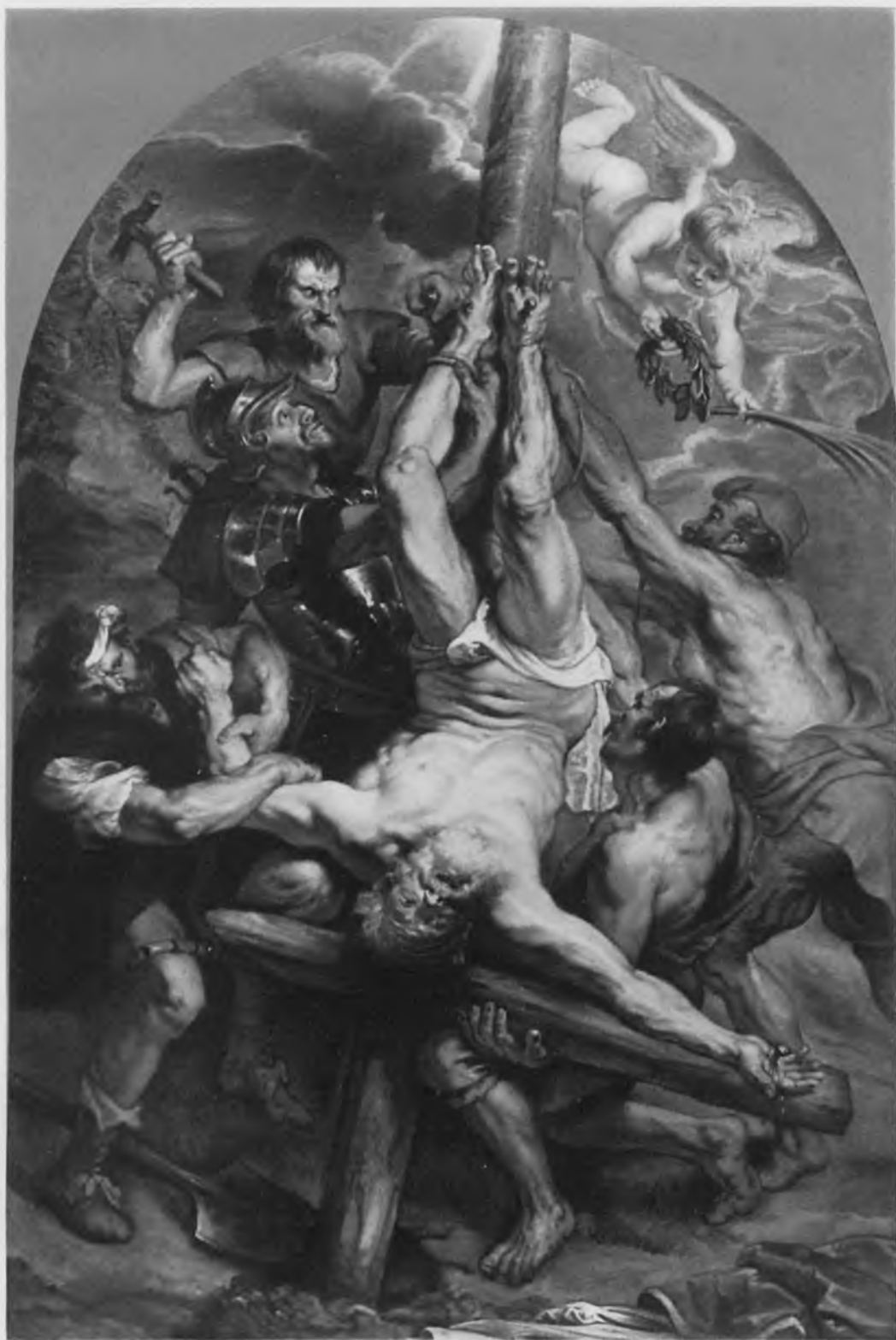
98. Rubens, The Martyrdom of St. Peter (No. 139). Cologne, St. Peter's Church