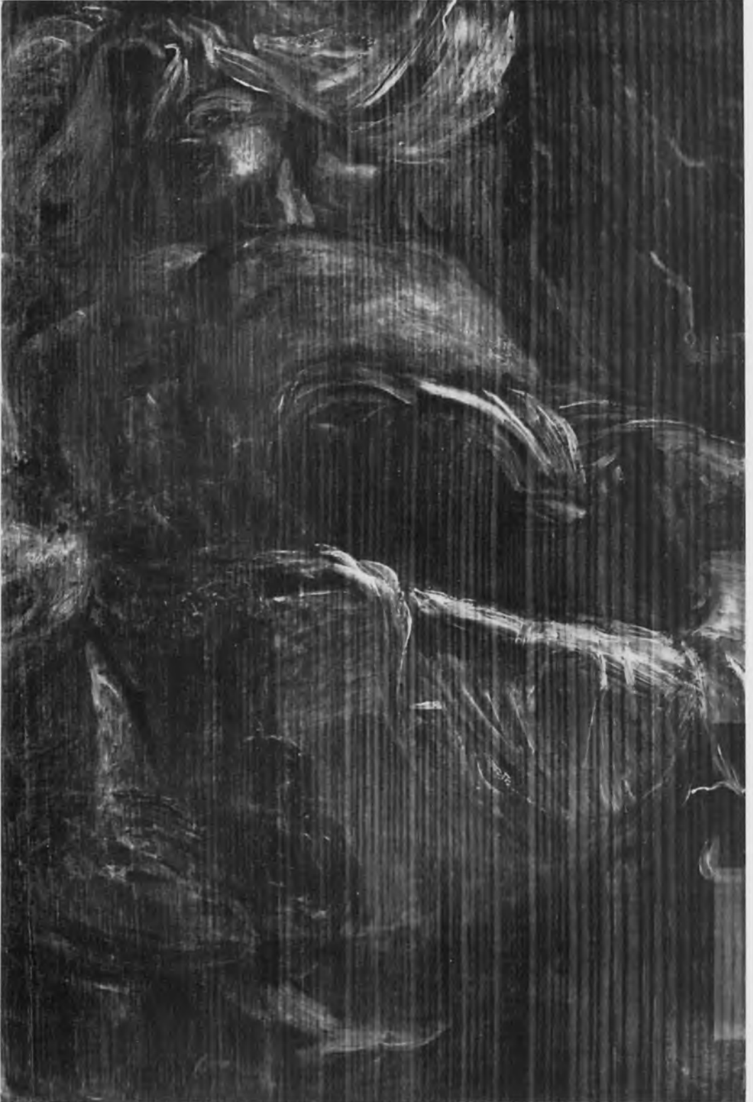
4. X-radiograph of detail of Fig. 2