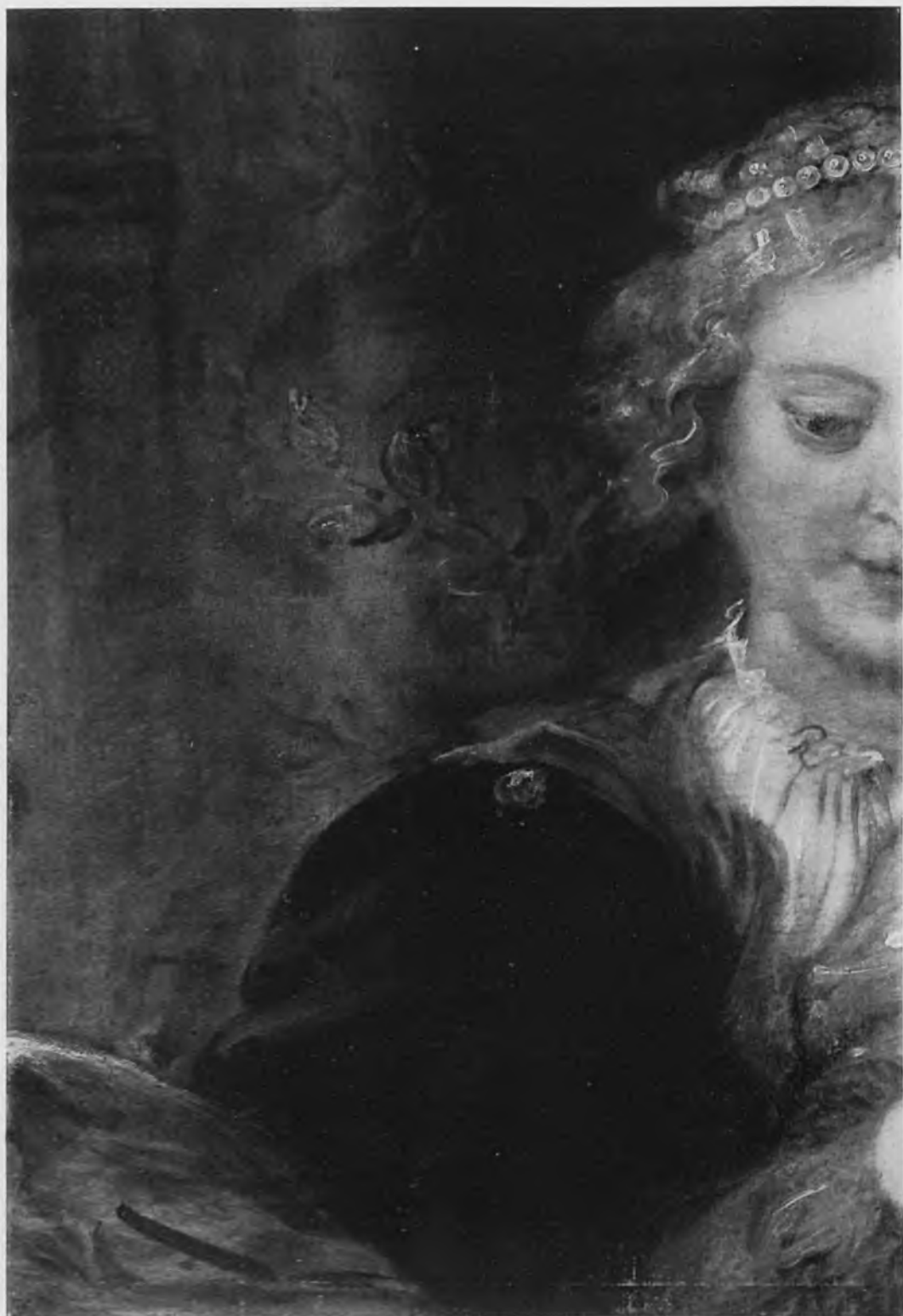
53. Detail of Fig. 50