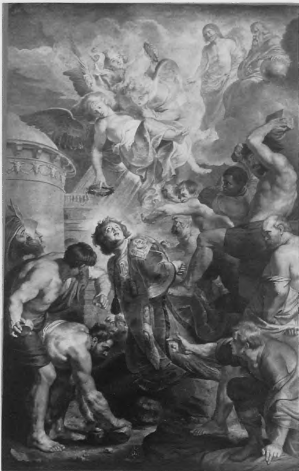
112. Rubens. The Martyrdom of St. Stephen (No. 146).