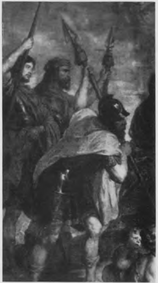
94. Detail of Fig. 92