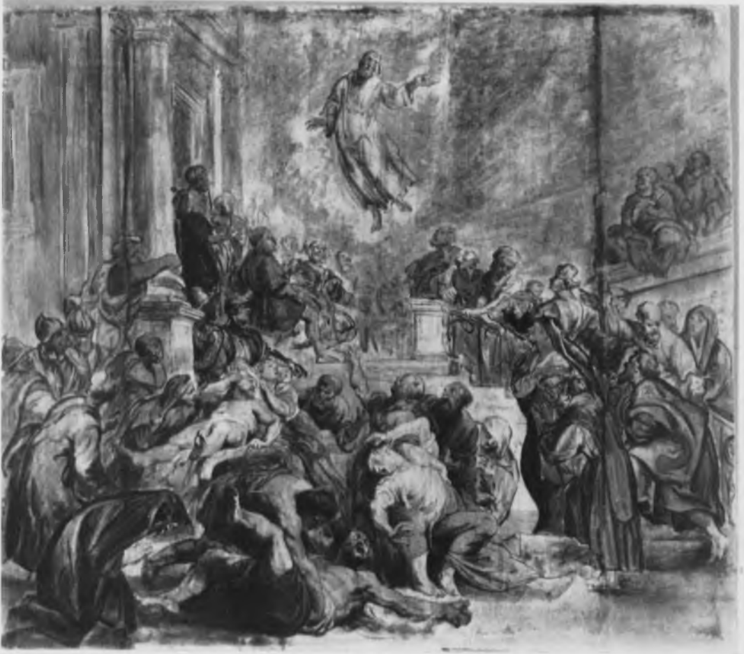
1. Rubens, The Miracles of St. Francis of Paola , oil sketch (No. 103a). Dresden, Gemäldegalerie