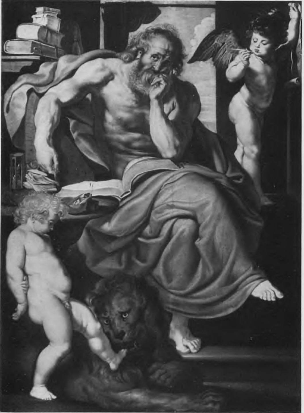
65. Rubens, St. Jerome in his Study (No. 120). Potsdam-Sanssouci, Bildergalerie