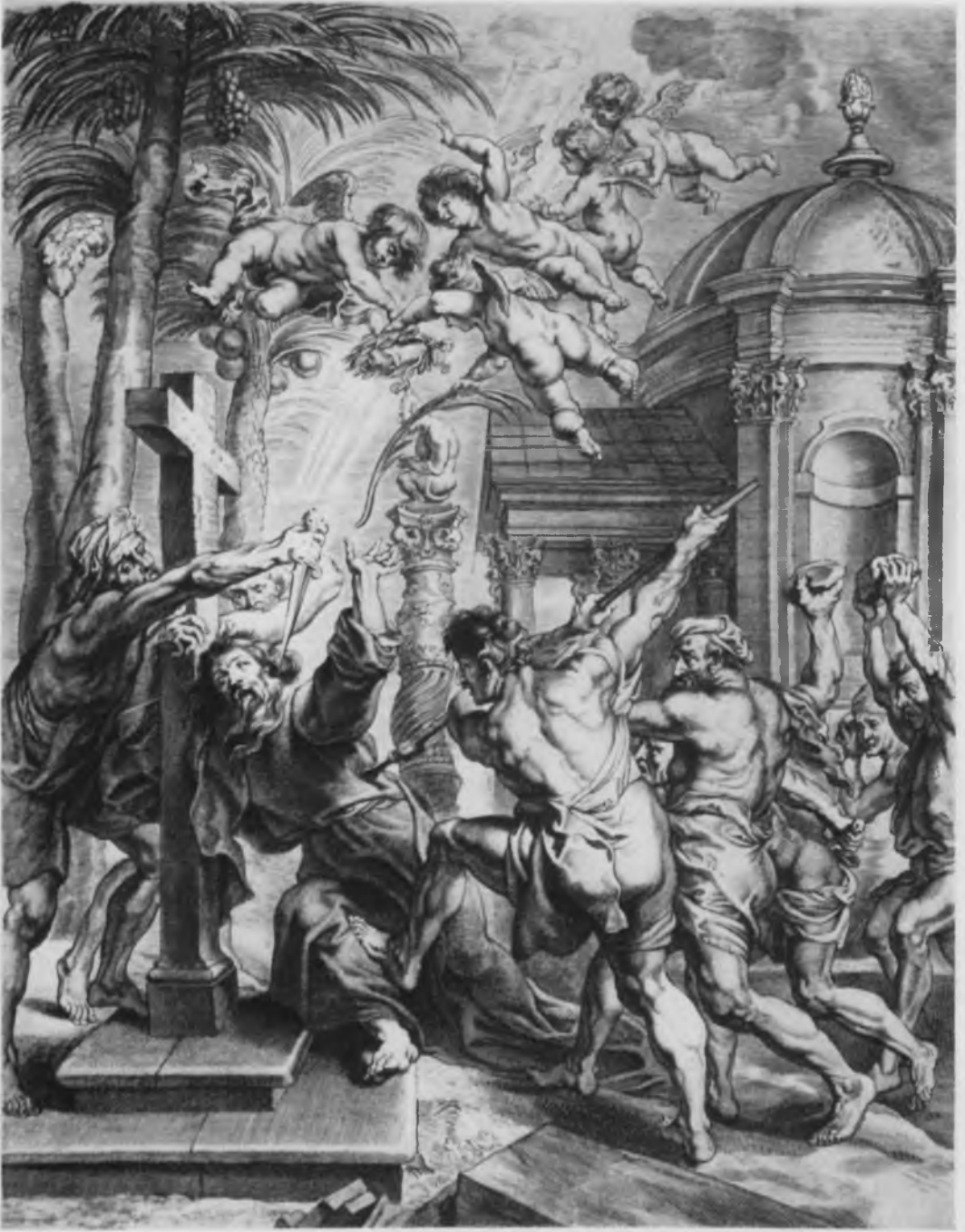
131. J. Neeffs, retouched by Rubens (?), The Martyrdom of St. Thomas , counterproof of engraving (No. 156a). Paris, Bibliothèque Nationale, Cabinet des Estampes