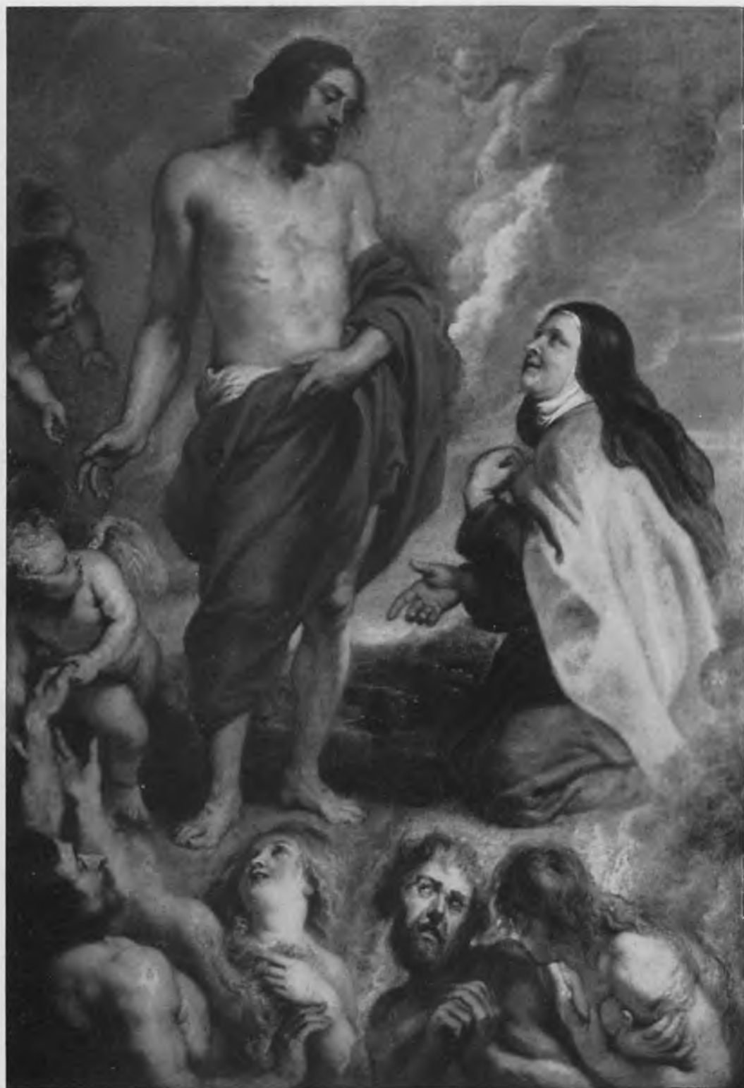
125. Rubens, St. Teresa of Avila Interceding for Bernardino de Mendoza (No. 155). Antwerp, Koninklijk Museum voor Schone Kunsten