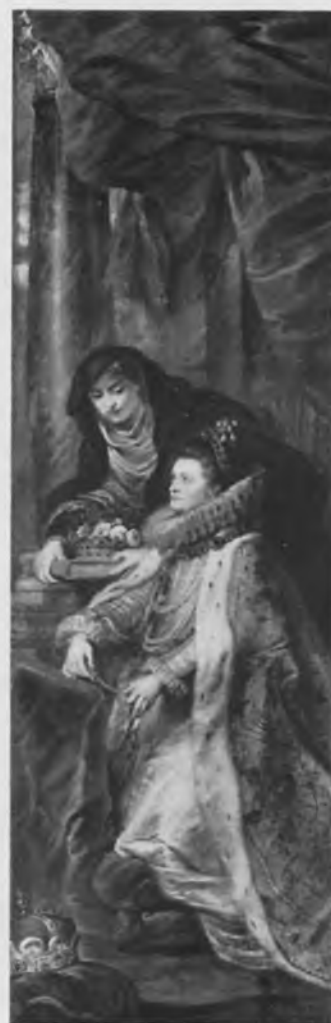
48. Rubens, The Triptych of St. Ildefonso , opened (No. 117). Vienna, Kunsthistorisches Museum