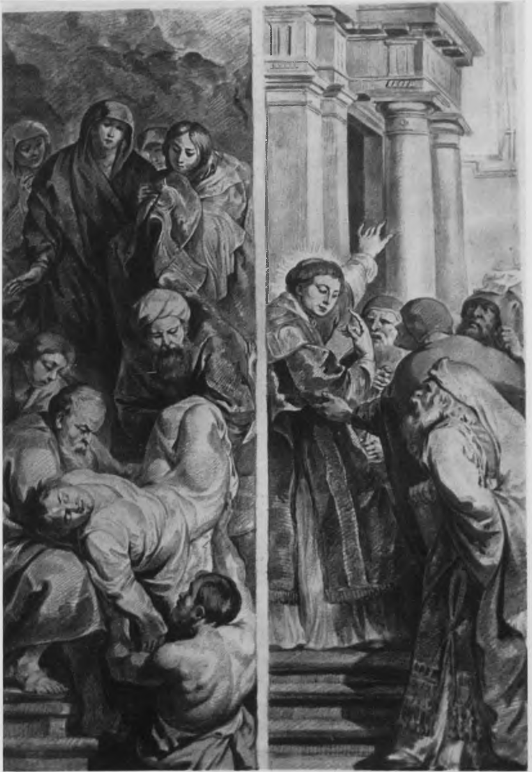
115. L.-J. Watteau, The Entombment of St. Stephen. — The Dispute between St. Stephen and the Jewish Elders and Scribes , drawing (Nos. 147–148). Leningrad, Hermitage