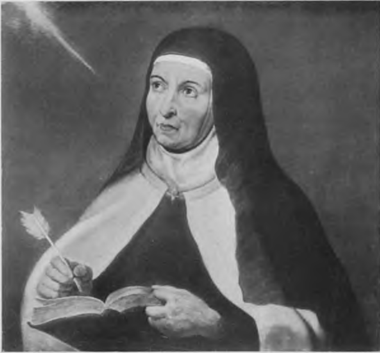
127. Rubens, St. Teresa of Avila Writing under Divine Inspiration (No. 154). Present whereabouts unknown