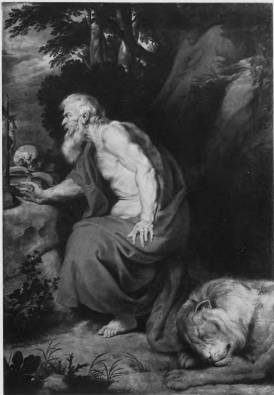
66. Rubens, St. Jerome in the Wilderness (No. 121). Dresden, Gemäldegalerie