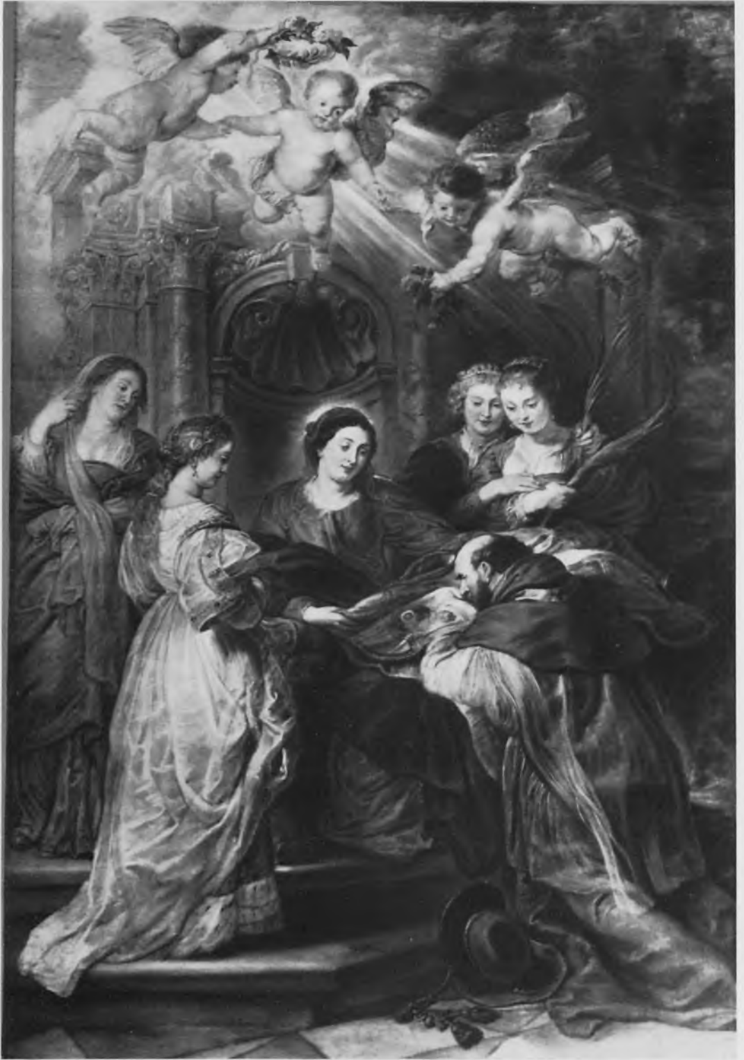
50. Rubens, St. Ildefonso Receiving the Chasuble from the Virgin (No. 117).