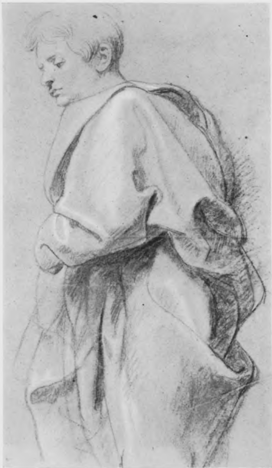
9. Rubens, Study of a Youth Wrapped in a Cloak, Turned to the Left , drawing (No. 104f). Cambridge, Fitzwilliam Museum