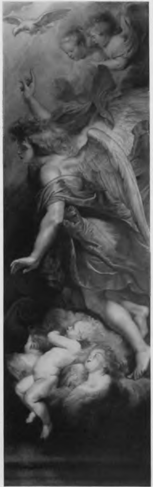
118. Rubens, The Annunciation (No. 149). Valenciennes, Musée des Beaux-Arts