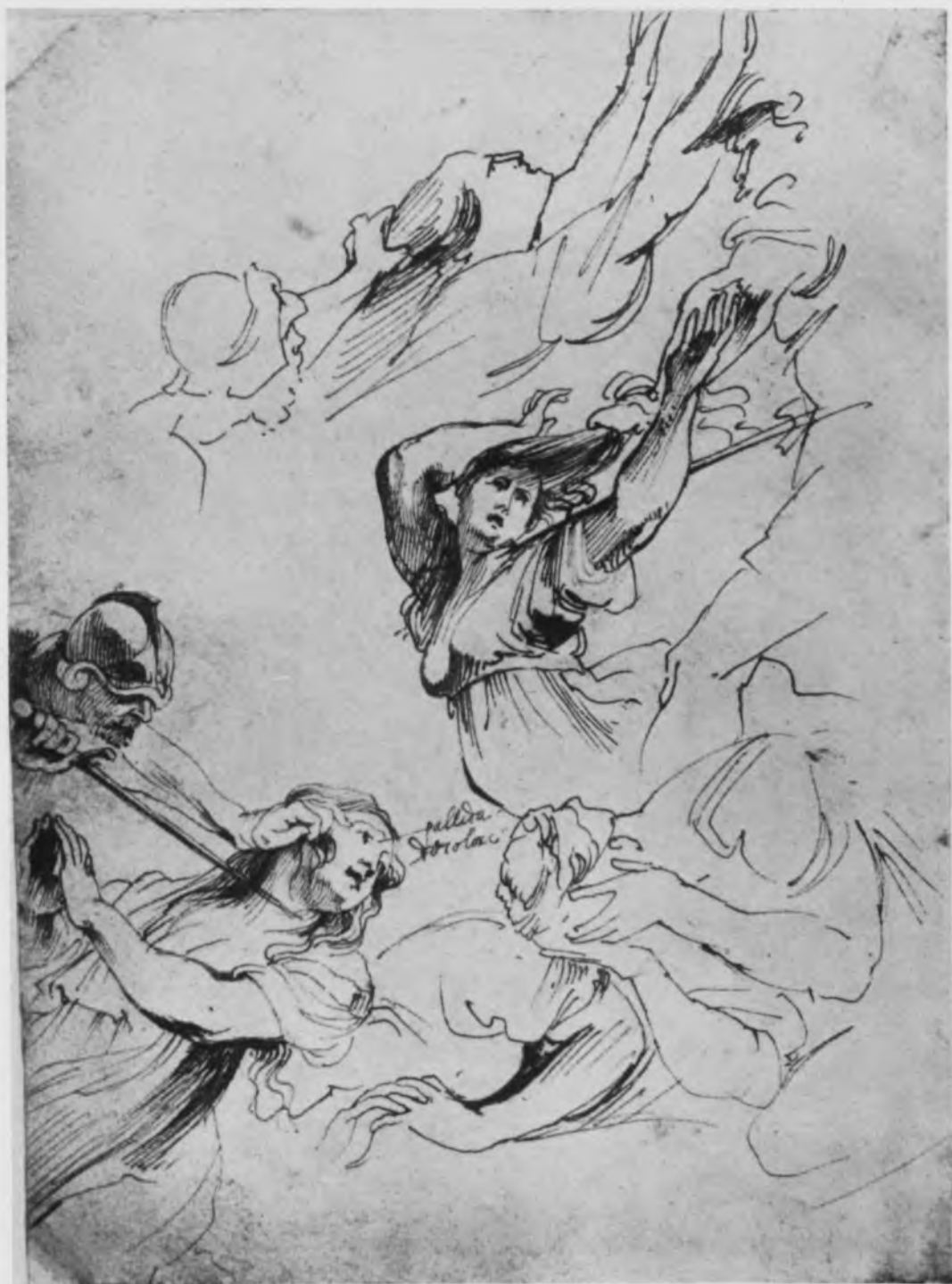
133. A. van Dyck, Figures from the Martyrdom of St. Ursula and her Companions , drawing (No. 159). London, British Museum