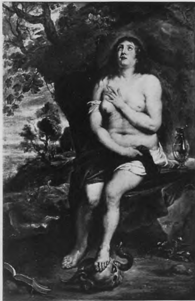
80. After Rubens, St. Magdalen Repentant (No. 130). Milan, Coll. Massimo Cassani