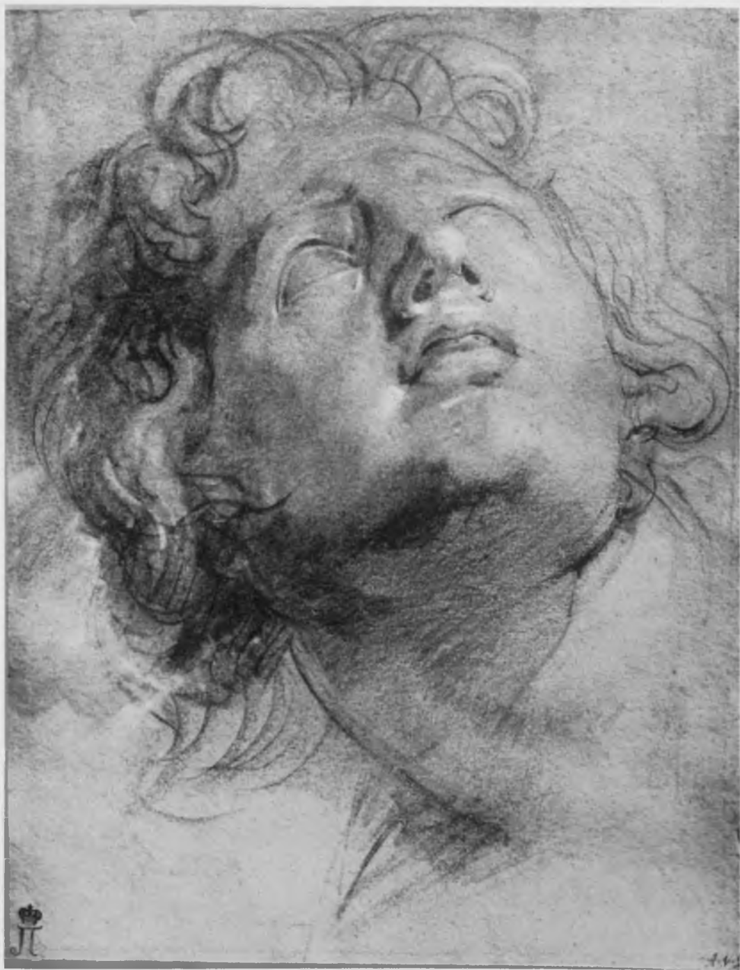
113. Rubens, Study of a Head of a Youth , drawing (No. 146b). Leningrad, Hermitage