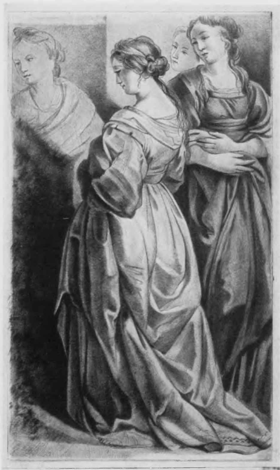
58. C.-H. Watelet, Four Female Figures , etching (No. 117f)