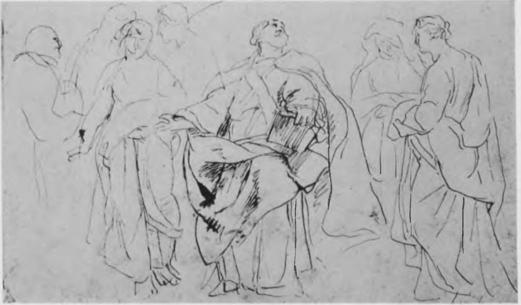
24. Rubens, St. Gregory the Great Surrounded by Other Saints , drawing (No. 109a). Farnham, Coll. Wolfgang Burchard