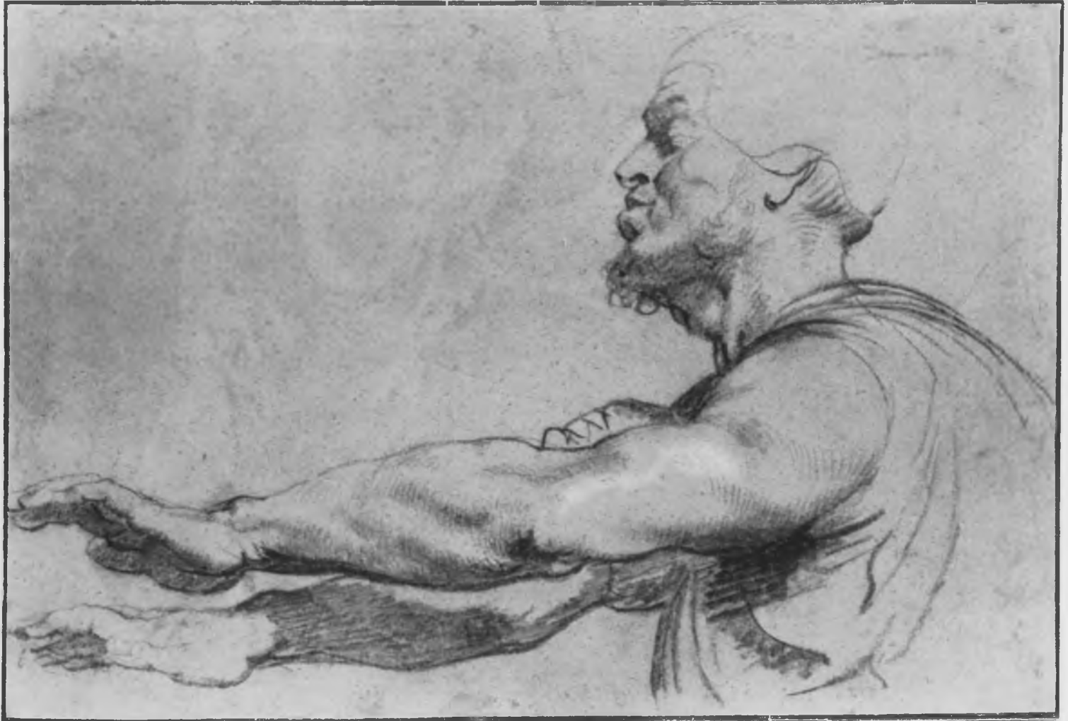
13. Rubens, Study of a Blind Man Stretching his Arms forward , drawing (No. 104d). Vienna, Albertina