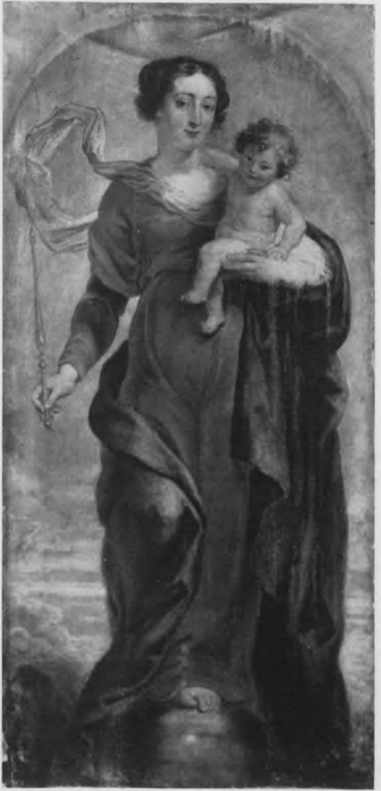
106. Rubens, The Holy Virgin Holding the Infant Christ (No. 143). Alošt, St. Martin's Church