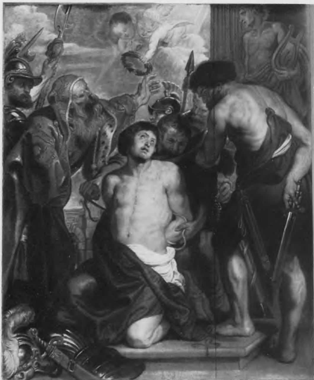
21. Rubens, The Martyrdom of St. George (No. 106). Bordeaux, Musée des Beaux-Arts