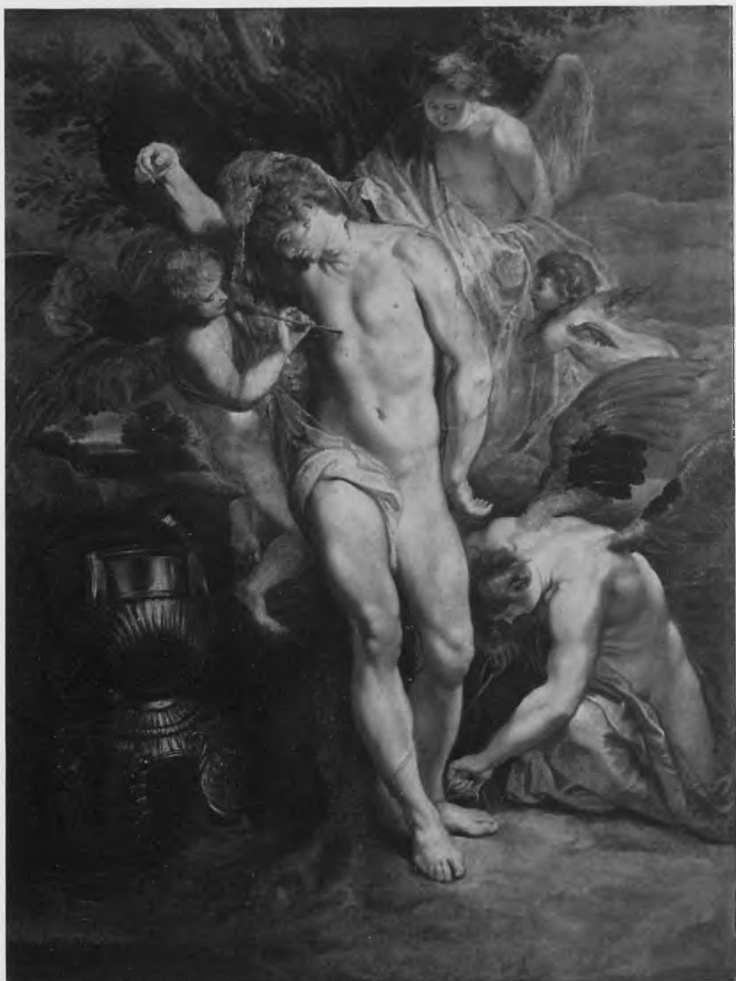
107. Rubens, St. Sebastian (No. 144). Rome, Galleria Corsini