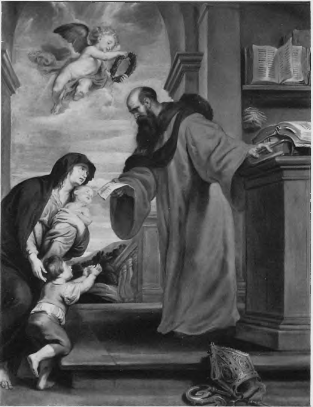
63. Rubens, St. Ives of Tréguier, Defender of Widows and Orphans (No. 119).