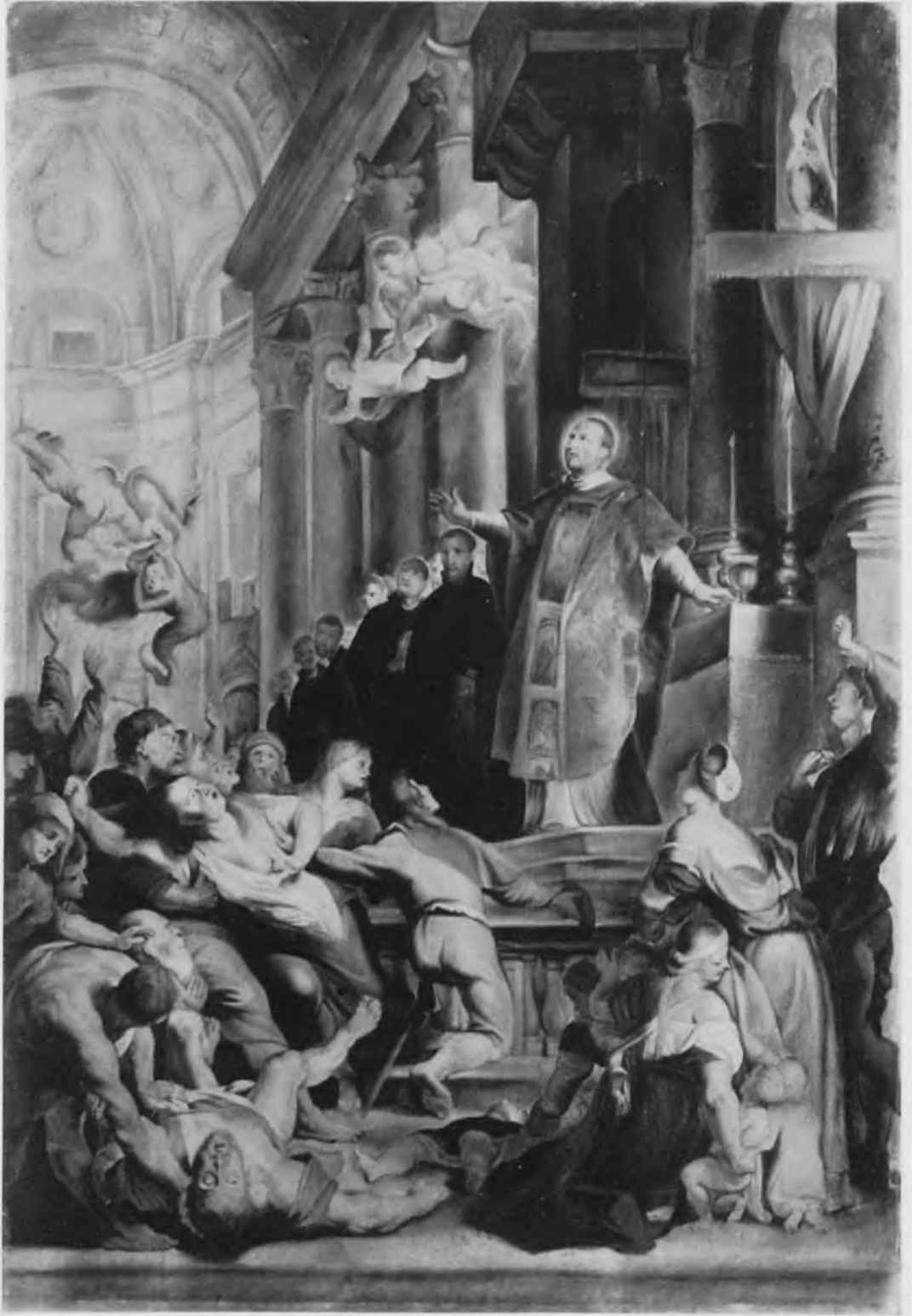
42. After Rubens, The Miracles of St. Ignatius of Loyola (No. 115a).

Munich, Bayerische Staatsgemäldesammlungen