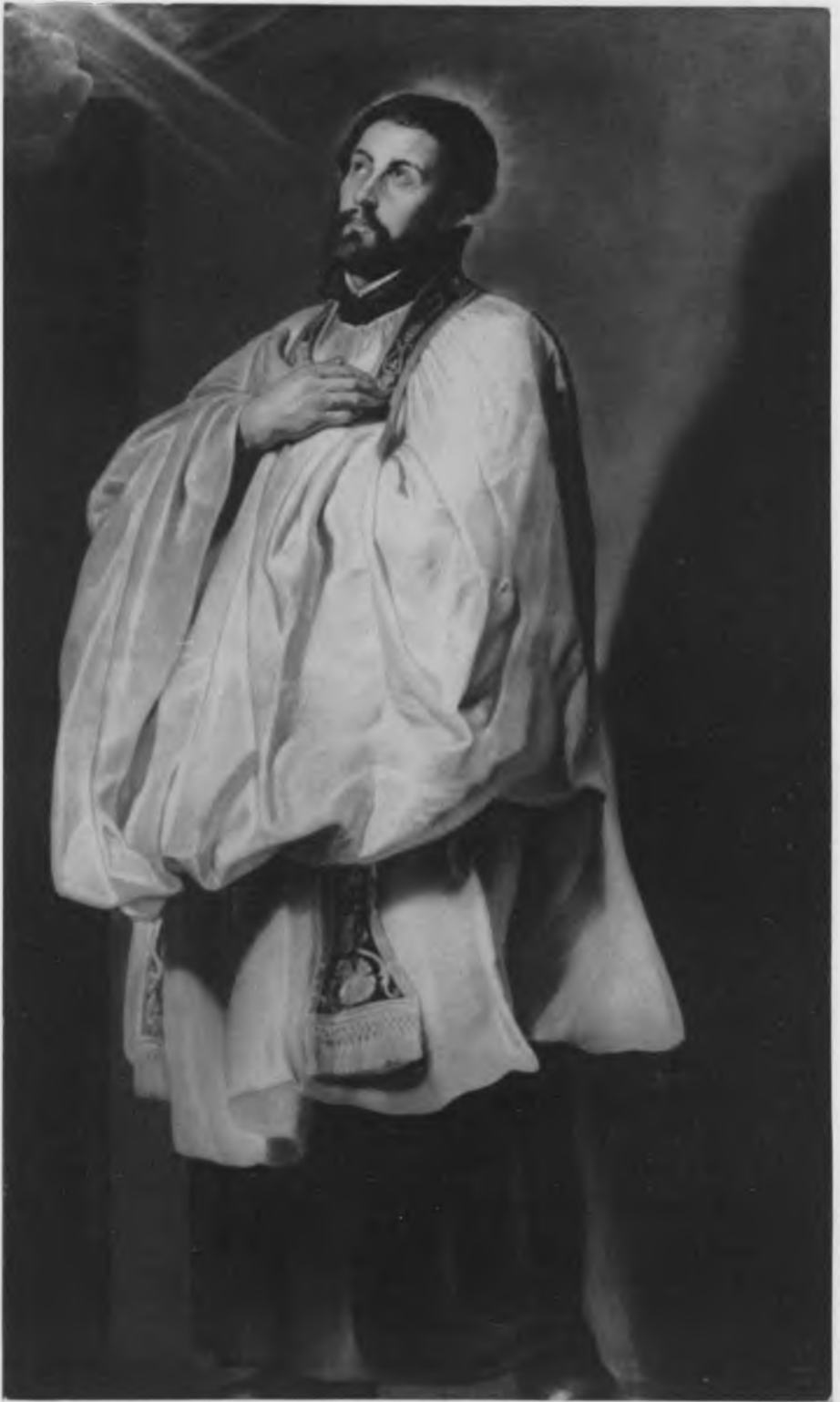
37. Rubens, St. Francis Xavier (No. 114).