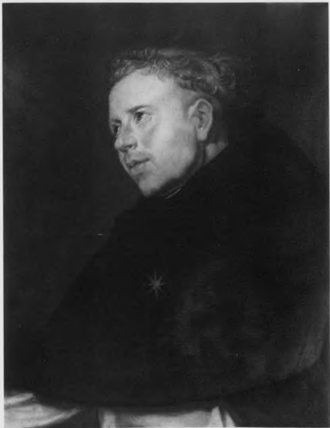
129. After Rubens, St. Thomas Aquinas (No. 157).

Antwerp, Koninklijk Museum voor Schone Kunsten