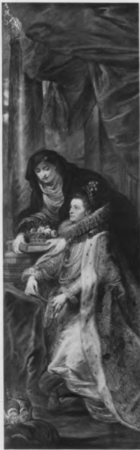
52. Rubens, The Infanta Isabella with her Patron St. Elizabeth of Hungary (No. 117). Vienna, Kunsthistorisches Museum