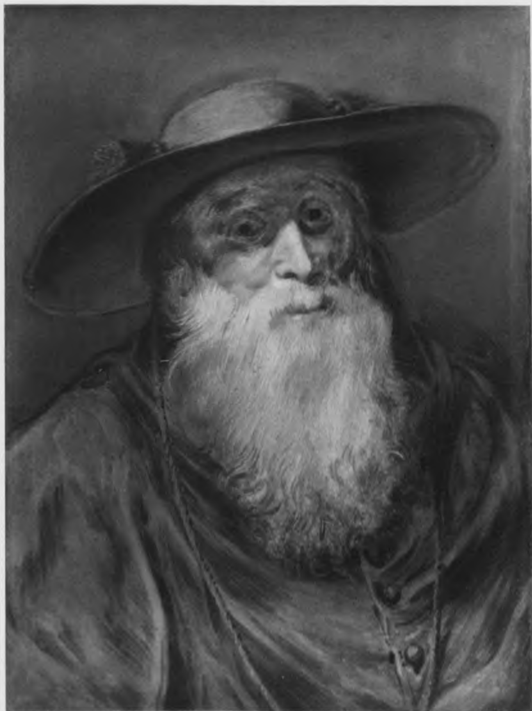
64. Rubens, St. Jerome in the Robes of a Cardinal (No. 122). Vienna, Kunsthistorisches Museum