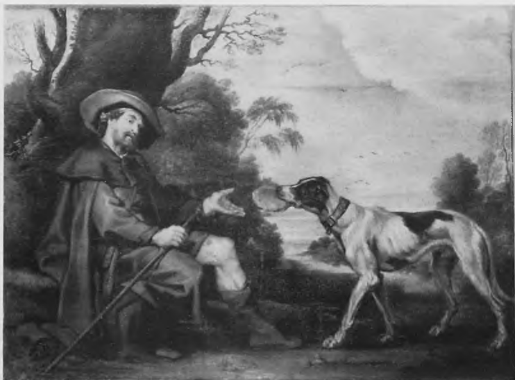
104. School of Rubens, St. Roch Fed by a Dog (No. 141). Alošt, St. Martin's Church