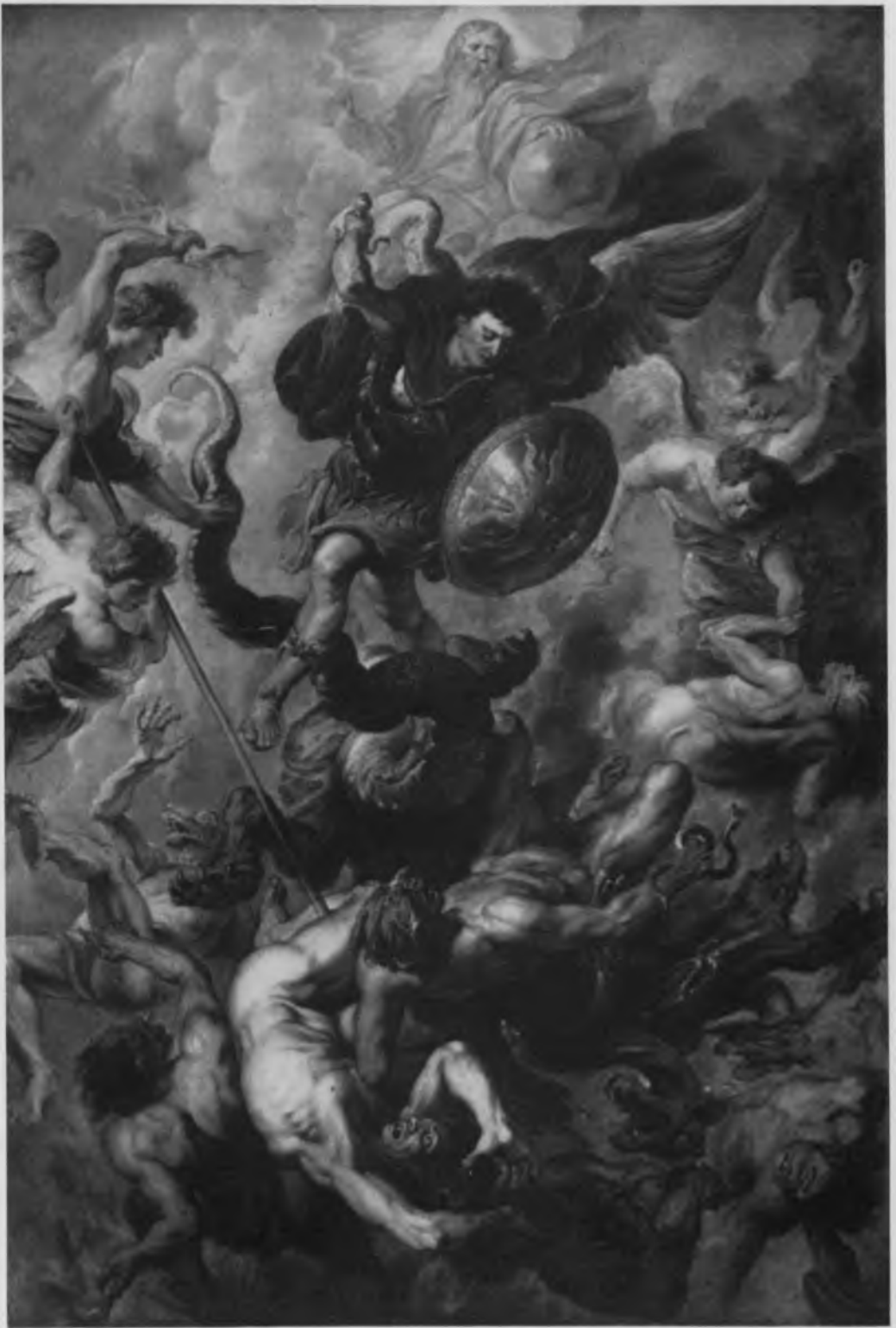
89. Rubens, St. Michael Striking down the Rebellious Angels (No. 135).