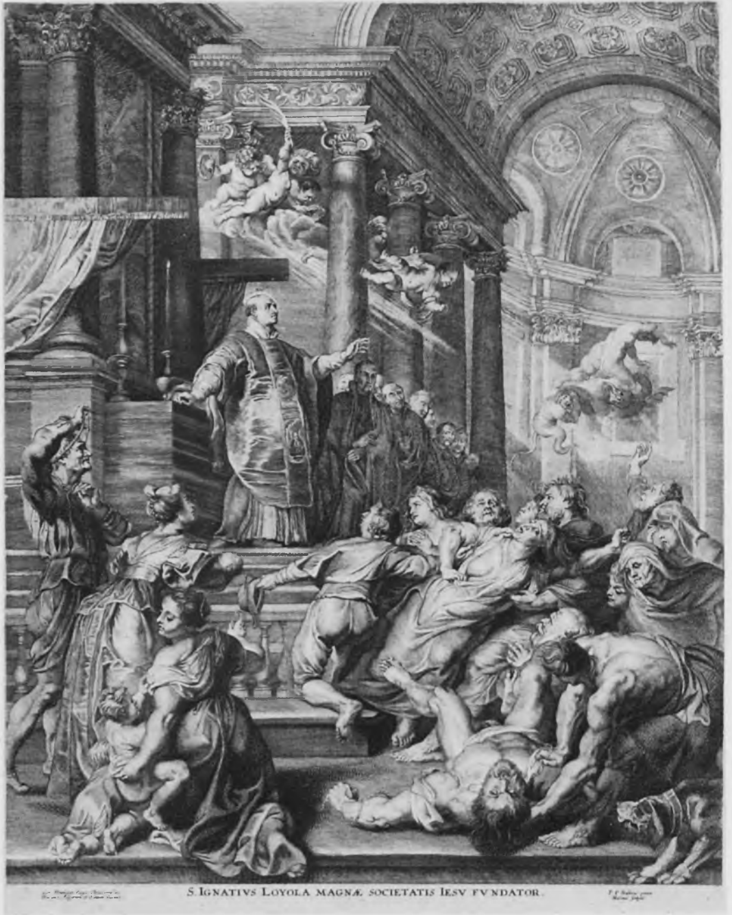
44. M. van der Goes, The Miracles of St. Ignatius of Loyola , engraving (No. 115c)