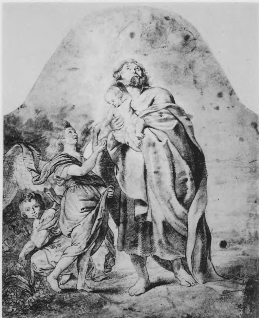
67. After Rubens, St. Joseph and the Infant Christ , drawing (No. 124).