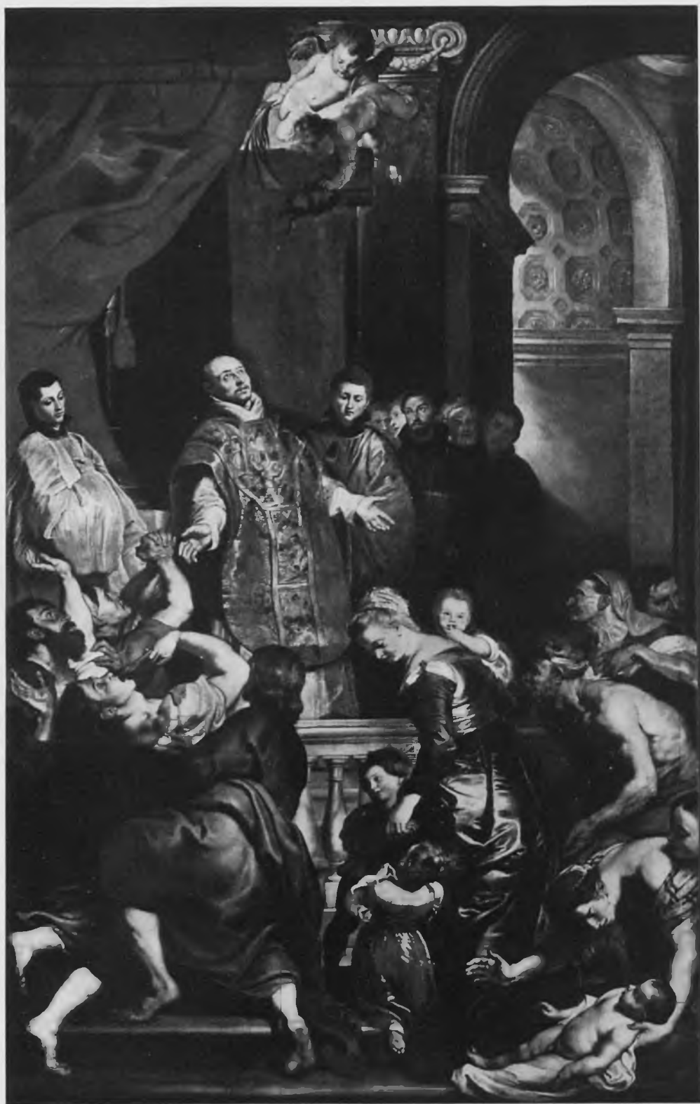
46. Rubens, The Miracles of St. Ignatius of Loyola (No. 116). Genoa, Sant' Ambrogio