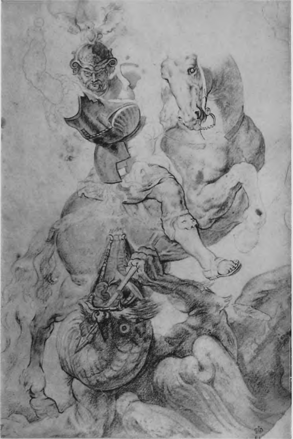
19. After Rubens, St. George Slaying the Dragon , drawing (No. 105). Leningrad, Hermitage