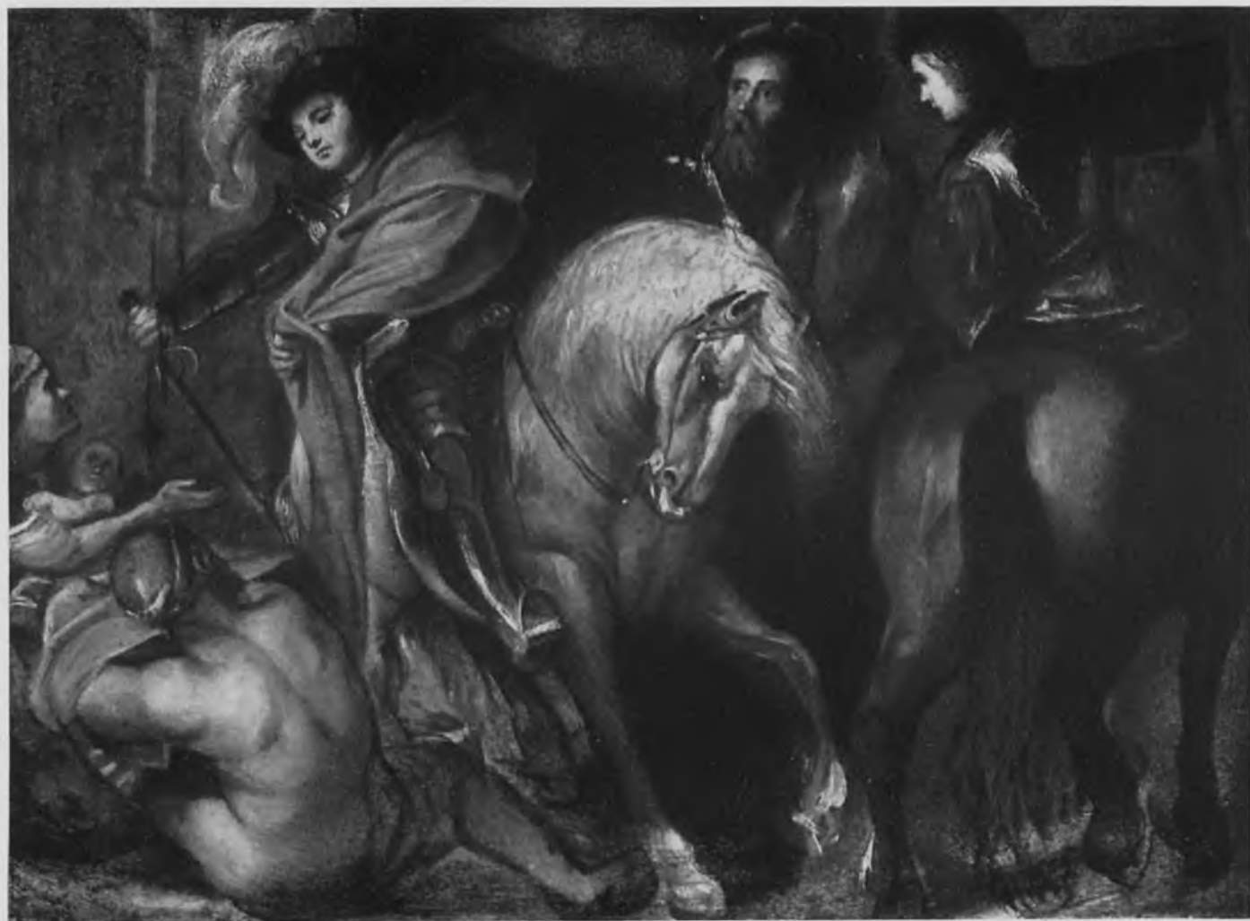
84. Rubens, St. Martin of Tours Dividing his Cloak , oil sketch (No. 132). Present whereabouts unknown