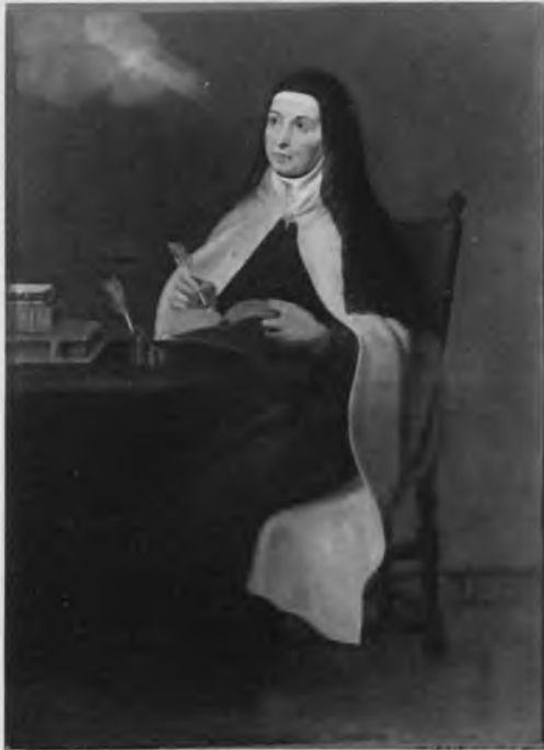
128. After Rubens, St. Teresa of Avila Writing under Divine Inspiration (No. 154). Brussels, Convent of the Carmelite Nuns