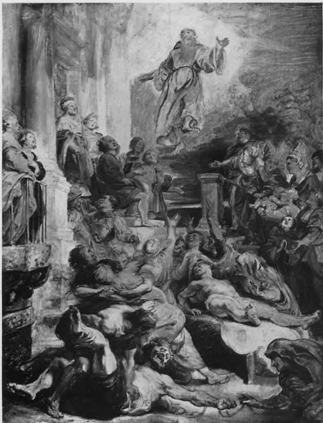
2. Rubens, The Miracles of St. Francis of Paola , oil sketch (No. 103b). Munich, Alte Pinakothek