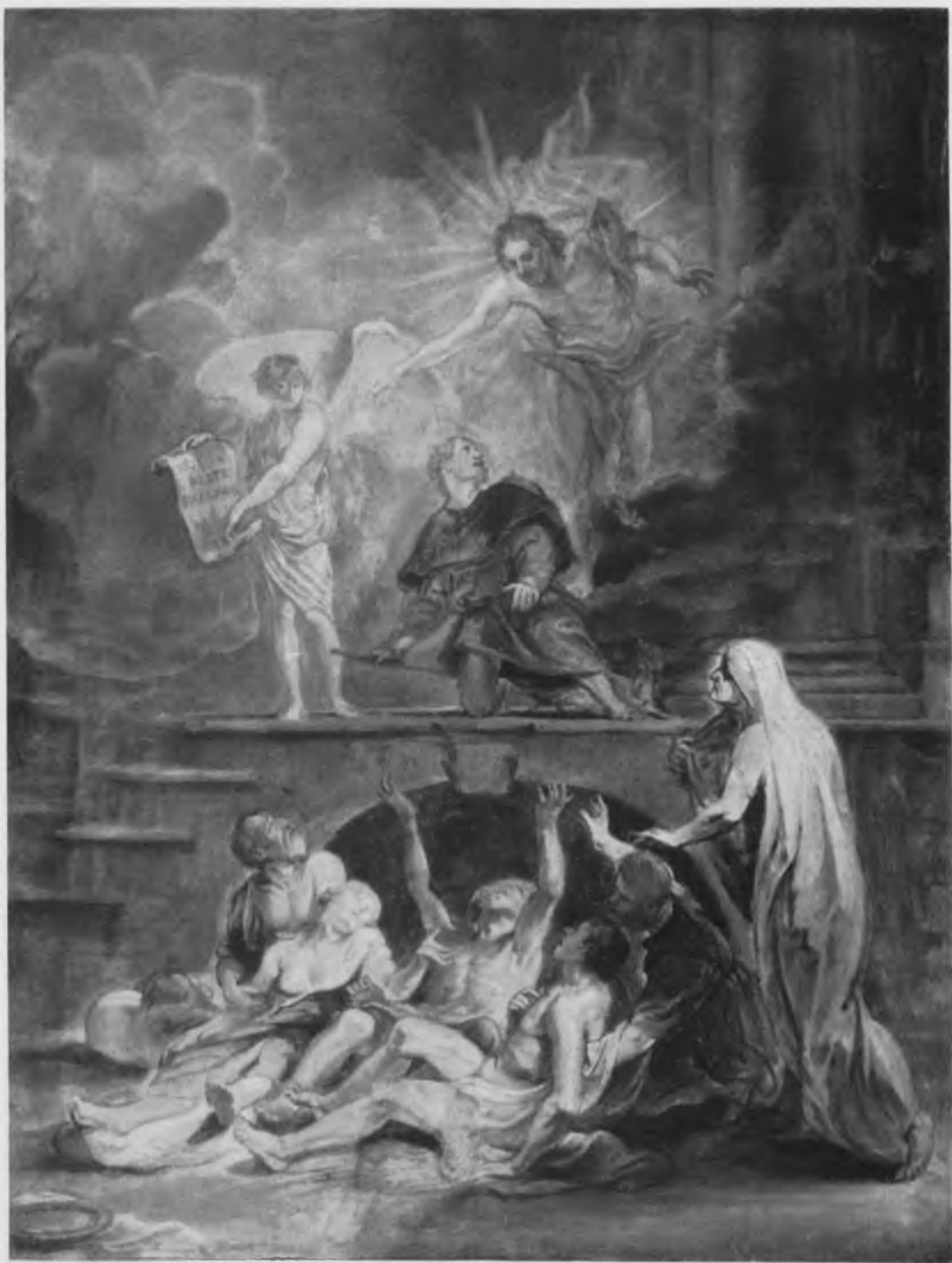
101. Rubens, St. Roch Interceding for the Plague-Stricken , oil sketch (No. 140a).