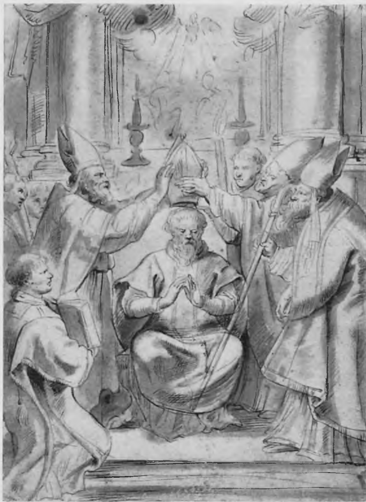
138. After Rubens, The Enthronization of a Holy Bishop , drawing (No. 160). Antwerp, Rubenianum