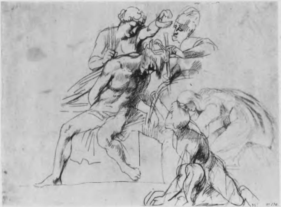
33. Rubens, The Mocking of Christ , drawing (No. 111a).