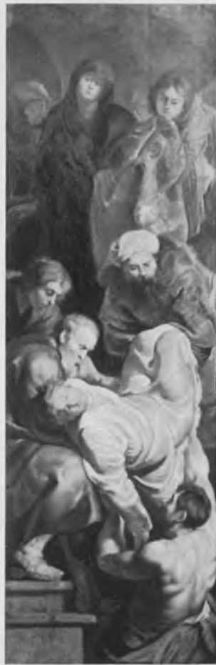
109. Rubens, The Triptych of St. Stephen , opened. Valenciennes, Musée des Beaux-Arts