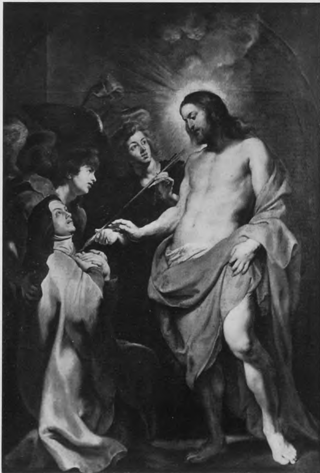
119. Rubens, The Transverberation of St. Teresa of Avila (No. 150). Formerly London, Asscher and Welker, now lost