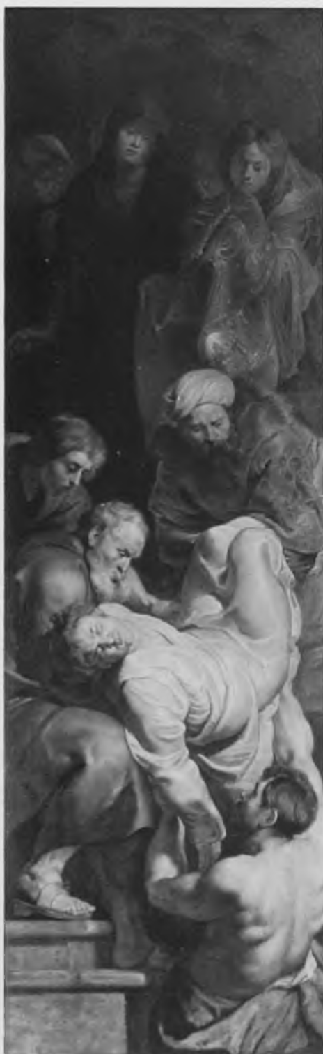
117. Rubens, The Entombment of St. Stephen (No. 148). Valenciennes, Musée des Beaux-Arts