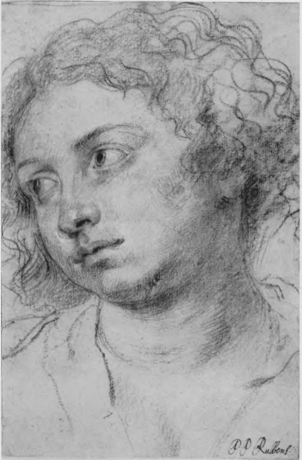
54. Rubens, Study of a Head of a Woman Turned to the Left , drawing (No. 117d).