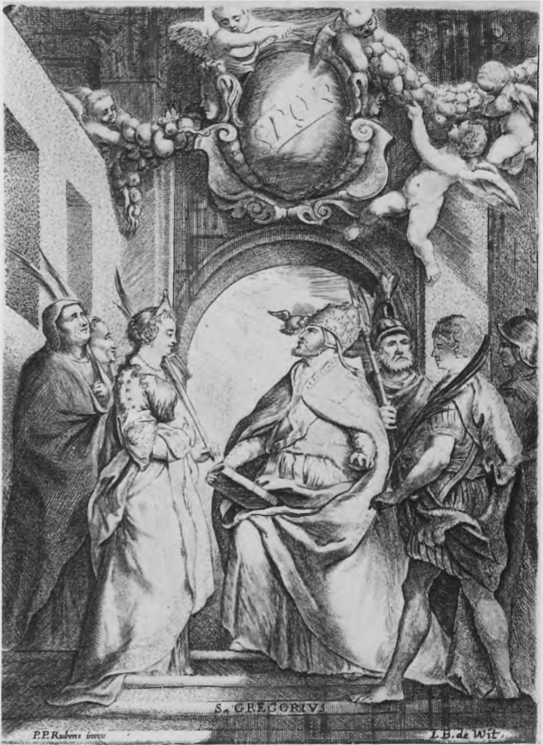
29. J.B. de Wit, St. Gregory the Great Surrounded by Other Saints , engraving (No. 109f)