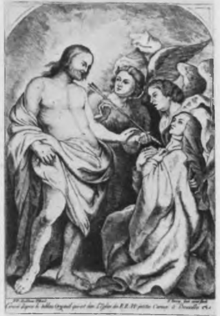
120. F. Deroy, The Transverberation of St. Teresa of Avila , etching (No. 150).