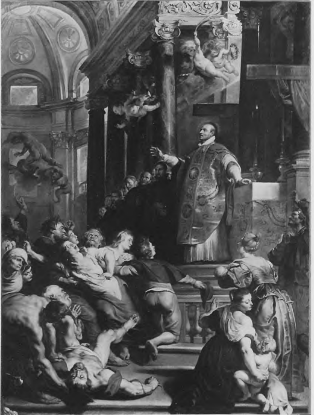
40. Rubens, The Miracles of St. Ignatius of Loyola (No. 115). Vienna, Kunsthistorisches Museum