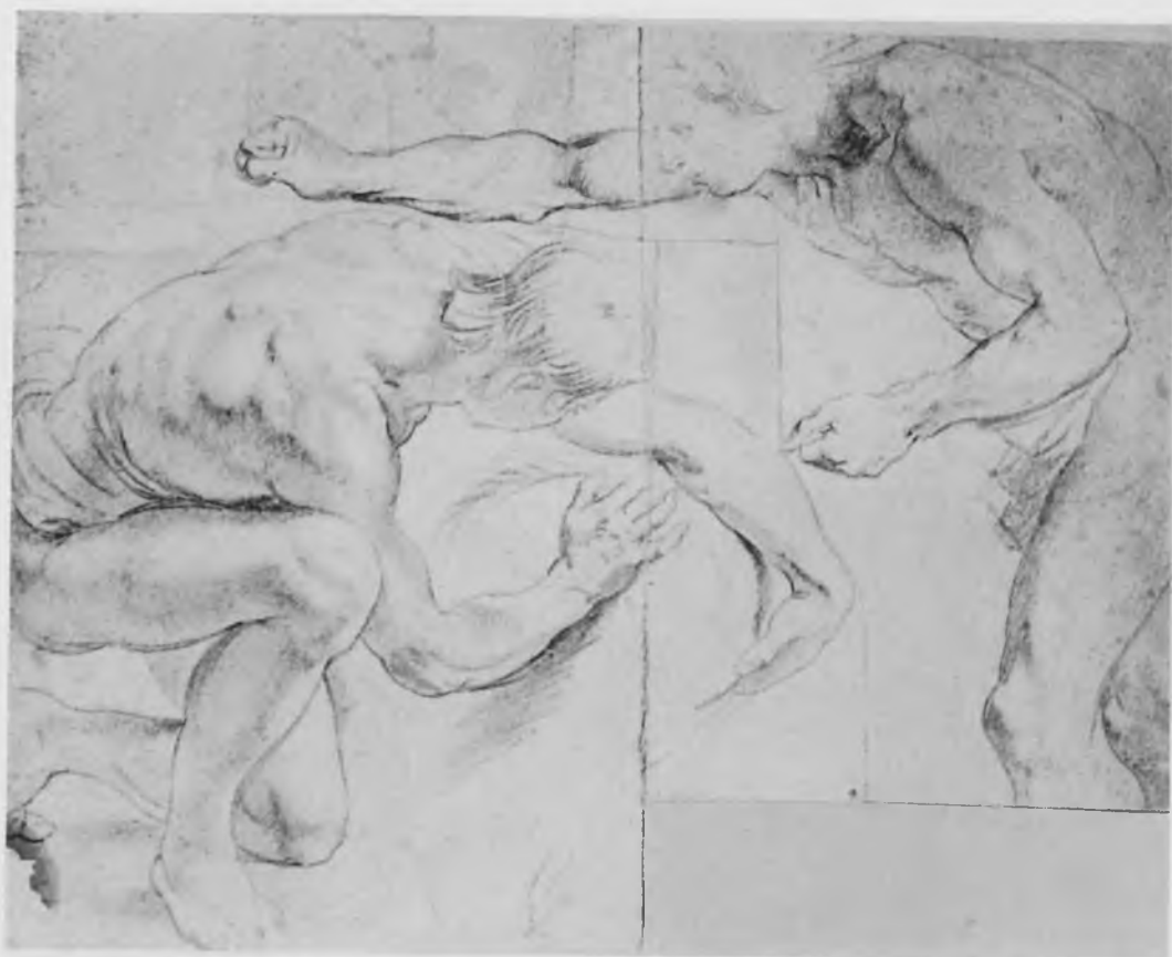
73. Rubens, Study of Two Semi-Nude Men , drawing (No. 126a). Stockholm, Nationalmuseum