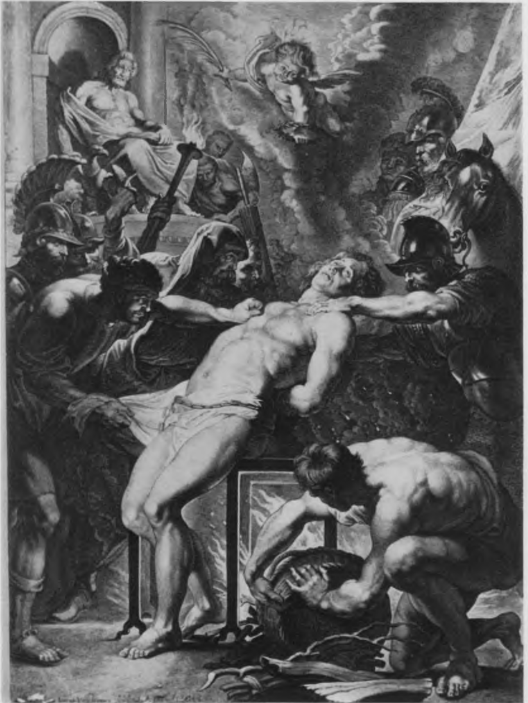
72. L. Vorsterman, retouched by Rubens (?), The Martyrdom of St. Laurence , engraving (No. 126b). Amsterdam, Rijksprentenkabinet