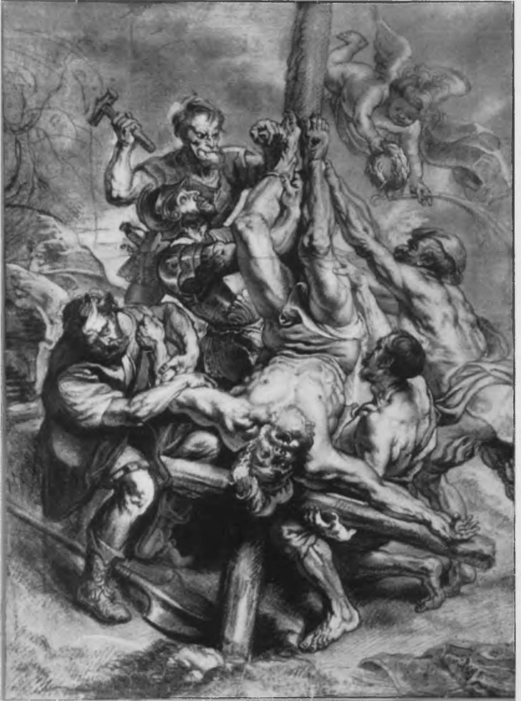
99. ? Retouched by Rubens, The Martyrdom of St. Peter , drawing (No. 139a).