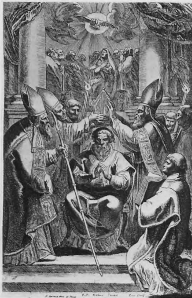
139. P. Soutman, The Enthronization of a Holy Bishop , etching (No. 160)