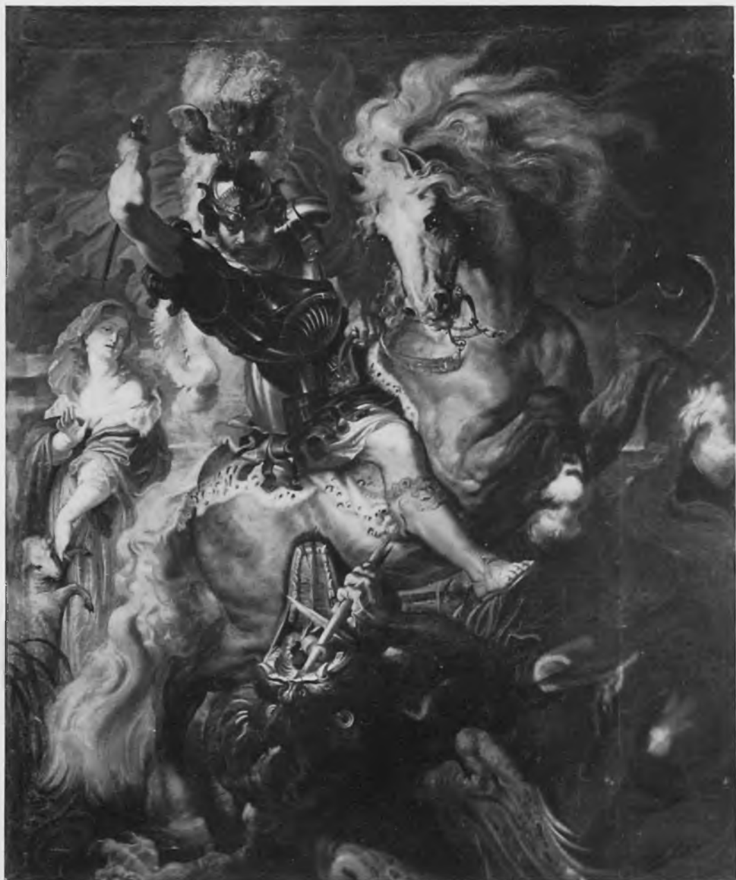
17. Rubens, St. George Slaying the Dragon (No. 105). Madrid, Prado