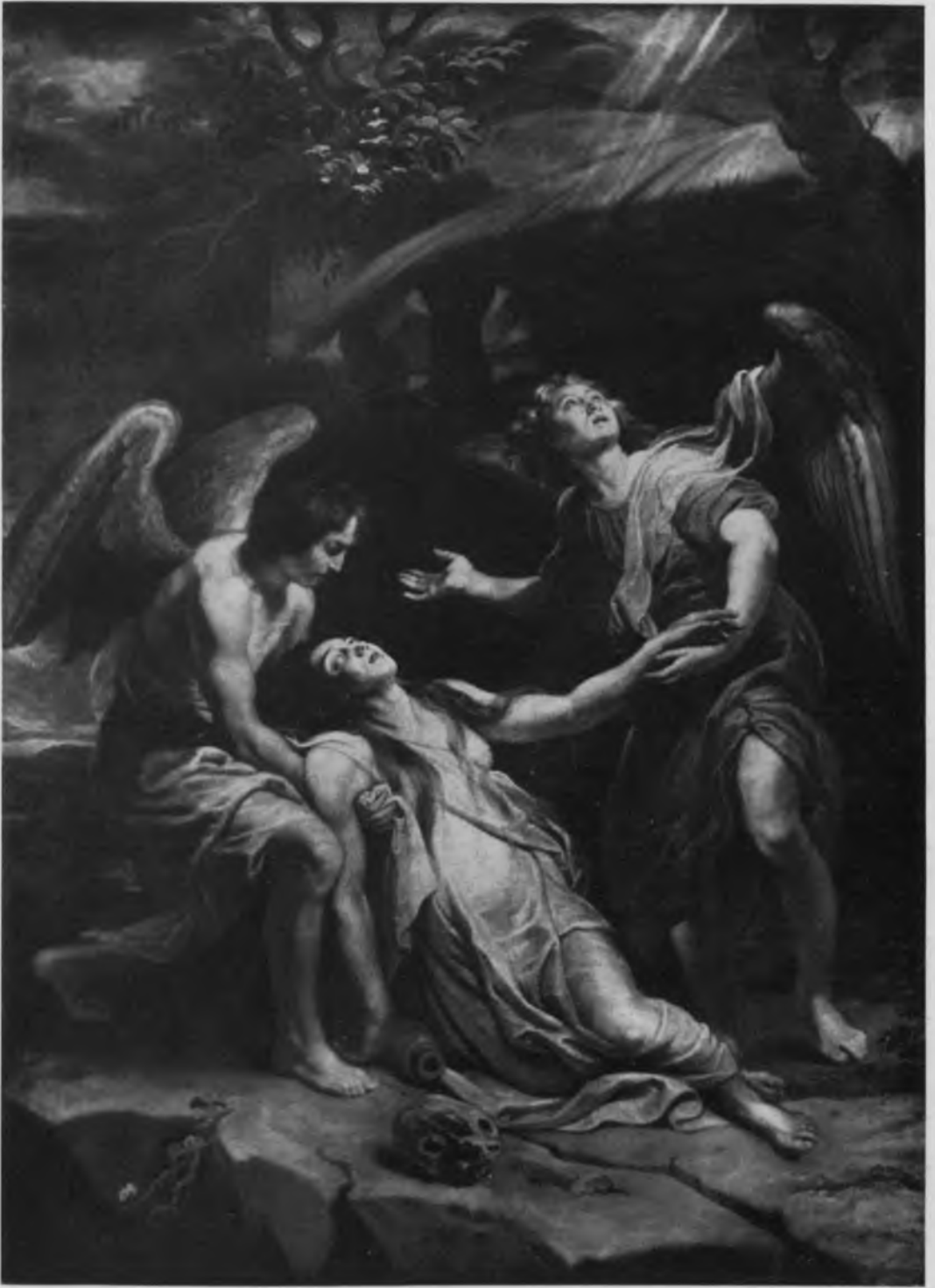
83. Rubens, St. Magdalen in Ecstasy (No. 131). Lille, Musée des Beaux-Arts