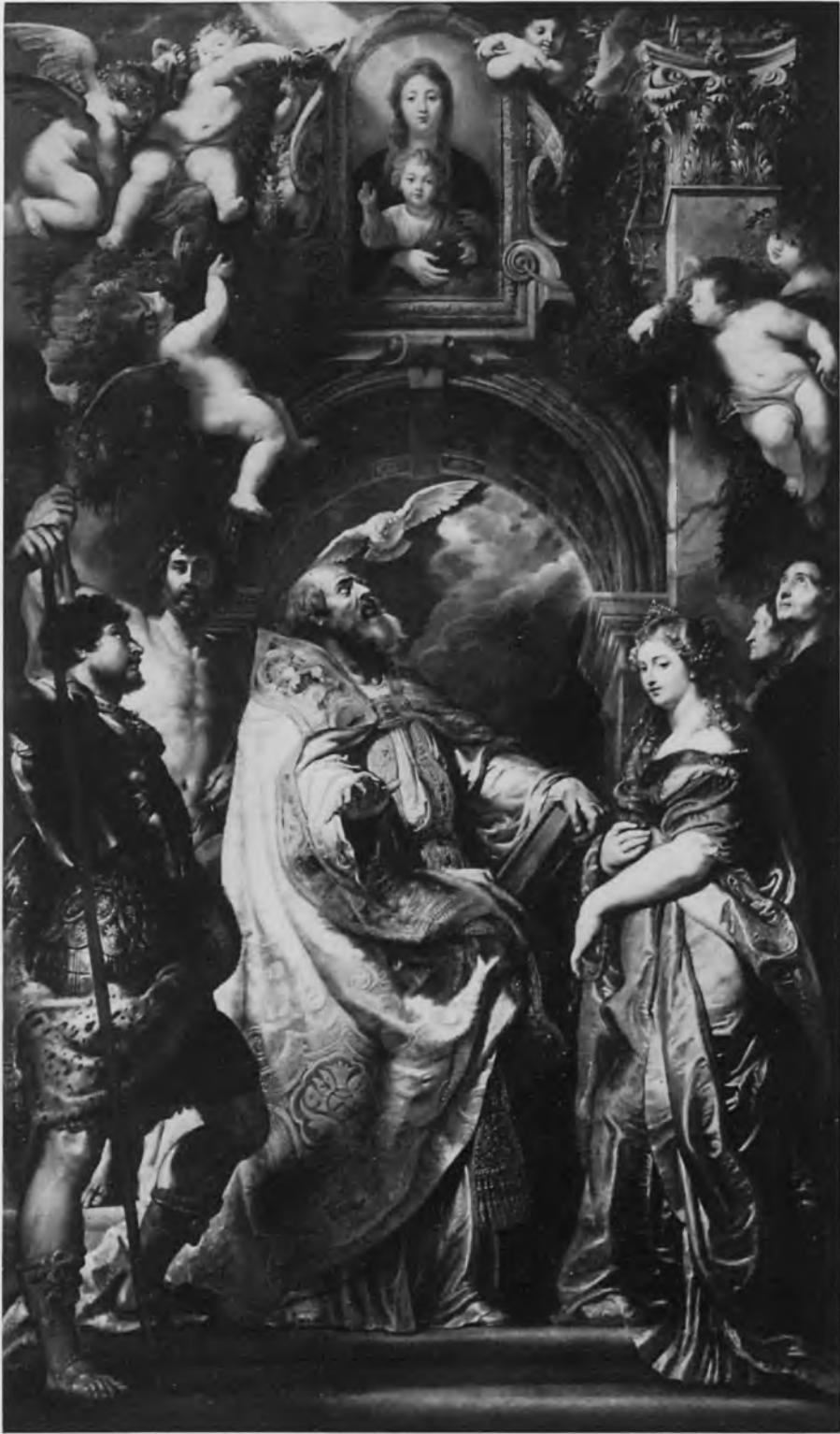
23. Rubens, St. Gregory the Great Surrounded by Other Saints (No. 109). Grenoble, Musée des Beaux-Arts