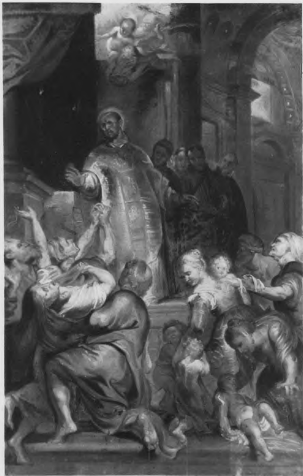
47. After Rubens, The Miracles of St. Ignatius of Loyola (No. 116a). London, Dulwich College Picture Gallery