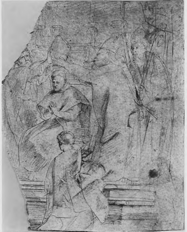
136. Rubens, The Enthronization of a Holy Bishop , drawing (No. 160a). Berlin, Print Room of the Staatliche Museen