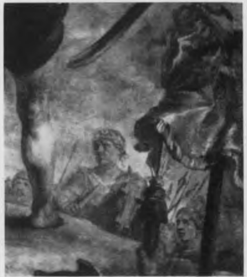
95. Detail of Fig. 92