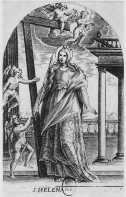
32. J. Callot, St. Helena , etching (No. 110)