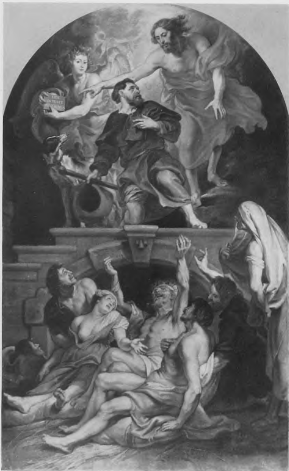
102. Rubens, St. Roch Interceding for the Plague-Stricken (No. 140). Alost, St. Martin's Church