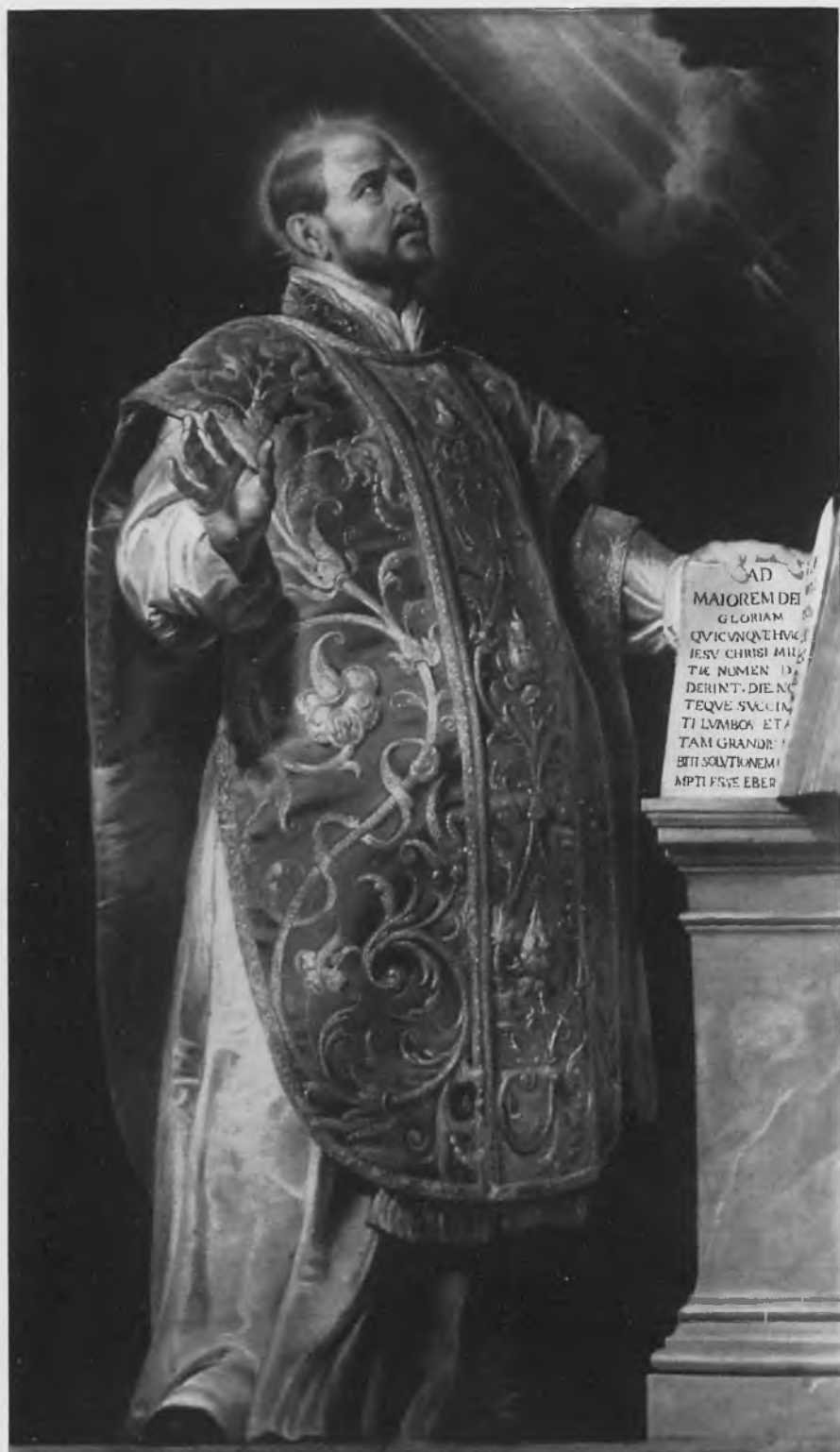
36. Rubens, St. Ignatius of Loyola (No. 113).

Warwick Castle, Coll. of the Earl of Warwick