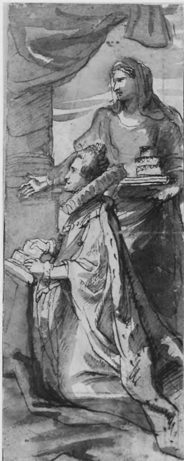
57. Rubens, The Infanta Isabella with her Patron St. Elizabeth of Hungary , drawing (No. 117a). Amsterdam, Gemeentemusea