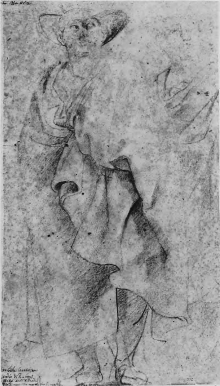
10. Rubens, Study of a Man with a Broad-Brimmed Hat , drawing (No. 104b). Cambridge, Fitzwilliam Museum