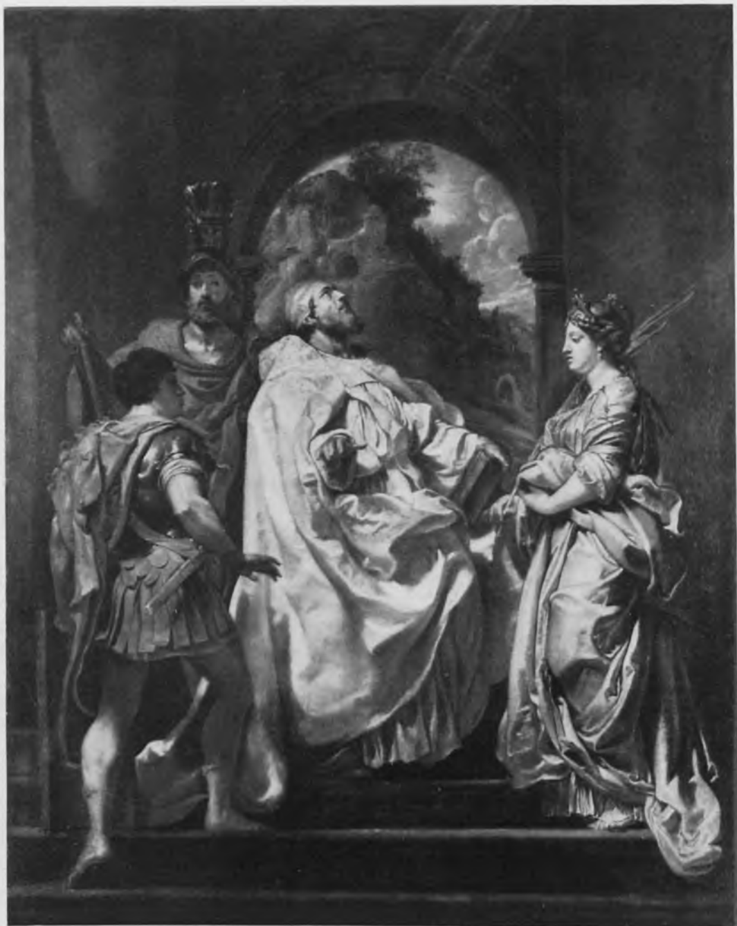
25. Rubens, St. Gregory the Great Surrounded by Other Saints , oil sketch (No. 109d). Berlin-Dahlem, Staatliche Museen