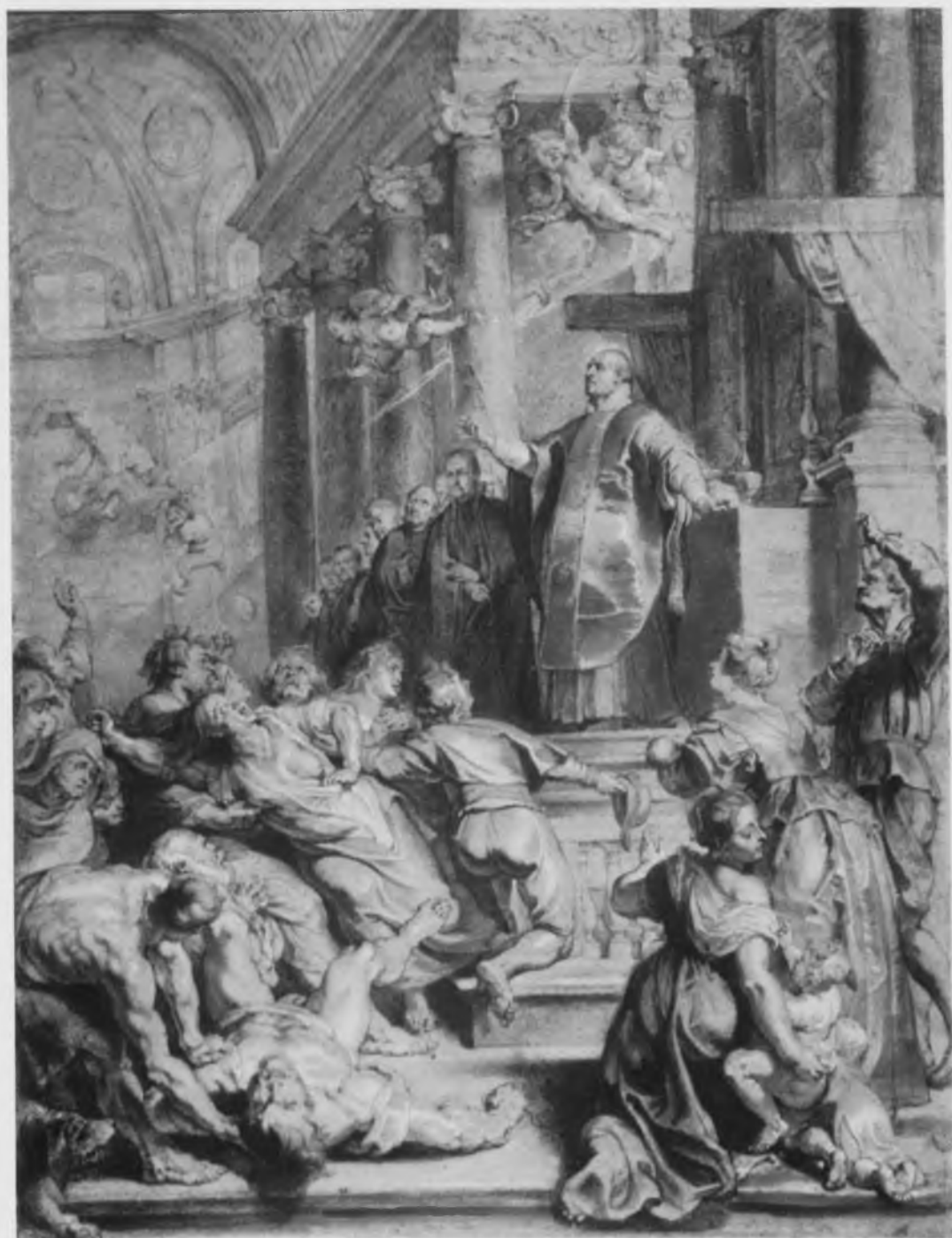
45. ? A. van Dyck, The Miracles of St. Ignatius of Loyola , drawing (No. 115c). Paris, Cabinet des Dessins du Musée du Louvre