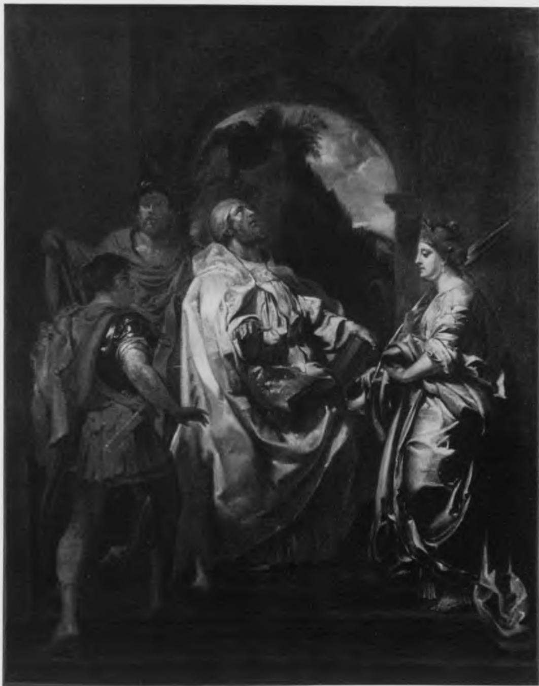
26. ? Rubens, St. Gregory the Great Surrounded by Other Saints (No. 109e). Siegen, Museum des Siegerlandes