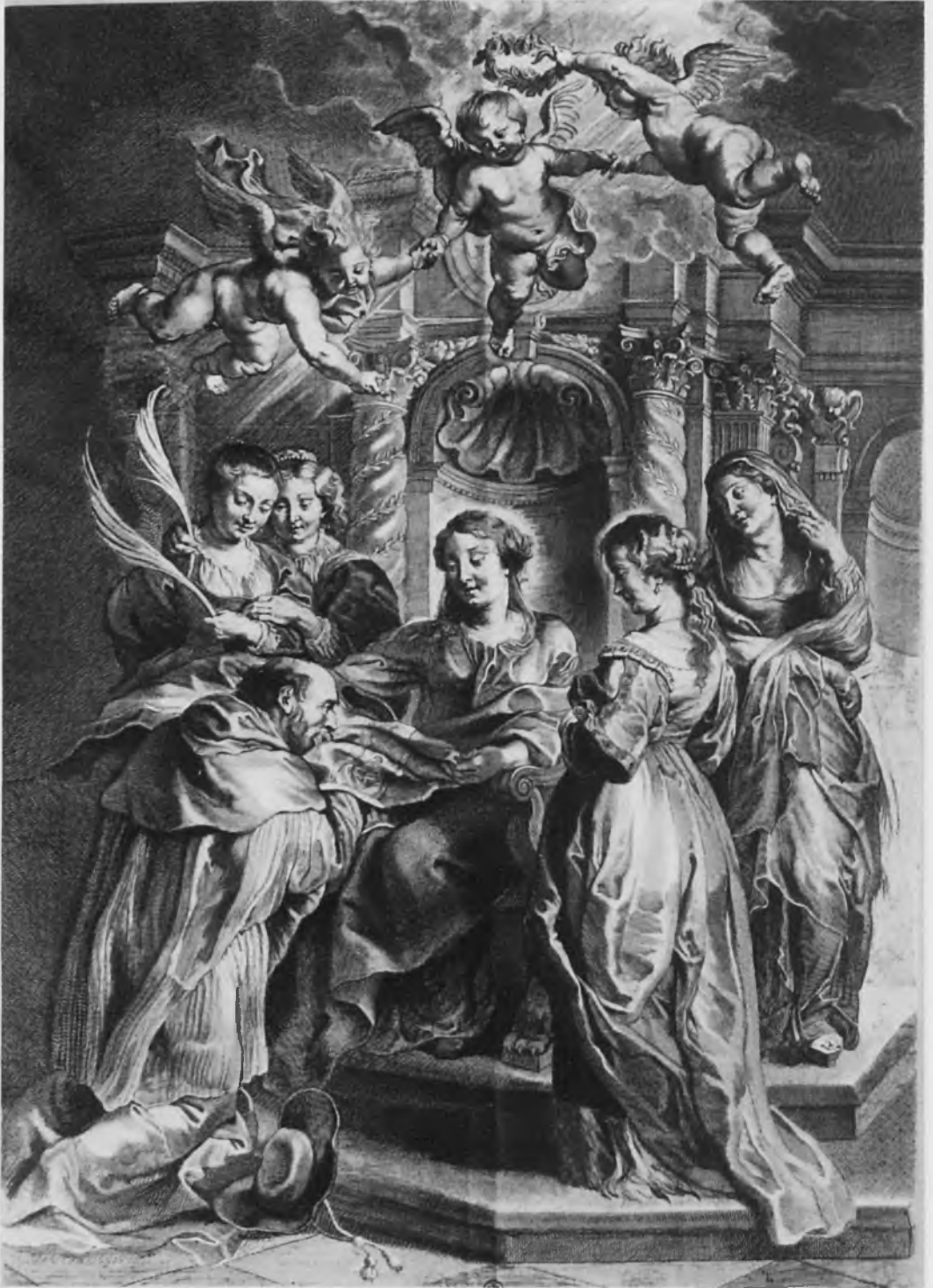
59. J. Witdoeck, retouched by Rubens (?), St. Ildefonso Receiving the Chasuble from the Virgin , engraving (No. 117g). Paris, Bibliothèque Nationale, Cabinet des Estampes