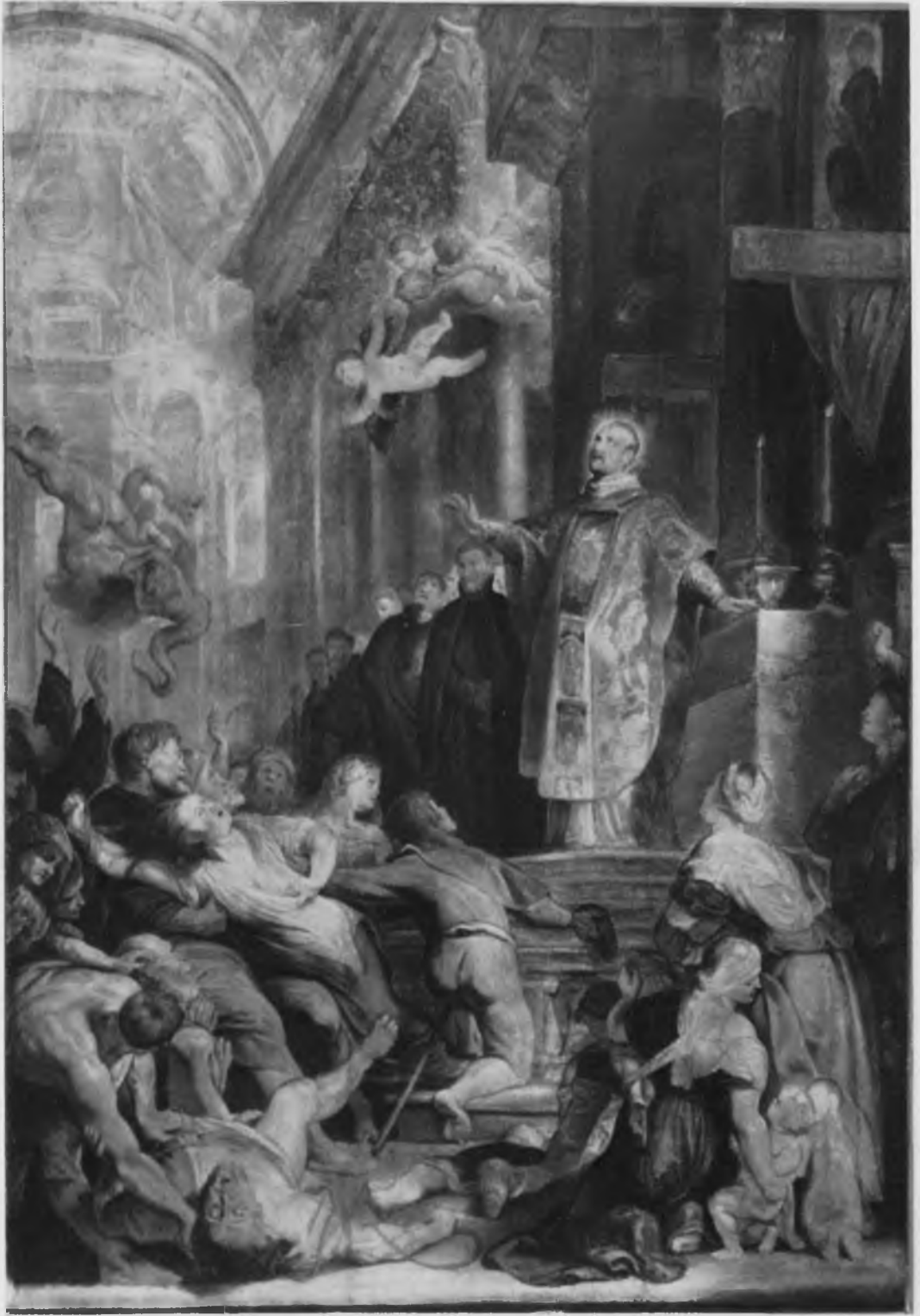
41. Rubens, The Miracles of St. Ignatius of Loyola , oil sketch (No. 115a).