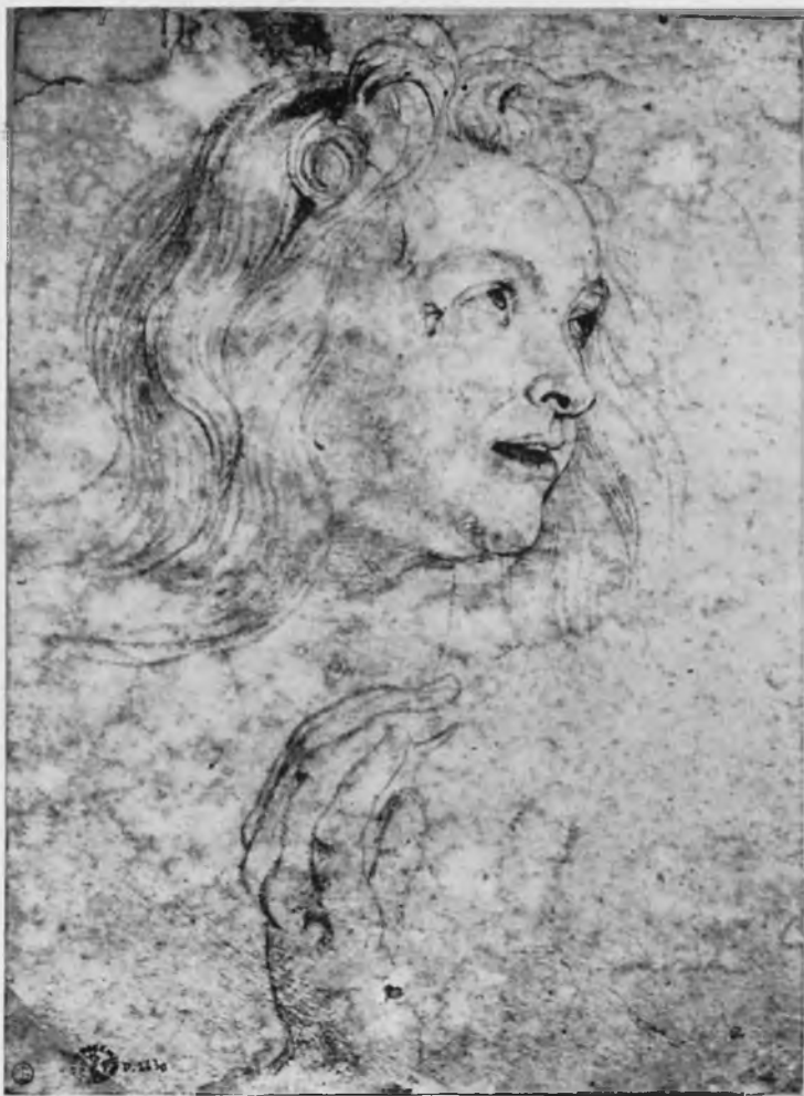
14. After Rubens, Study of the Head and Right Hand of a Woman , drawing (No. 104g). Besançon, Musée des Beaux-Arts