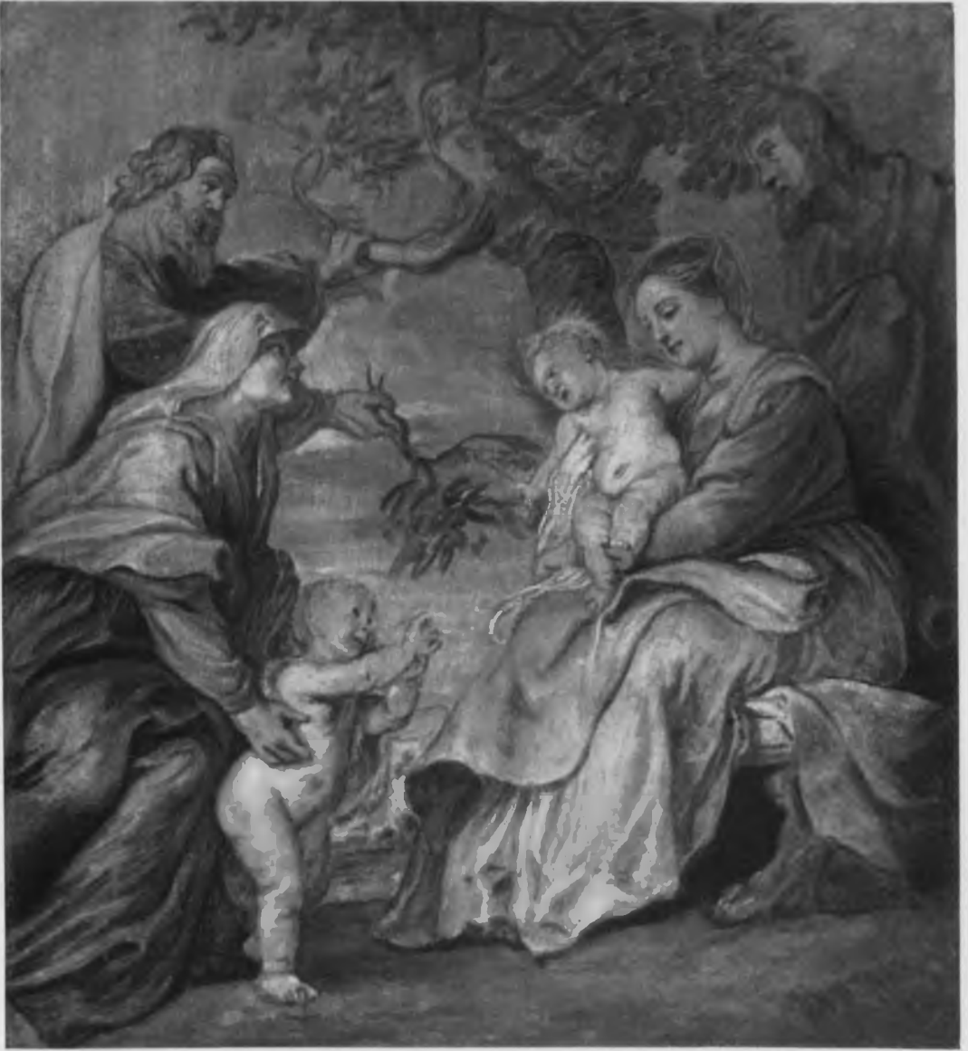
62. Rubens, The Holy Family under the Apple-Tree with St. John the Baptist, Elizabeth and Zacharias , oil sketch (No. 118a). Present whereabouts unknown