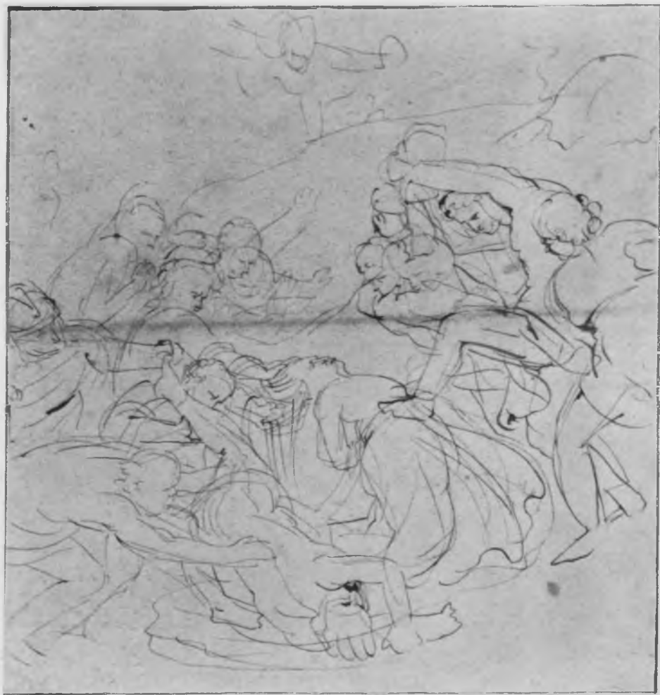
135. Rubens, The Martyrdom of Two Saints (?) , drawing (No. 161).