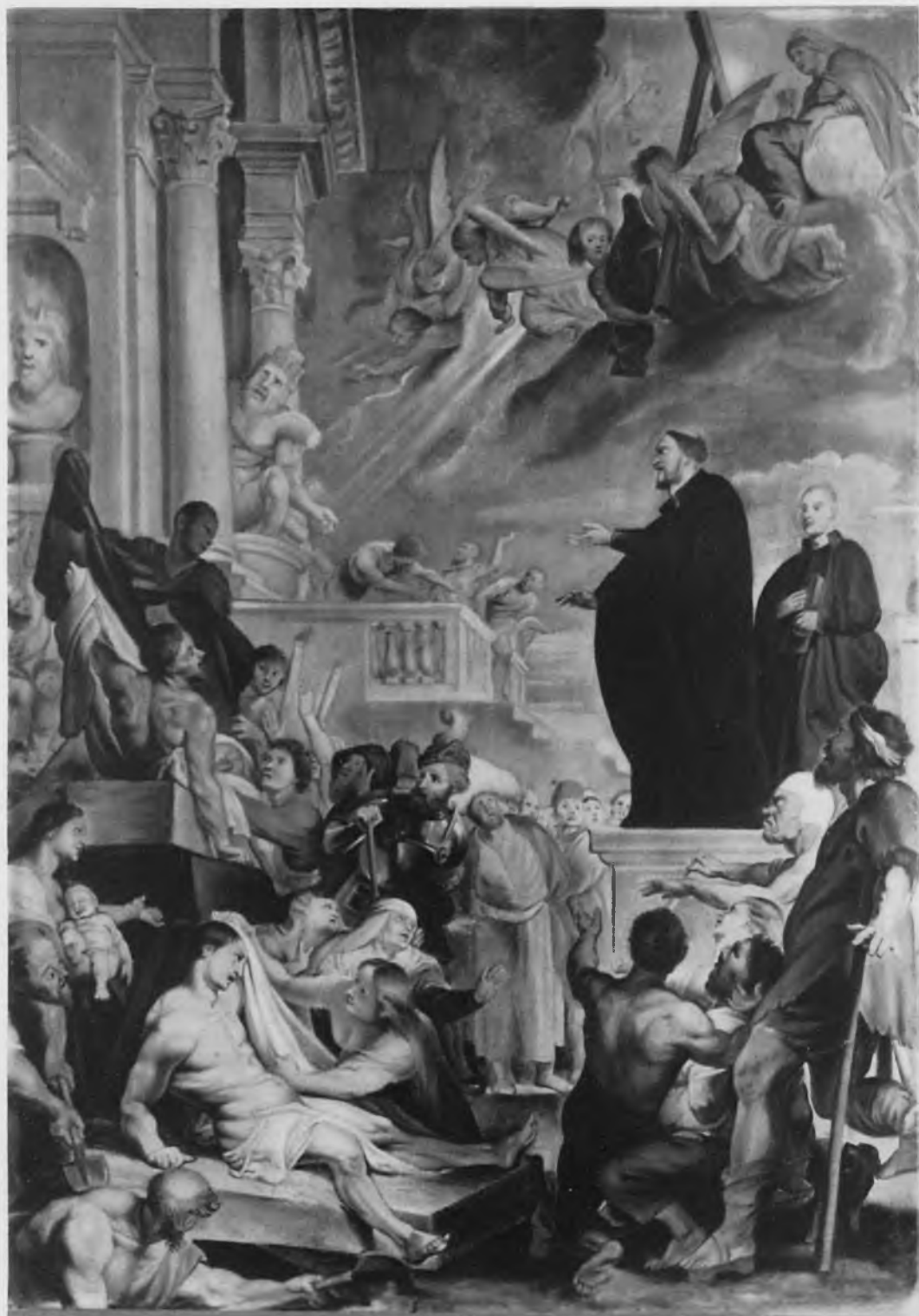
8. After Rubens, The Miracles of St. Francis Xavier (No. 104a). Munich, Bayerische Staatsgemäldesammlungen