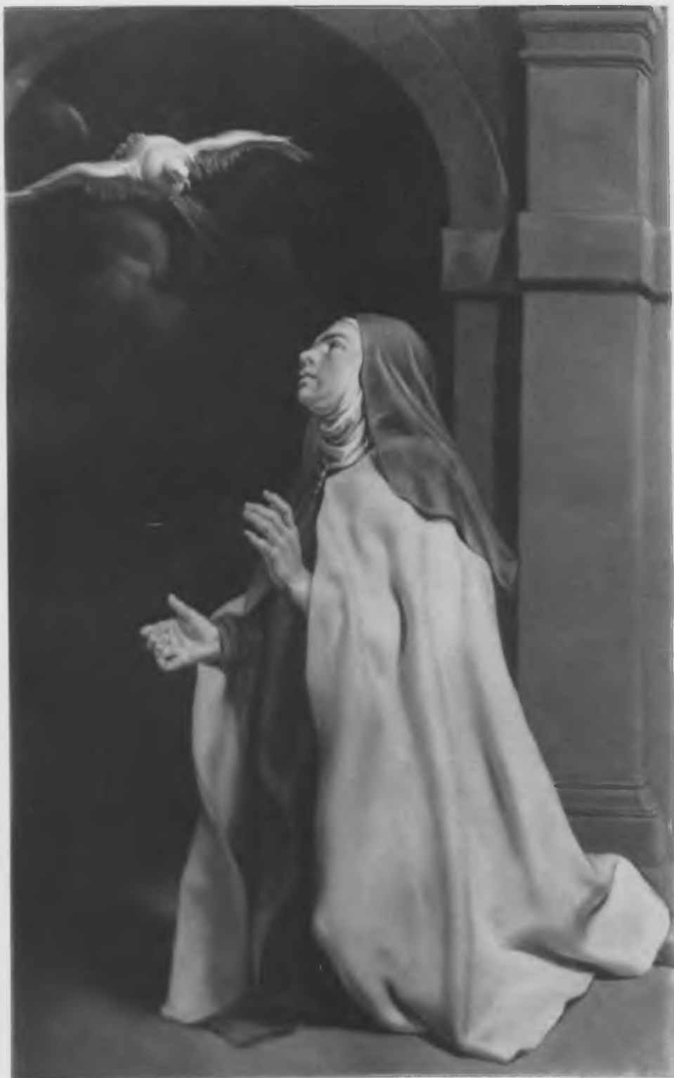
124. Rubens, St. Teresa of Avila's Vision of the Dove (No. 153).