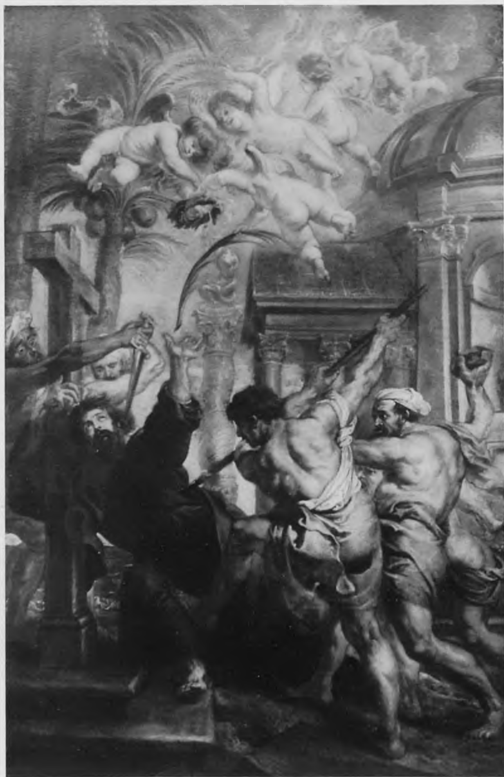
130. Rubens, The Martyrdom of St. Thomas (No. 156). Prague Národní Galerie