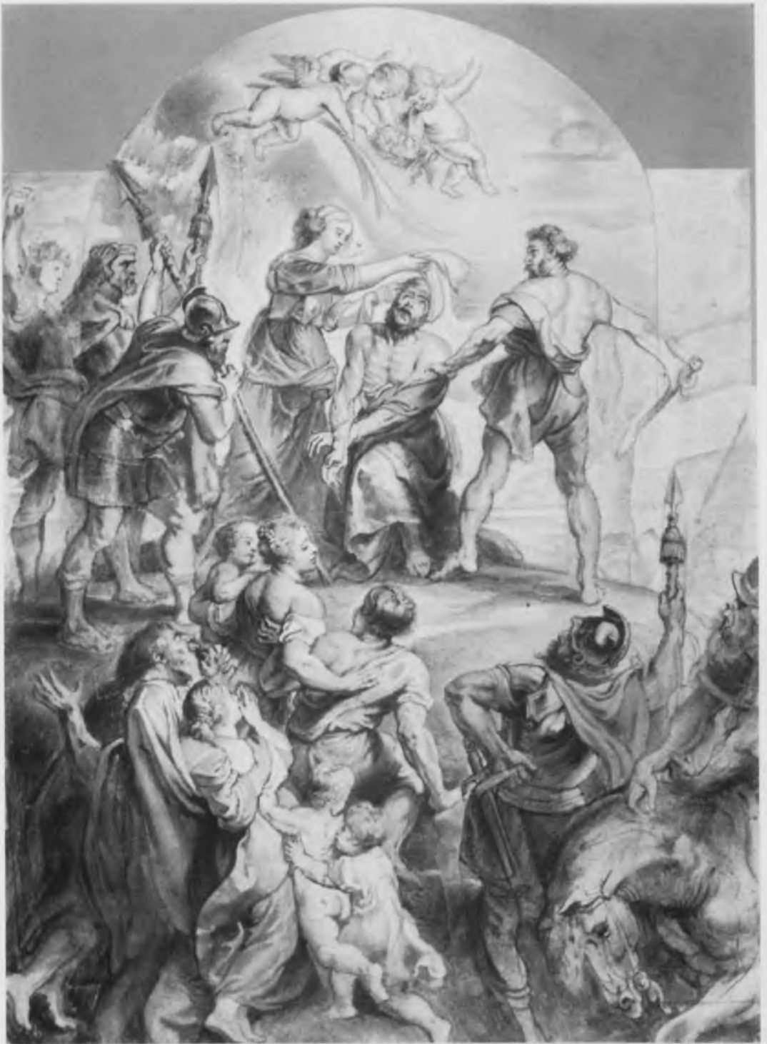
97. T. Boeyermans, The Martyrdom of St. Paul , drawing (No. 138a). London, British Museum