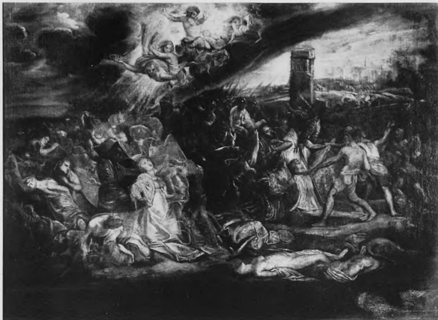
134. Rubens, The Martyrdom of St. Ursula and her Companions , oil sketch (No. 158). Mantua, Galleria di Palazzo Ducale