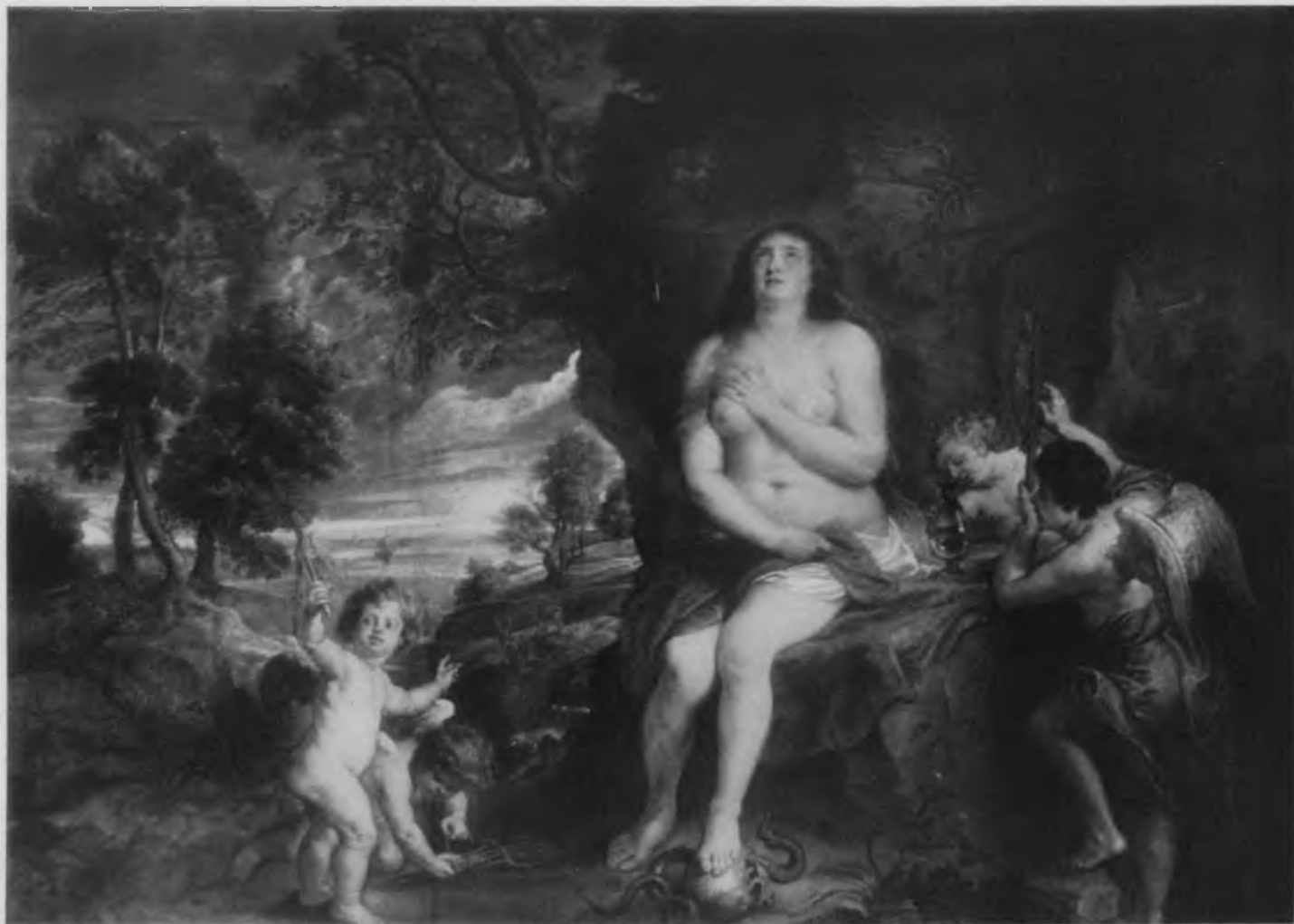
81. Rubens, St. Magdalen Repentant (No. 130). Formerly Berlin, Kaiser Friedrich-Museum, now lost