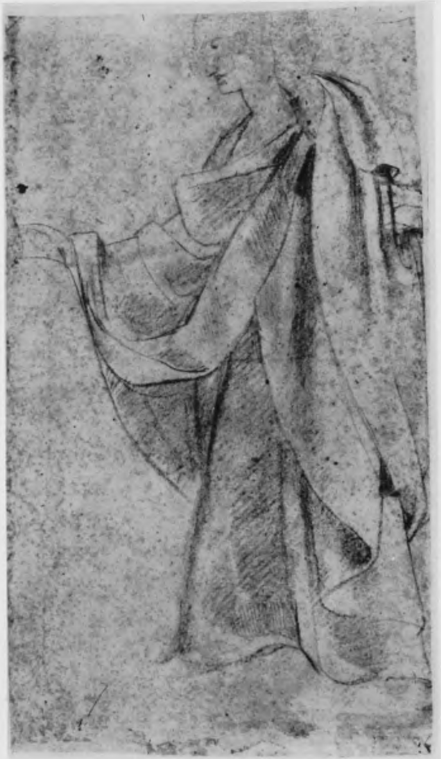
11. Rubens, Drapery Study for St. Francis Xavier Preaching , drawing (No. 104C). Cambridge, Fitzwilliam Museum