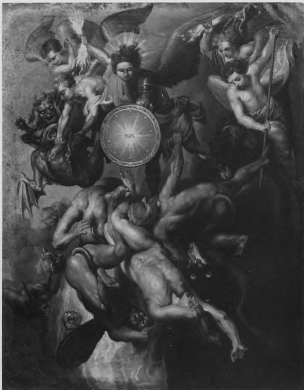
86. After Rubens, St. Michael Striking down the Rebellious Angels (No. 134).