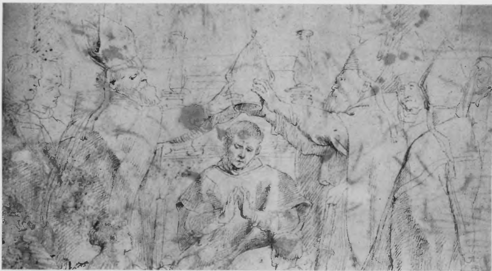
137. Rubens, The Enthronization of a Holy Bishop , drawing (No. 160b). Paris, Cabinet des Dessins du Musée du Louvre