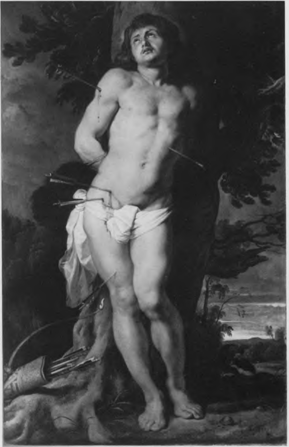
108. Rubens, St. Sebastian (No. 145). Berlin-Dahlem, Staatliche Museen