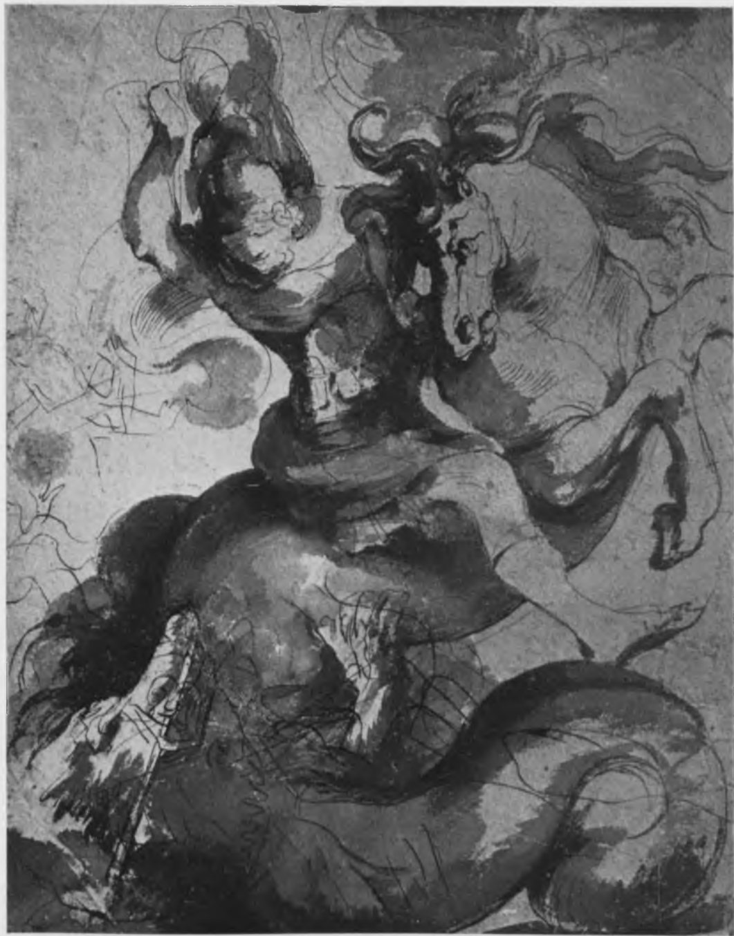
18. Rubens, St. George Slaying the Dragon , drawing (No. 105a). Paris, Cabinet des Dessins du Musée du Louvre