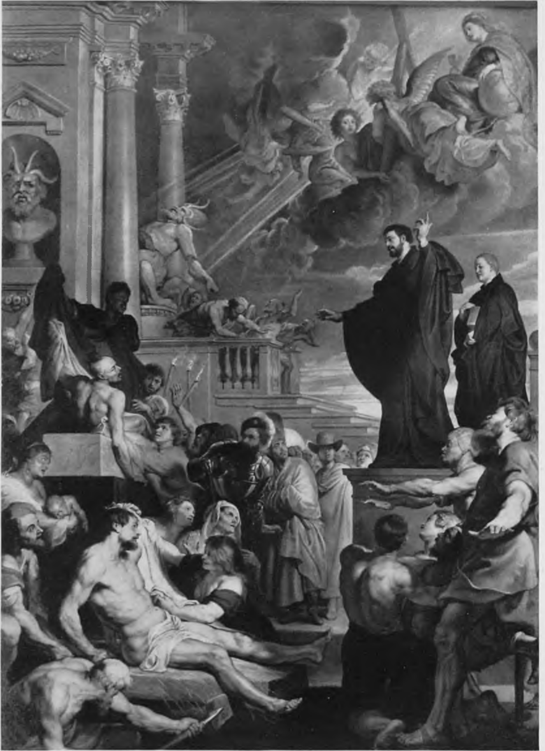
6. Rubens, The Miracles of St. Francis Xavier (No. 104). Vienna, Kunsthistorisches Museum