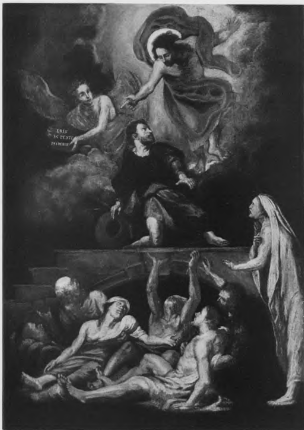
103. After Rubens, St. Roch Interceding for the Plague-Stricken (No. 104b).