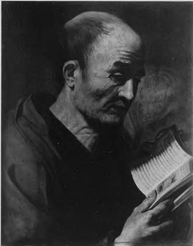
79. ? Rubens, St. Luke (No. 128). Bremen, Ludwig Roselius-Haus