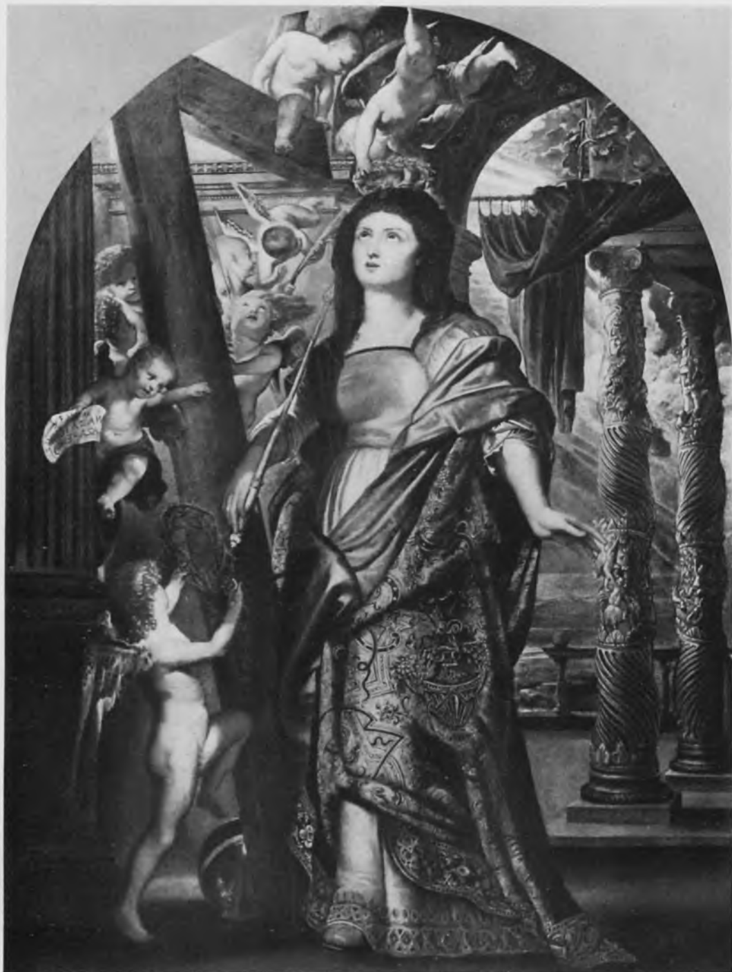
31. Rubens, St. Helena (No. 110). Grasse, Chapel of the Municipal Hospital