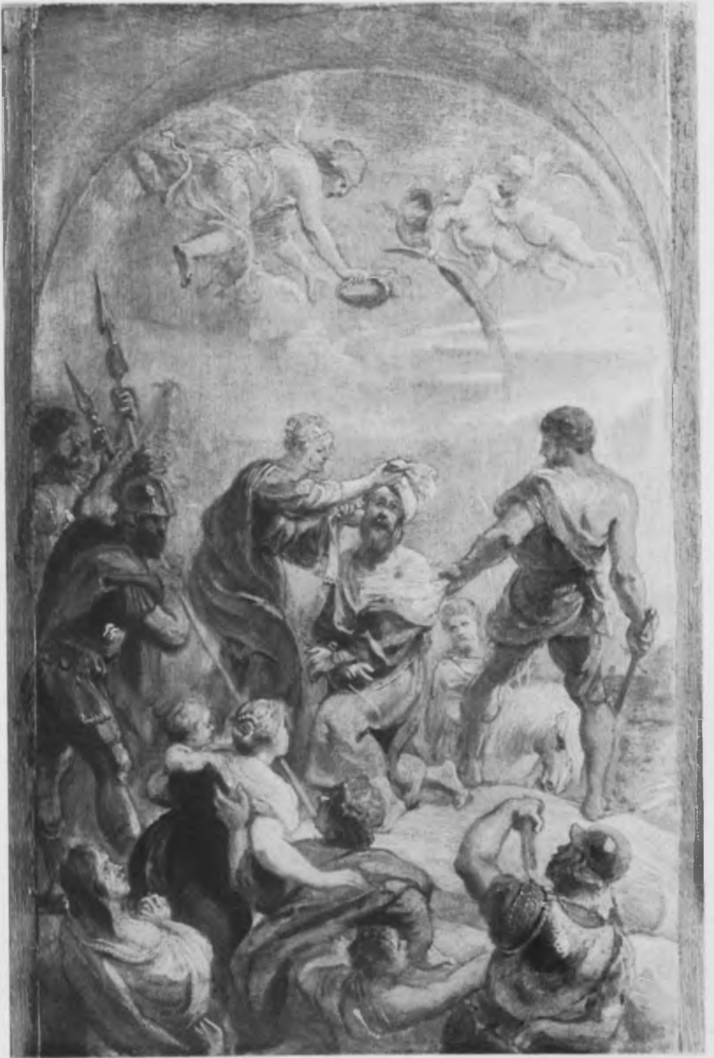
91. Rubens, The Martyrdom of St. Paul . oil sketch (No. 137a). Present whereabouts unknown