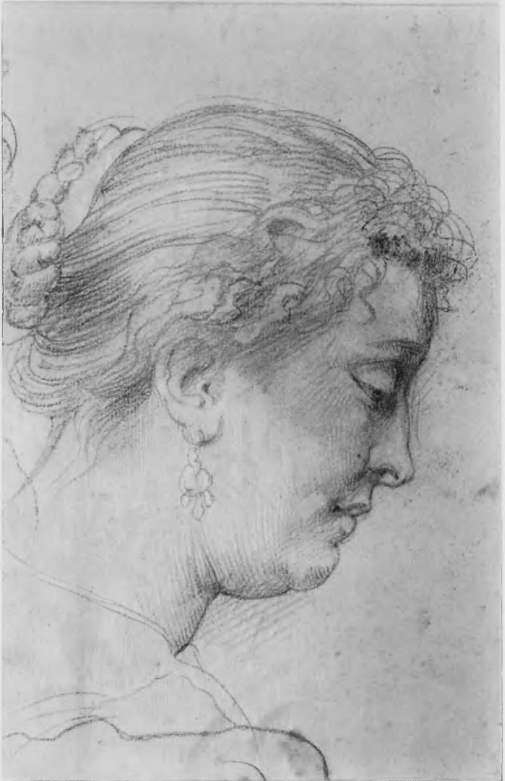
55. Rubens, Study of a Head of a Woman Turned to the Right , drawing (No. 117c). Vienna, Albertina