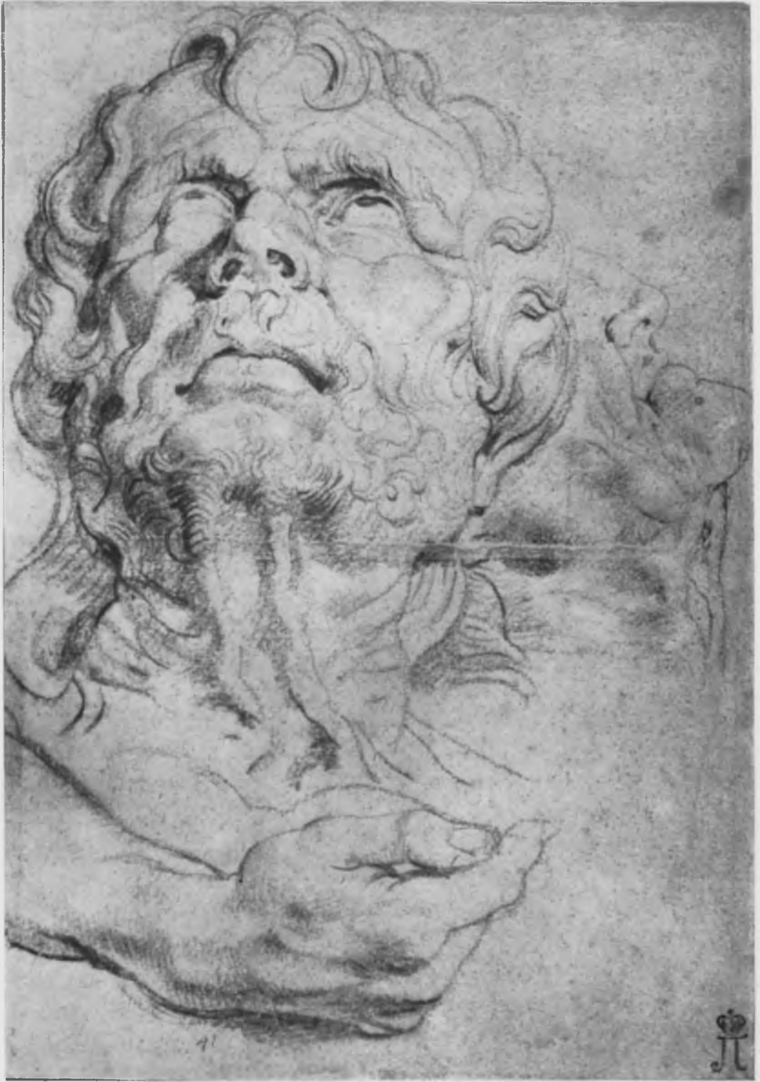
43. Rubens, Studies of Heads and an Arm , drawing (No. 115b). Leningrad, Hermitage