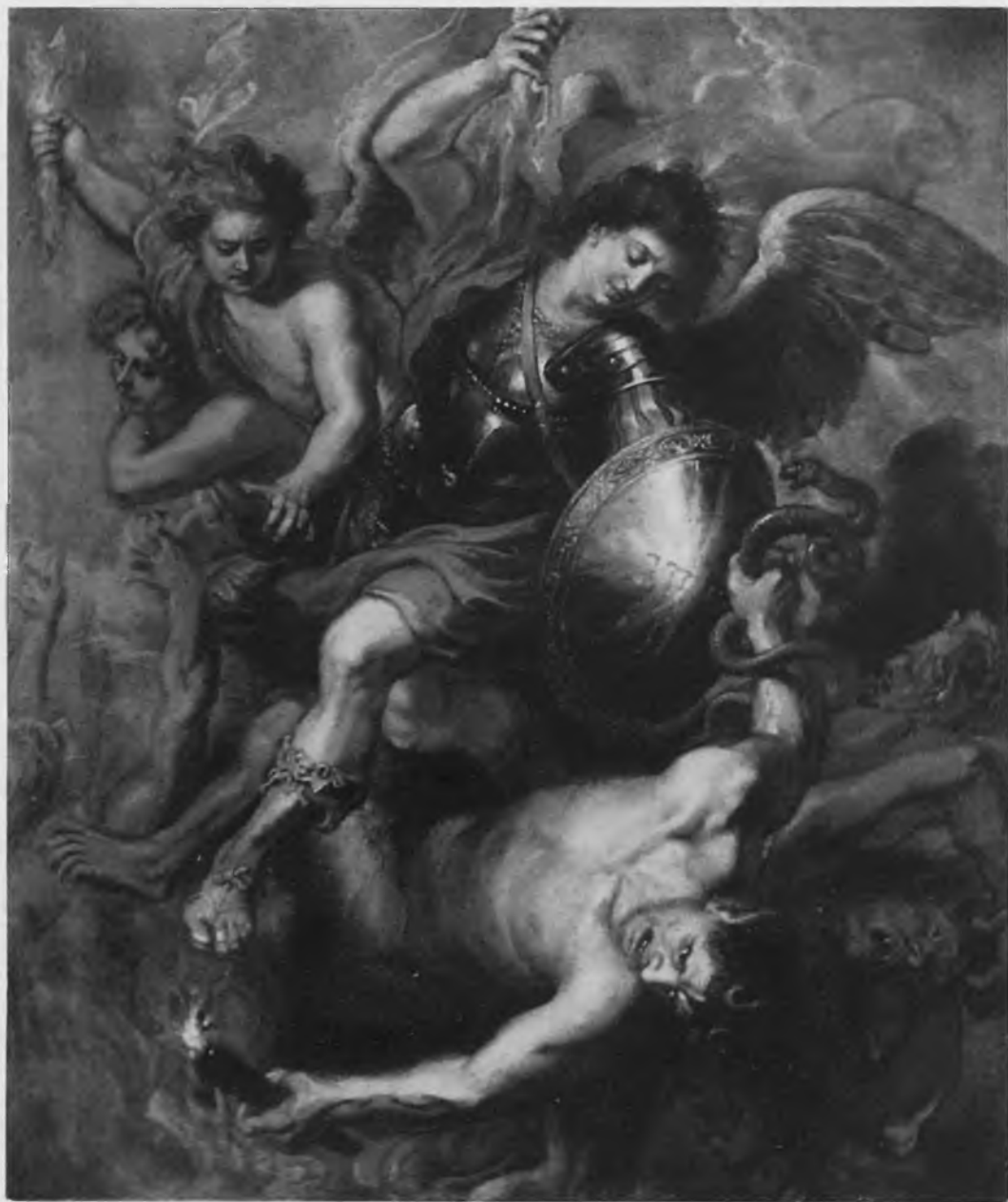
90. Rubens, St. Michael Striking down the Rebellious Angels (No. 136). Caŝagnola (Lugano), Villa Favorita, Coll. Thyssen-Bornemisza