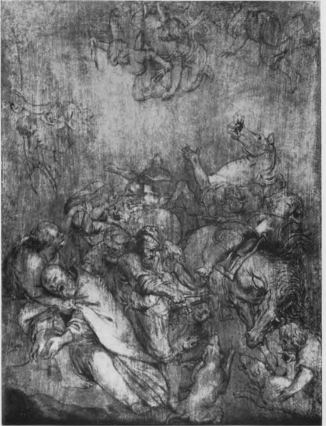
76. After Rubens, The Martyrdom of St. Livinus (No. 127a). Present whereabouts unknown