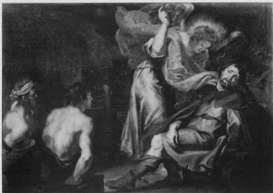
105. School of Rubens, The Death of St. Roch (No. 142). Alošt, St. Martin's Church