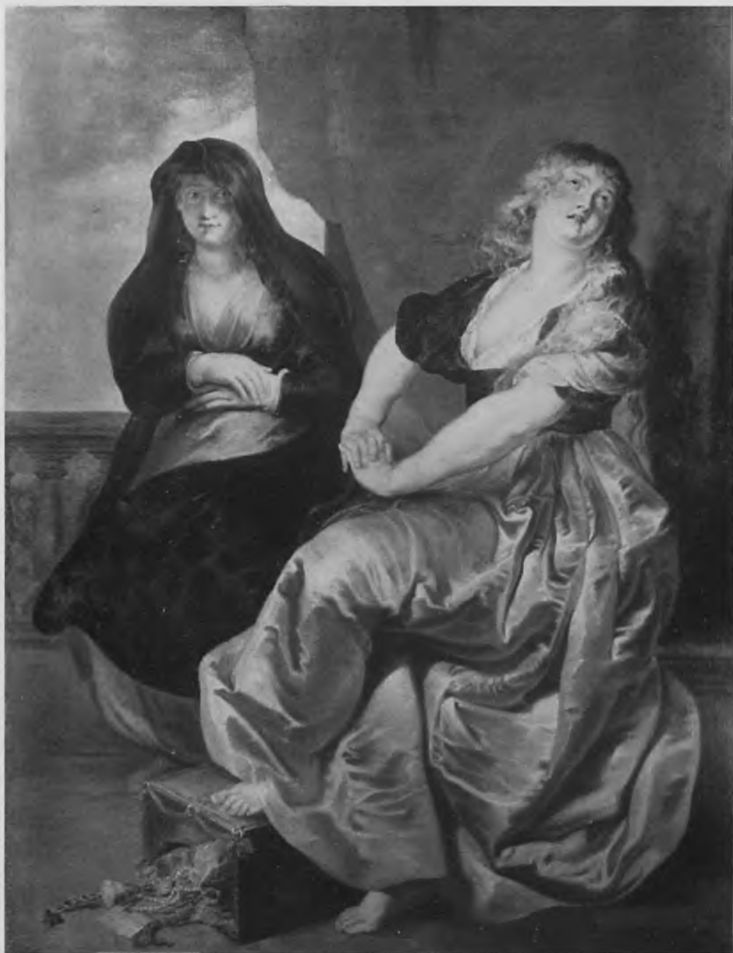
82. Rubens, St. Magdalen Repentant (No. 129). Vienna, Kunsthistorisches Museum