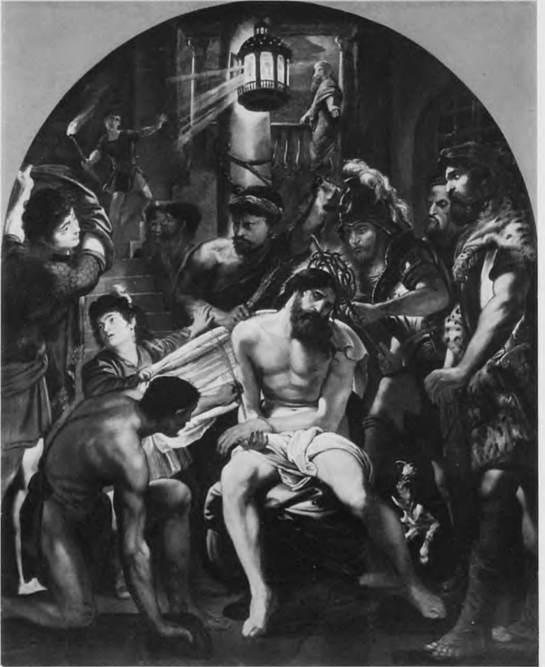
34. Rubens, The Mocking of Christ (No. 111). Grasse, Chapel of the Municipal Hospital