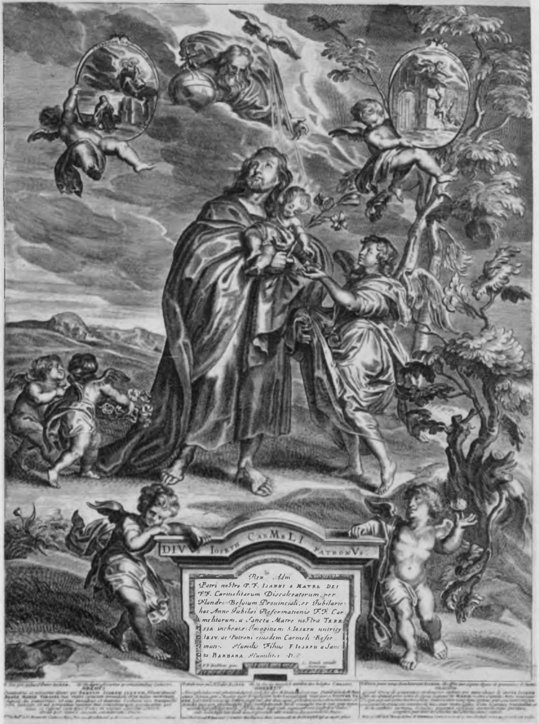
68. St. Joseph and the Infant Christ, engraving (publ. by J. Donck; No. 124)