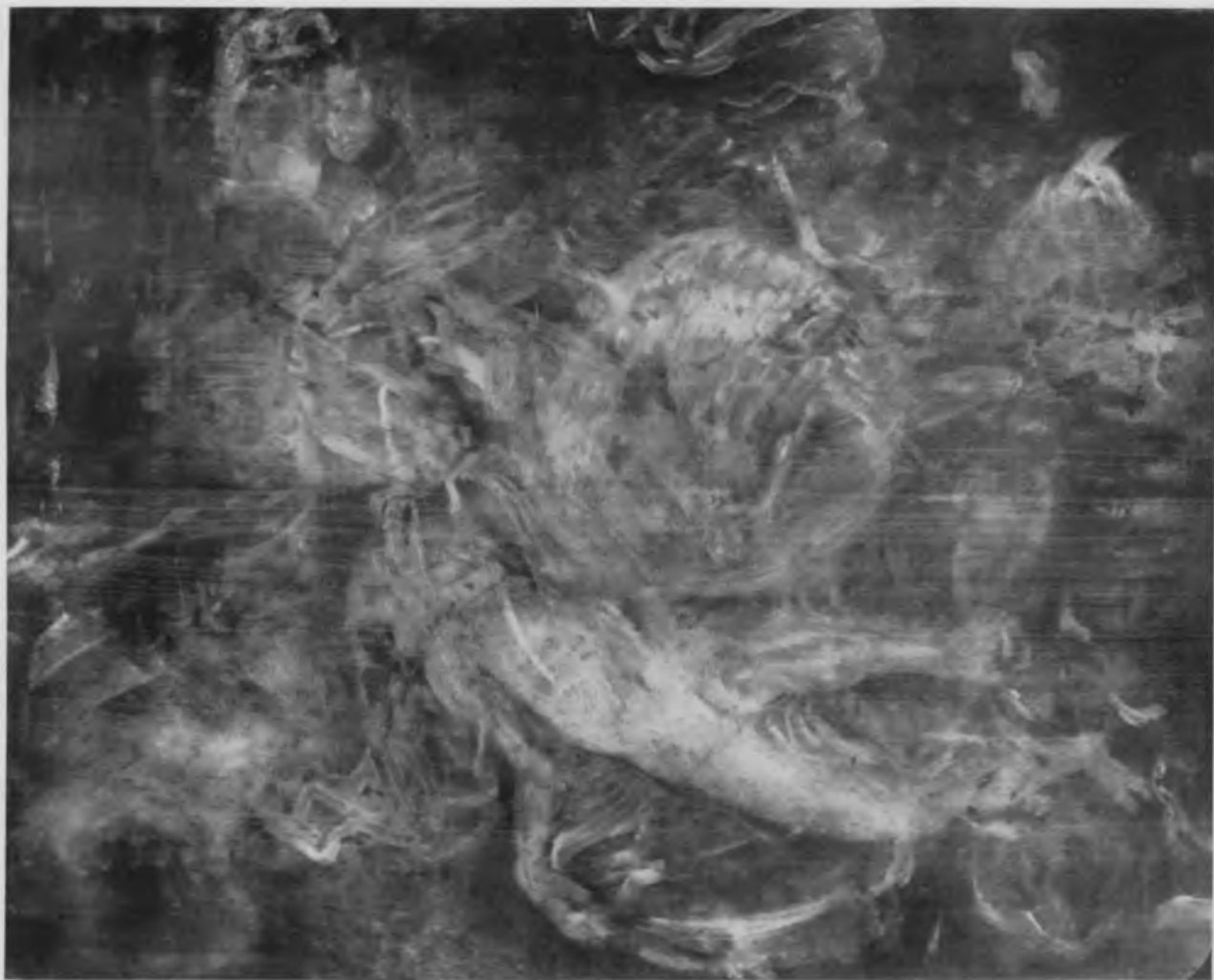
85. X-radiograph of Fig. 84