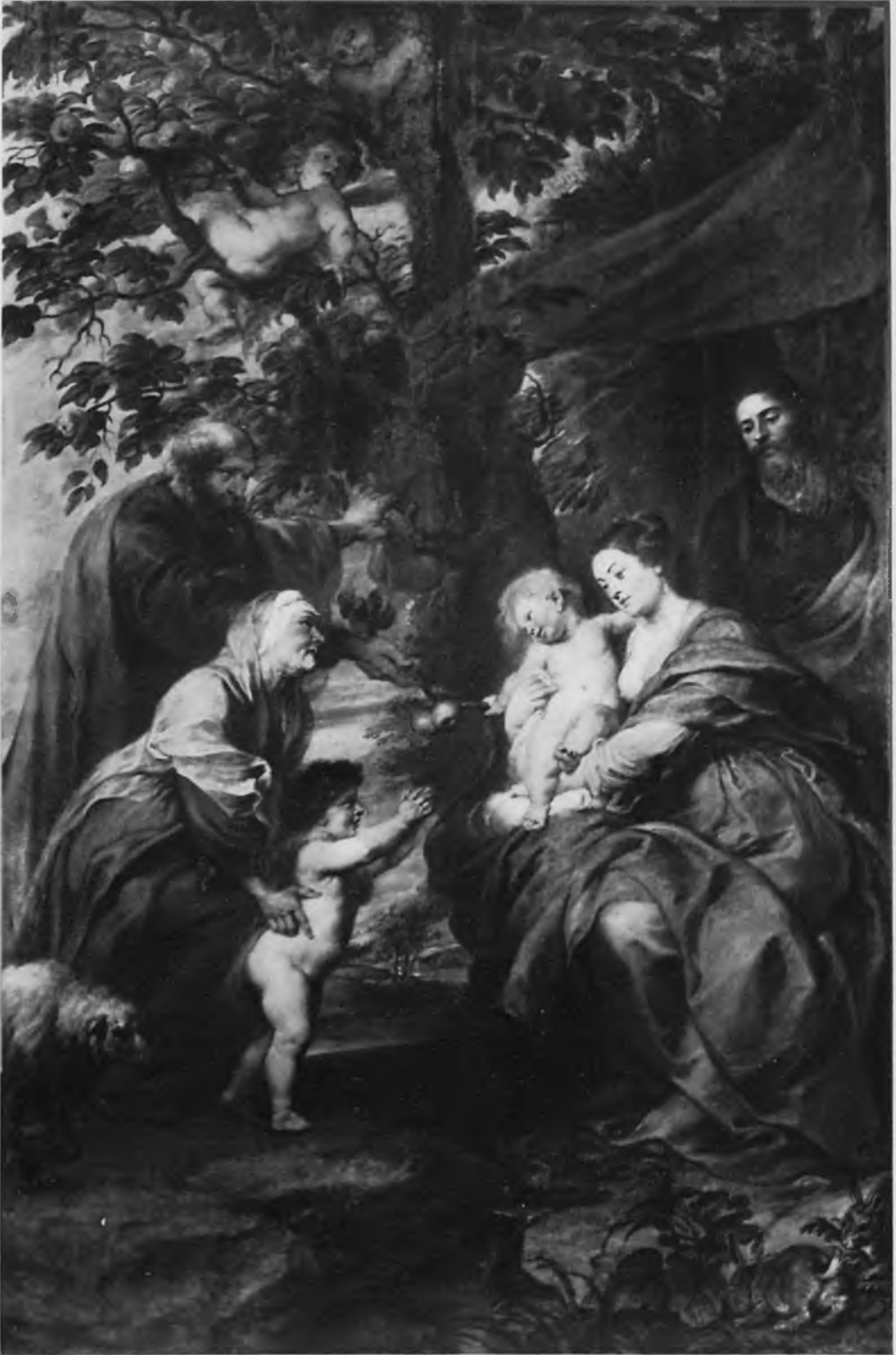
61. Rubens, The Holy Family under the Apple-Tree with St. John the Baptist, Elizabeth and Zacharias (No. 118). Vienna, Kunsthistorisches Museum