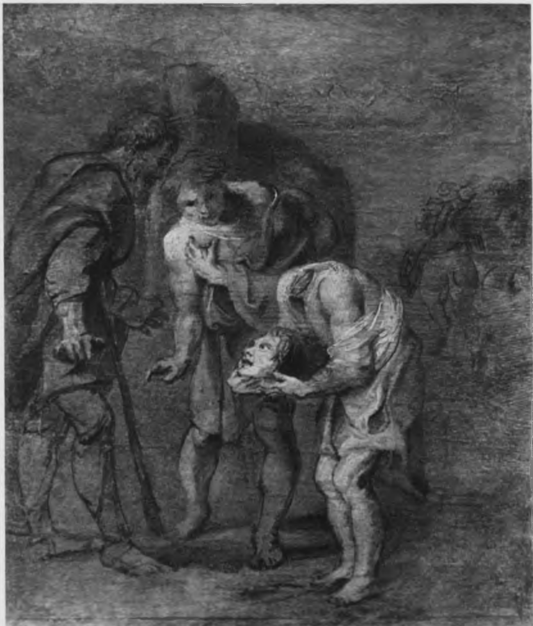
70. Rubens, The Miracle of St. Justus , oil sketch (No. 125a). Budapest, Szépművészeti Múzeum