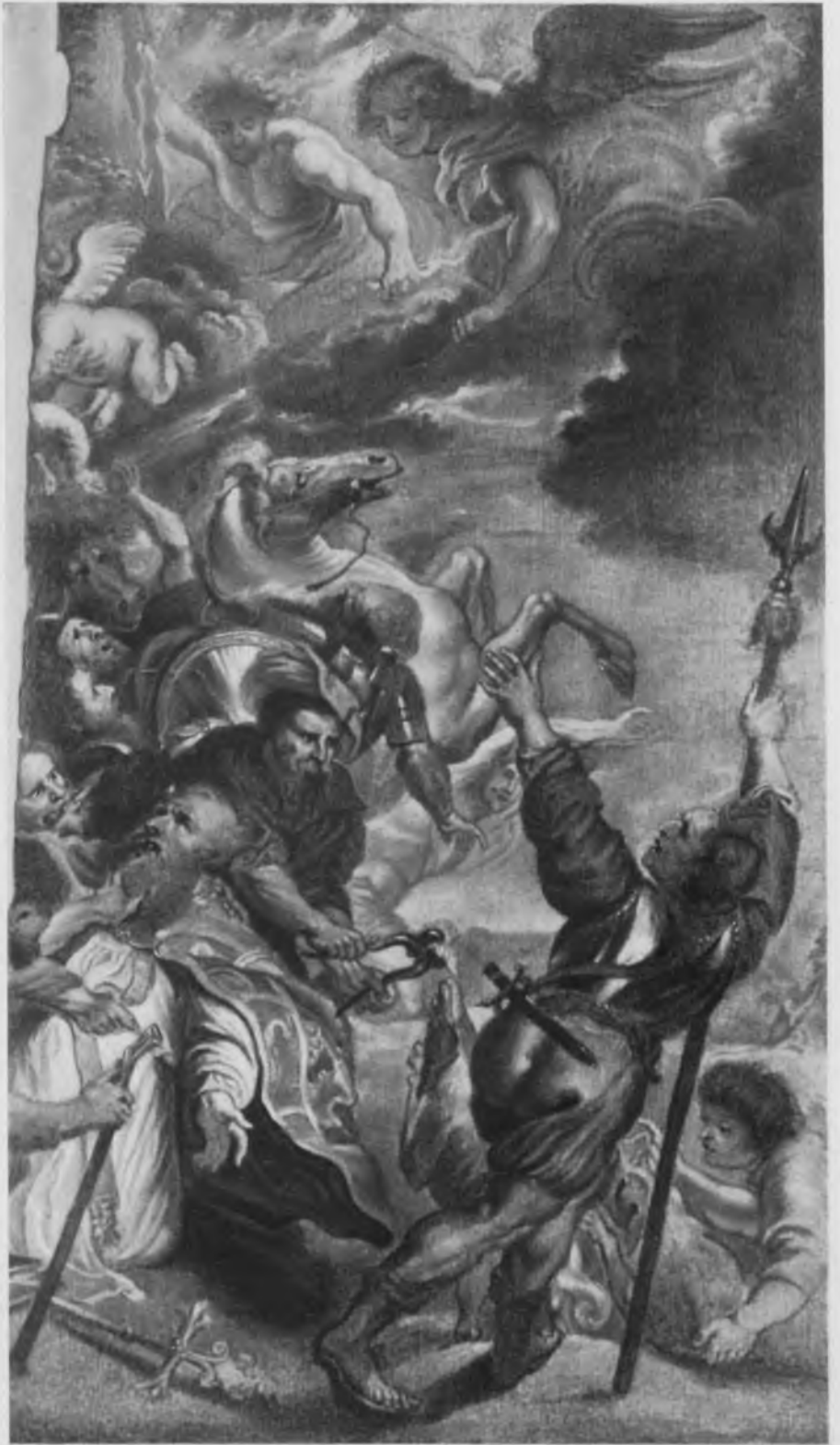
78. ? Rubens, The Martyrdom of St. Livinus (No. 127c).