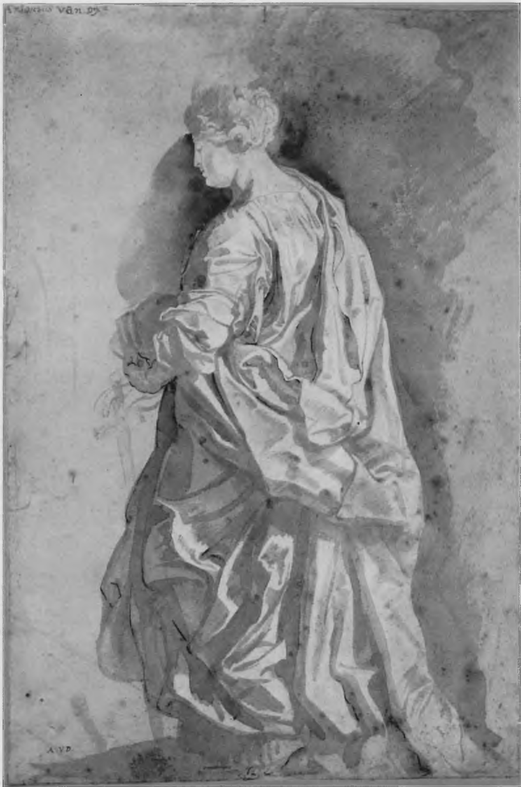
27. Rubens, Study of a Woman Saint , drawing (No. 109b).