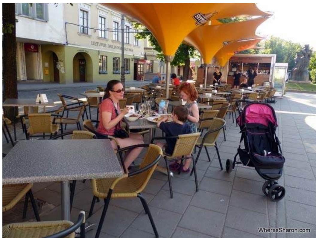
Enjoying outdoors dining at Savas Kampas.