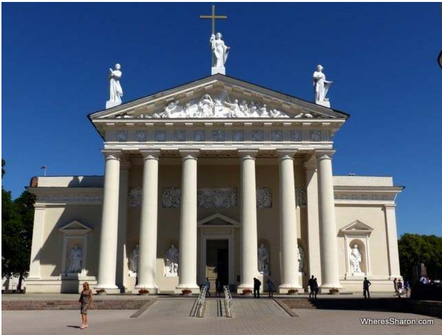
The neo-classical front of the Vilnius Cathedral.

A focal point of the Old Town is the Vilnius Cathedral. It was originally built in the 13th century and has been rebuilt and extended many times since. Although large it looks deceptively simple from the outside. Inside, though, is more impressive with the incredibly high ceiling and rich decorations. Given its focal point, it is a place lots of people start when sightseeing in Vilnius.