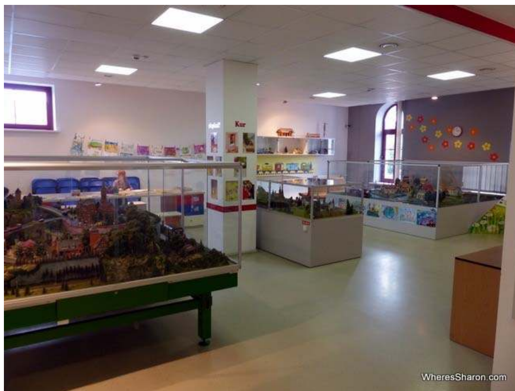
The kids area at the Railway Museum.

The Railway Museum of Vilnius is located inside the main terminal building of Vilnius' Central Station. Look for a marked door to your right as you enter the terminal, then proceed up two flights of stairs (there's a lift but you need someone to activate it for you) to find it.