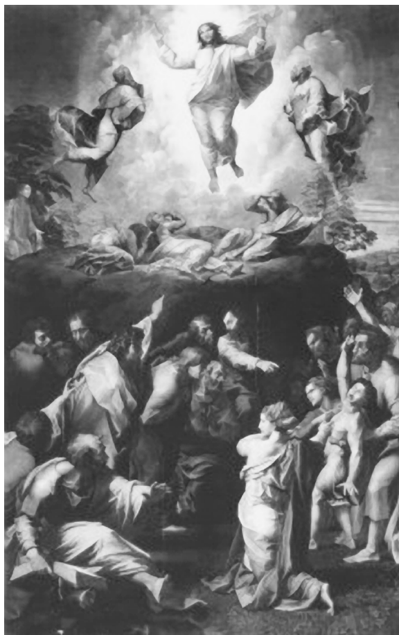
Fig. 1. Raphael's Transfiguration of Christ . (Reproduced with permission from ref. 5.)

ical Culture . He advised readers how to develop themselves physically, how to maintain their health, and how to cope with illness. He illustrated it with photographs of himself lightly clad, with muscles bulging (Fig. 3A). Each issue carried articles about sickly men and women who became healthy, strong, and beautiful through proper diet and exercise. The magazine's circulation had reached 500,000 by the end of World War I. Macfadden was widely recognized, and one of his followers, Angelo Siciliano, won Macfadden's "America's Most Perfectly Developed Man" contest twice. Using the winnings, Siciliano went on to establish his own muscle-building business under the name of Charles Atlas.