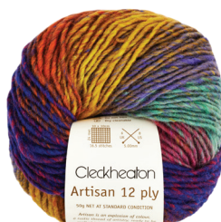
Artisan 12 ply 50% Wool 50% Acrylic