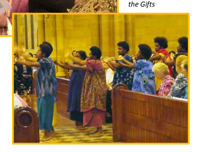
Sisters gathered after the Mass