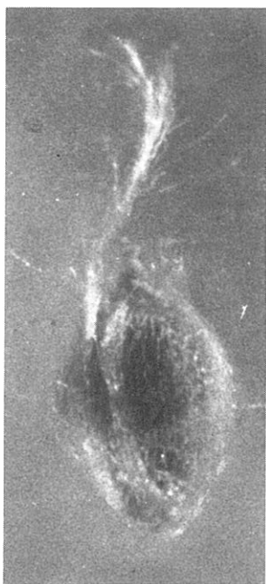
Fig. 1. Fruit of Schoenus capillifolius (Holotype), showing one of the six hypogynous bristles fully extended.