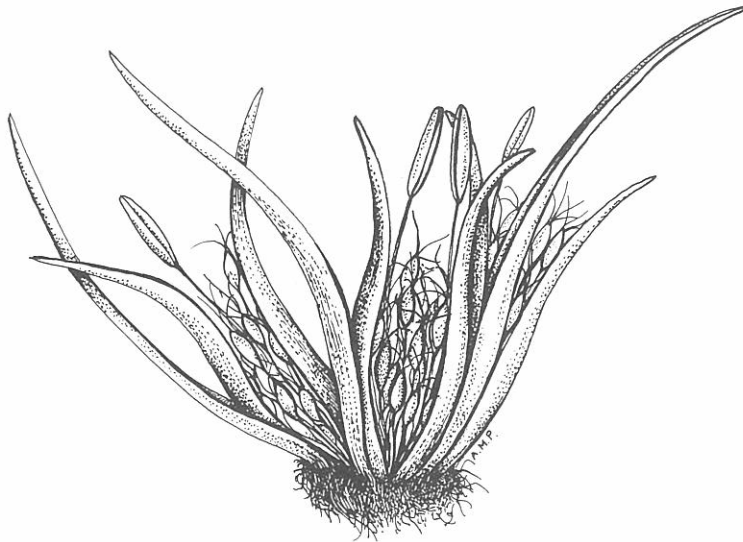
Fig. 4. Plant of Trithuria lanterna (several leaves and bracts removed), showing flowering heads, x18 (BRI 256563).

In Trithuria submersa Hook. f. the fruit dehisces by 3 caducous panels, leaving a framework formed by the 3 vascular ribs (Hooker, 1858). The released seed is the disseminule and has a thick, sculptured testa which may be an adaptation to hydrochory, rendering the seed unwettable and thus able to float on the surface film.