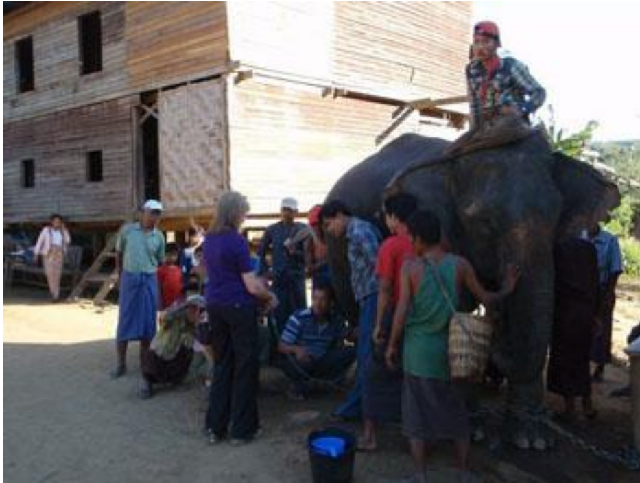
Ultrasound assessment to detect pregnancy

During the trip, several MTE forest camps around the country were visited, including logging, training, and rest camps. The overall care and management of these working elephants is closely monitored, and MTE has a large staff of well-qualified veterinarians who were most welcoming, sharing experiences and expertise with the visiting veterinarians. A particular interest for the MTE veterinarians was learning more about the use of ultrasound technology in elephants. One of the AES-supported veterinarians brought a field ultrasound unit, enabling practical demonstrations of its use in a variety of medical issues such as detecting pregnancy, evaluating medical conditions such as abscesses or tumors, and assessing some internal organs. The group had numerous fruitful discussions with MTE staff to determine how best to help support ongoing care and management of the elephants in this country.