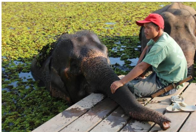
Mahout with elephants at bath time

ElefantAsia has been working in Laos for 12 years. Years of visiting every captive elephant they could find with their mobile clinic has built trusting relationships. Today, elephant owners and mahouts are calling for help more frequently and the owners, who are making an income with their elephant, are usually willing to pay for treatment. The mobile units and clinic have helped improve the lives of the elephants by providing inoculations, de-worming medications, other treatments, and kits of basic elephant medical supplies for the mahouts. ElefantAsia has also initiated a breeding incentive program in which elephant owners/mahouts are paid for the elephant's "maternity leave" (from near birth until the calf is 18 months of age). The owner is also given a small plow to assist with alternative income while his elephant is out-of-work.