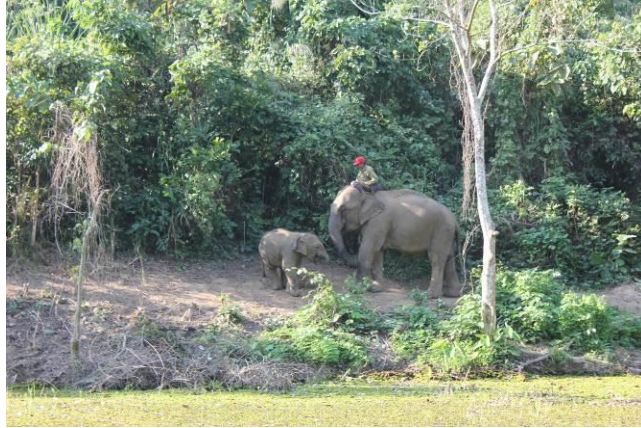
Mom and calf who are part of a breeding incentive program

Please visit www.elefantasia.org to learn more about the Elephant Conservation Center and ElefantAsia.