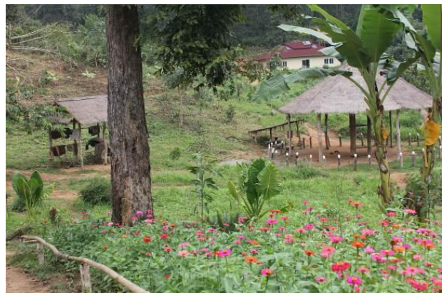
This is where eles and visitors interact. The red roof in the background is the hospital. As you can see, they need a need barn!

The ECC has arrangements with local villages to provide training on growing food for the elephants and a "guarantee purchase" program to create sustainable relationships. Recently, a French agronomist worked for six months to start a gardening system using solar-powered irrigation from the lake to create sustainable food growth for a population of 12 to 15 elephants year round. This program has also reduced the use of fertilizers and "slash and burn agriculture" through education and support of local producers. In addition, the ECC offers job opportunities to a dozen or more people.