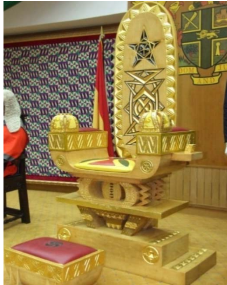
Figure 4. The Seat of State ( Asesequa ), now referred to as The Presidential Seat.

According to Essel et al. (2014), like any system of writing, the non-verbal communicative pungency of Adinkra is dissolved in its proverbial and idiomatic messaging that may eschew straightforwardness but imminent in brevity of expression. Its usage prompts interpretational rhetoric dependent on the circumstantial contextualization of a particular Adinkra symbology. Adinkra links a particular symbol to a unique meaning in the culture of the Akan. The main symbols used to decorate the Asesequa (Seat of State) therefore were all taken from the collection of Adinkra symbols and the traditional Ghanaian stool symbolism. The seat is completely adorned with real gold finish to symbolize the life and sovereignty of the Nation State of Ghana. The signs, symbols and images used in the design and production of the Asesequa were therefore expected to represent some of the basic communal principles which have guided the lives and activities of the Ghanaian society throughout the ages.