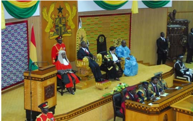
Figure 13. Political Culture of the Presidential Seats in the 4th Republic (3rd President) (Photo courtesy ISD, Accra).