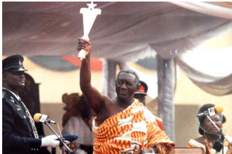
Figure 19. President John A. Kufuor showing the State Sword after having been sworn-in into office on 7th January, 2001.