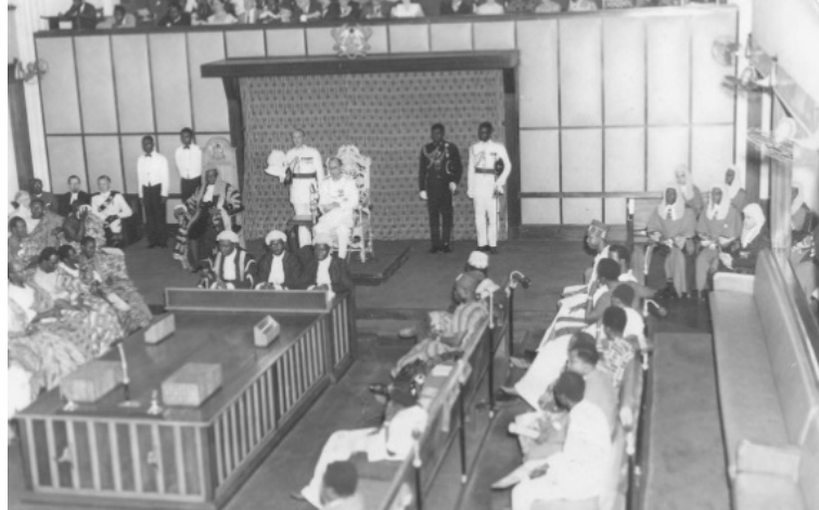
Figure 1. The Seat used by the governor when he visited the National Assembly.