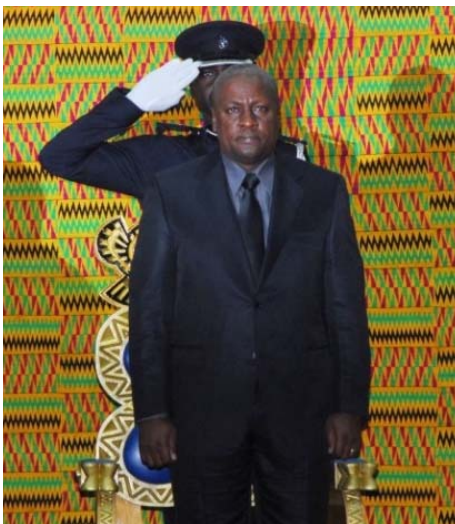
Figure 8. Vice-President John D. Mahama on the Vice-Presidential Seat on 24th July 2012.