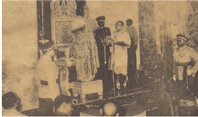
Figure 7. Osagyefo Dr. Kwame Nkrumah taking the oath of office with the DmanAkomfowa (State Sword) on the Chair of State.