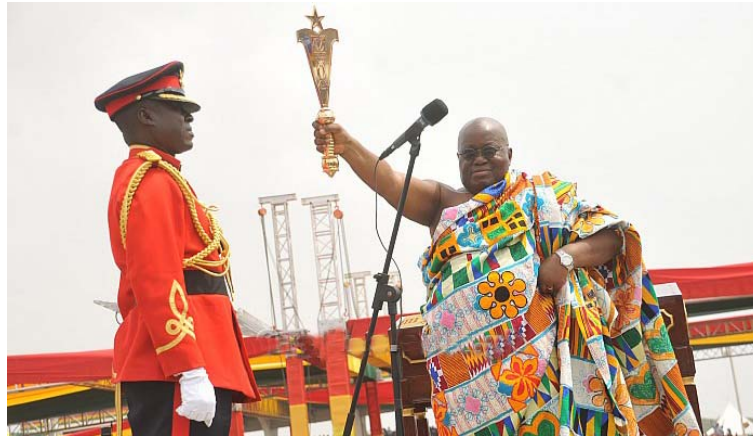
Figure 21. President Nana AkufoAddo showing the State Sword after having been sworn-in into office on 7th January, 2009