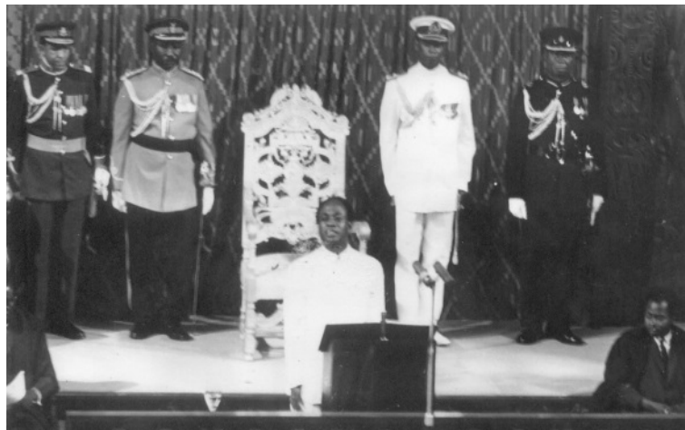
Figure 2. The Seat used by Nkrumah when he visited the National Assembly.

In describing the Presidential Seats designed and made by Kofi Antubam with the help of some local carvers, Fosu (1986) pens that: