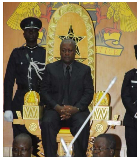
Figure 9. President John D. Mahama on the Presidential Seat on 24th July 2012.