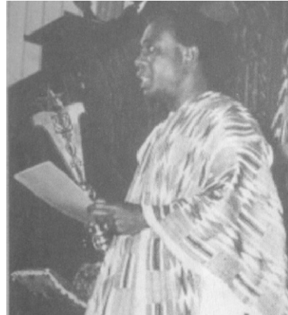
Figure 18. Nkrumah taking the oath of office with The State Sword.