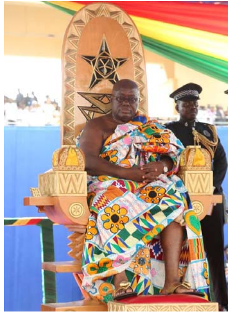
Figure 11. President Nana Akufo-Addo sitting on the Presidential Seat after his swearing-in.