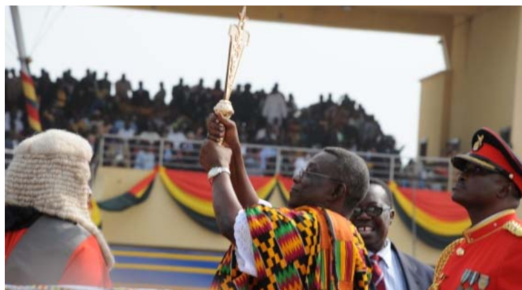
Figure 20. President John Evans Atta-Mills showing the State Sword after having been sworn-in into office on 7th January, 2009.