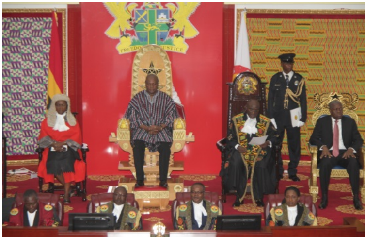
Figure 14. Political Culture of the Presidential Seats in the 4th Republic (4th President) (Photo courtesy ISD, Accra).