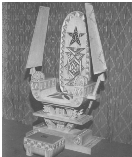
Figure 5. The original design of the Asesequa (The Seat of State), now referred to as The Presidential Seat (Photo courtesy ISD, Accra).

According to Essel et al. (2014), like any system of writing, the non-verbal communicative pungency of Adinkra is dissolved in its proverbial and idiomatic messaging that may eschew straightforwardness but imminent in brevity of expression. Its usage prompts interpretational rhetoric dependent on the circumstantial contextualization of a particular Adinkra symbology. Adinkra links a particular symbol to a unique meaning in the culture of the Akan. The main symbols used to decorate the Asesequa (Seat of State) therefore were all taken from the collection of Adinkra symbols and the traditional Ghanaian stool symbolism. The seat is completely adorned with real gold finish to symbolize the life and sovereignty of the Nation State of Ghana. The signs, symbols and images used in the design and production of the Asesequa were therefore expected to represent some of the basic communal principles which have guided the lives and activities of the Ghanaian society throughout the ages.