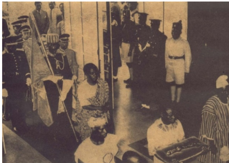
Figure 16. The bearer of the State Sword ( ɔmanAkomfowa) leads Osagyefo Dr. Kwame Nkrumah to the chamber of parliament on Monday 1st July, 1960.

The Sword of State is the symbol of Presidential authority. In an article entitled, State Sword published in the 2nd July, 1960 edition of the Daily Graphic, it was stated that, this is the Sword of State, the symbol of Presidential authority which was held by the President when he took the Oath of State at his inauguration. It is carried before him when he attends the National Assembly for the State opening of Parliament on Monday [4th July, 1960] (p. 3). It was first held by Osagyefo Dr. Kwame Nkrumah when he swore the oath of office on 1st July, 1960. It is of solid gold and its design is based on that of the double-bladed Afena-nta (the traditional symbol of inter-state peace) (Longdon, 1960; Abbey, 2008).