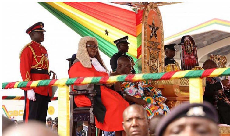
Figure 10. The President Elect sitting on an “ordinary” seat beside the Presidential Seat.

It must be noted also that, on 7th January 2017 during the swearing-in into office of Nana AkufoAddo as the fifth president of the Fourth Republic of Ghana, the president elect was offered an “ordinary” seat beside the Presidential Seat which was used only by the President elect at the beginning of the ceremony because, constitutionally he was not the president. It was only after he had been sworn in as president and taken the oath of office that he was led to sit on the Presidential Seat.