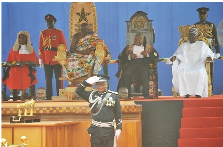
Figure 15. Political Culture of the Presidential Seats in the 4th Republic (5th President).