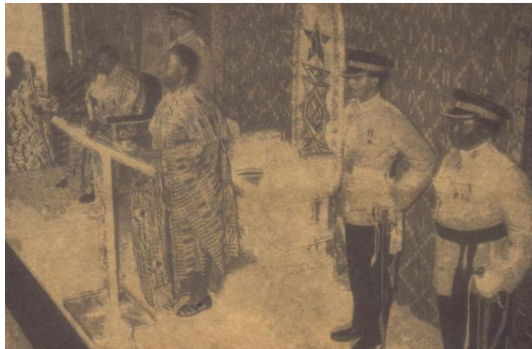
Figure 6. Osagyefo Dr. Kwame Nkrumah at the First Session State Opening of Parliament (Photo courtesy of Longdon, 1960).

The base of the traditional stool signifies the stability of the earth. The innovation in the design of the Presidential Seat is the inclusion of the foot stool and a base for the Asesequa . It incorporates abstract traditional motifs and four skewed supporting columns which comes in between the Asesequa and the huge base that signifies the nation's political stability. Embossed at both ends of the front of this huge base is the Adinkra symbol known as either Akosane (literary meaning went but, returned) or Dame-Dame (draft; a board game). The symbol Akosane is the Ghanaian symbol of reincarnation whiles to those who referred to the same symbol as Dame-Dame , associate the symbol to intelligence and ingenuity as is needed in the game of draft.