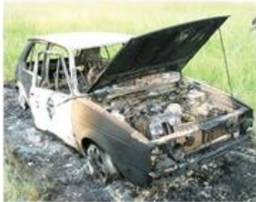
Burnt car of Charl Geldenhuys

GELDENHUYS Charl.Beaten & torched along road. Holfontein.