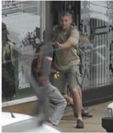
VILLIERIA PRETORIA - Afrikaans teen rescued from 3hr hostage ordeal by SAPS task force Jan 29 2011 http://www.beeld.com/Suid-Afrika/Nuus/Boere-vang-verkrachter-20110301

UNNAMED PRETORIA TEENAGE GIRL. Held hostage & tied up in shop.