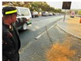
Blood trail of Kim in road where she had been dragged by taxi