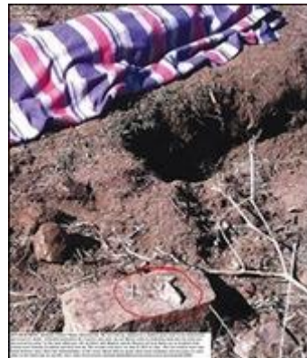
Thinus Uitenweerde next to his shallow grave