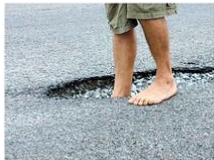
This is the pothole that damaged the wheels

http://m.news24.com/beeld/Suid-Afrika/Nuus/Skade-van-n-slaggat-lei-tot-