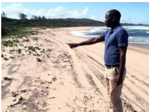
Security guard points out scene of attack

UNNAMED BLYTHEDALE BEACH holiday-maker boy aged 17 AND his girlfriend aged 16 walked about 1km along Blythedale Beach from the Prince's Grant holiday resort at around midday and sat down on their beach towels. 3 Men armed with knives attacked them. The boy was stabbed in the leg and then used the towels to tie up his arms and legs. They dragged his girlfriend down the beach and then up a