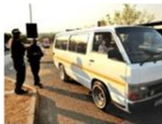
Taxi driver leaving to go to police station

MCCUSKER Kim, advocate aged 25, AND her finance were driving along the Lonehill Boulevard in their pick-up van at around 06:45 to a gymnasium when a taxi which had been weaving through the traffic, scraped the side of their van but refused to pull over. At the four-way stop intersection at Concourse Crescent where the traffic was congested, her fiancé pulled up alongside the taxi, climbed out, checked the damage to their vehicle and tried to get information from the taxi driver for insurance purposes. Kim also got out of their van and stood in front of the taxi while her fiancé argued with the taxi driver. In the middle of the argument the taxi driver pulled off, knocked Kim over and continued speeding away while she was