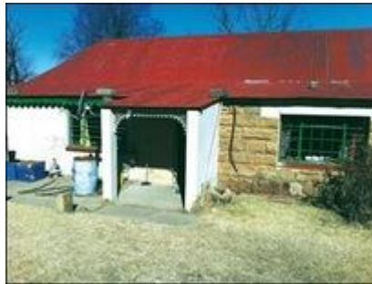
THE UITENWEERDE HOMESTEAD