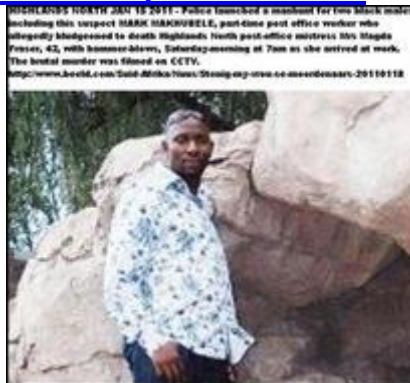
Killer of Fraser caught on cctv

http://www.farmitracker.com/reports/view/957