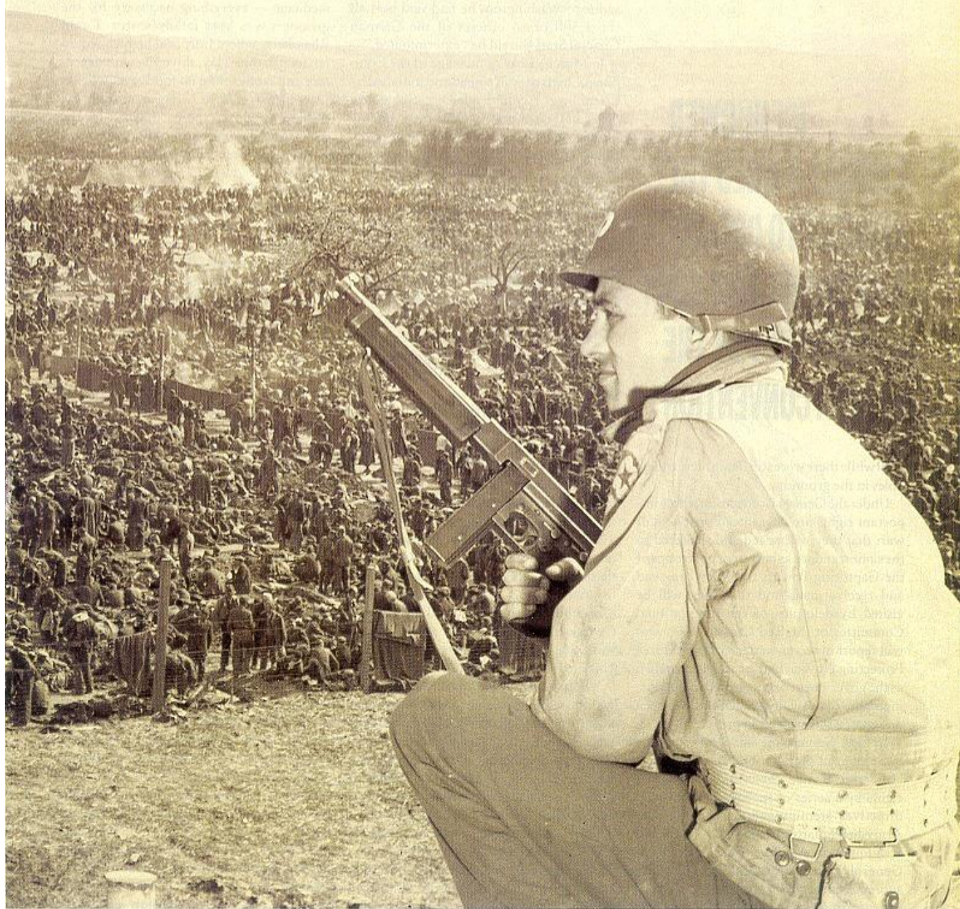
photograph U.S. Army Archives

A German newspaper, Rhein-Zeitung , has identified this uncaptioned U.S. Army photograph of German POWs as: camp at Sinzig-Remagen, spring, 1945