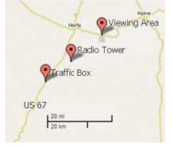
Figure 1. Map showing the location of the mystery lights viewing area, a lighted radio tower, and the traffic monitoring station relative to the town of Marfa, TX. The mystery lights appear along the line connecting the viewing area and the radio tower.

Between 10 and 14 May 2004 a dozen members of the UT Dallas chapter of the Society of Physics Students conducted a series of experiments in order to determine the origin of mysterious lights commonly seen near the town of Marfa, TX (30.3^{\circ} \text{ N}, 104.0^{\circ}) The Marfa mystery lights are a W). phenomenon that occurs after dusk outside the town of Marfa, Texas where lights are observed to appear, disappear, and move about seemingly at random on the horizon. The location of the mystery lights viewing area to Marfa, TX is illustrated in figure 1.