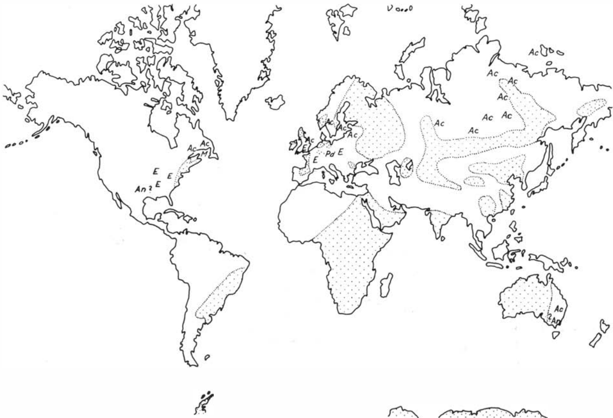
Fig. 1. Distribution of phacopid trilobites in Lower Silurian (Llandoveryan – Wenlockian). Ac = Acernaspis , An = Ananaspis , E = Eophacops , M = Murphyocops , Pd = Phacopidella . Supposed land areas stippled.

The first unquestionable representatives of the family Phacopidae appear near the Ordovician/Silurian boundary. The oldest well known genus is Acernaspis , widely distributed in the Llandoveryan. The occurrences of Acernaspis are concentrated mainly in the shallow-water carbonate facies; they are traceable from eastern North America (Anticosti, Nova Scotia) across the British Isles to the Baltic Region (abundant e.g. in Estonia, see Männil 1970). These phacopids are also widely distributed in similar facies of the Siberian platform and are known from the Arctic region (New Siberian Islands). The occurrences of Acernaspis furnish evidence of migration through shallow seas between eastern North America, northern Europe, and Siberia, i.e. in a relatively continuous belt belonging to the warm zone (benthos rich carbonate facies). The absence of Acernaspis in southern Europe and northern Africa may be explained by a less favourable living environment in the mudstone facies or by palaeoclimatic conditions (cooler zone of the Silurian southern hemisphere, see the interpretation of mudstone graptolite-