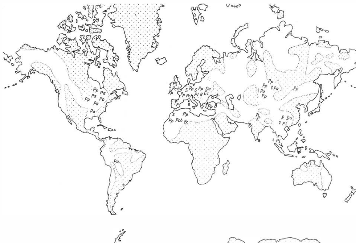
Fig. 4. Distribution of phacopid trilobites in Middle Devonian (Eifelian s. lat. — Givetian). Pp = Phacops (Phacops), Pa = Phacops (Paciphacops), Pch = Phacops (Chotecops), B = Phacops (Boeckops), R = Reedops, Ec = Eocryphops, Pl = Plagiolaria, S = Struveaspis, Du = Ductina. Supposed land areas stippled.

Assessment of phacopid occurrences in the Lower/Middle Devonian boundary interval is difficult because the Lower/Middle Devonian boundary is conceived differently by individual (German, French, Czechoslovak, and Soviet) geological schools. If this boundary were identified with the upper boundary of the Zlíchovian, as the case in the Bohemian magnafacies often is, the beginning of the Middle Devonian would be distinguished by a high differentiation of phacopid genera and subgenera: Phacops ( Chotecops ), Eocryphops , Struveaspis and Ductina would make their first appearance, and Phacops ( Phacops ), Phacops ( Paciphacops ), Plagiolaria , and the last representatives of Reedops and Phacops ( Boeckops ) would survive from the Lower Devonian. Most of these phacopids occur in the carbonate and pelitic facies of the Bohemian magnafacies of Europe, and North Africa. Remarkable are phacopids with reduced eyes ( Eocryphops ,