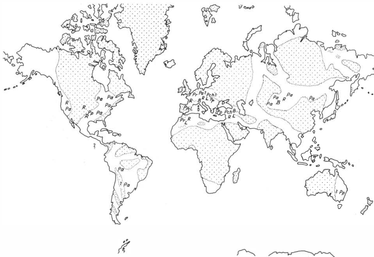
Fig. 3. Distribution of phacopid trilobites in Lower Devonian (Lochkovian – Zlíchovian). Pp = Phacops (Phacops) , Pa = Phacops (Paciphacops) , Pr = Phacops (Prokops) , B = Phacops (Boeckops) , L = Lochkovella , R = Reedops . Supposed land areas stippled.

The typical Rhenish magnafacies of the Old World Province with prevailing clastic sedimentation is relatively poor in phacopids. This is most probably caused by unfavourable environment (strong supply of terrigenous sandy material).