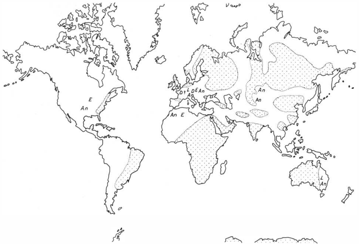
Fig. 2. Distribution of phacopid trilobites in Upper Silurian (Ludlovian – Přídolian). An = Ananaspis , E = Eophacops , D = Denckmannites , L = Lochkovella . Land areas stippled.

bearing facies in Berry & Boucot 1967). The finds of Acernaspis in south-eastern Australia suggest that the distribution was greater than is inferable from the occurrences known so far.