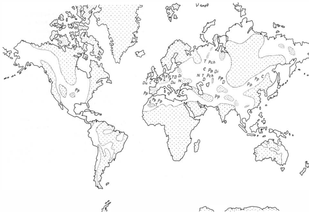
Fig. 5. Distribution of phacopid trilobites in Upper Devonian (Frasnian — Famennian). Pp = Phacops (Phacops), Pch = Phacops (Chotecops), C = Cryphops, D = Dianops, Di = Dienstina, Du = Ductina, N = Nephranops, T = Trimerocephalus.

Characteristic of the Famennian is the rich development of phacopids with reduced eyes ( Nephranops , Dienstina ), or phacopids completely blind ( Trimerocephalus , Dianops , Ductina ). As in the Middle Devonian, the phacopids with reduced eyes are concentrated in the facies, which is of rather pelagic, both shaly and impure, limestone character. They can be distinguished from so-called Clymenia Limestones, where they are accompanied occasionally by phacopids with well developed eyes (Maksimova 1955; Chlupáč 1966). The occurrences of these phacopids have been established in the Old World Province, mainly in geosynclinal areas: European Variscan geosyncline (southern England, northern France, Rhineland, Harz, Saxony — Thuringia, Frankenwald, Poland, Silesia, Moravia, Carnic Alps, North Africa, Asia Minor, Ural region, Kazakhstan).