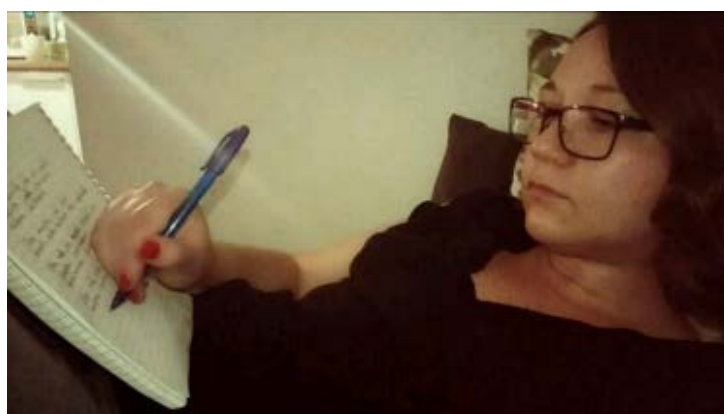
Figure 2. In this Tinder profile photo, the participant is writing poems. She also wrote a poem on her Tinder profile to illustrate further this interest. With the photo, she wanted to show the deep and thoughtful side of her personality in order to find a similar person.