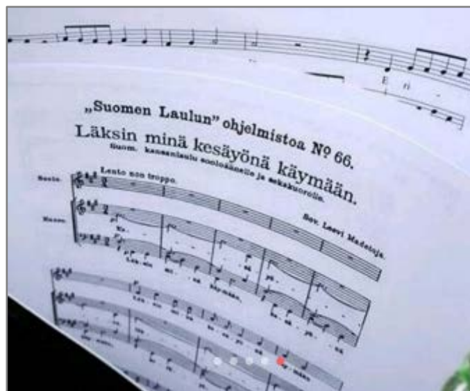
Figure 3. A participant put a photo of a musical notation on her Tinder profile to symbolize how important music is for her.

For pictures to bring a couple closer, they do not have to be photos taken by the sender. In fact, pictures or videos can build intimacy also when an unknown other person’s social media posts are shared. Some participants shared funny and cute pictures or videos by, for example, tagging the other person in the comments of the picture. This kind of tagging is often mutual and it can thus create solidarity. It shows that the tagger is thinking about the other person.