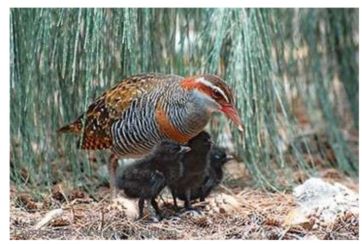
Buff-banded Rail

On then to Burrill to hunt for the Buff-banded Rail. I was rather pessimistic, as I feared the Rails knew the date and had decided to hide, as they had on previous occasions. However we were in luck with a wonderful view of a Buffbanded Rail having a bath. A Little Egret showed up around the corner too. By this time the light was failing, but Rosemary urged us on to the Ulladulla Lighthouse. We arrived, but the birds had gone to bed. By the time we arrived home it was really dark. The tally for the afternoon was 48. Not bad, but it is a game of diminishing returns.