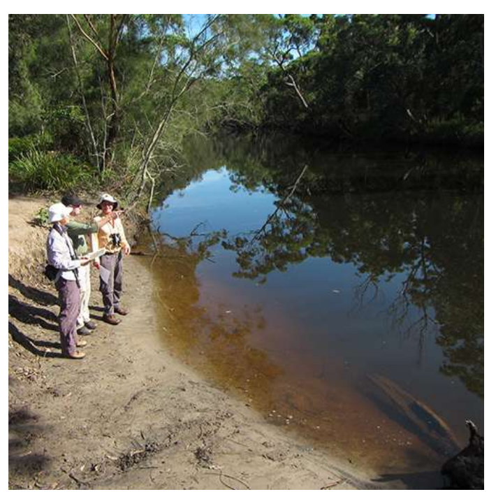
Some BirdLife Shoalhaven members inspecting the wetland

The bird hide (at right) is also a two storey bird hide. It is located at Hasties Swamp on the Atherton Tableland in Northern Queensland. Both of the bird hides pictured are well known to bird watchers, and they are major tourist attractions in their respective areas.