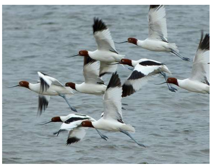
Avocets at Lake Wollumboola