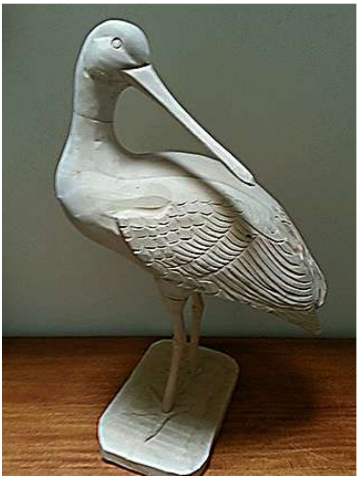
A Wooden Spoonbill - but not part of the team!

(The Twitchathon is an annual event to raise money for a project of Birdlife Australia. This year it was for the Greater Sydney Powerful Owl Project. Teams have to identify as many species as possible over 24 hrs from 4.00 pm Saturday to 4.00 pm Sunday. More than half of the team has to identify the bird. There are three divisions, the Main Race which is full on, the Champagne race which is rather more laid back, and the children's races. This year the MUD Birdwatchers fielded one team, the Wooden Spoonbills.)