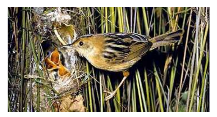
Golden-headed Cisticola

Next we called in to Croobyar Rd . As we turned down it we saw a bird on the wires, its back to us. We eventually hauled out the 'scope. The bird flew off as we were setting it up. Thoroughly cheesed off after this example of avian non-cooperation, we drove down the road, pausing to scan a farm dam. Ah, Pacific Black Ducks that we hadn't seen already. But what was that black thing swimming across the dam? A black snake, and going at a fast clip too! The ducks on the dam were not impressed. When we arrived at the little bridge where we hoped to pick up Australian Reed-warblers and Fairy Martins (and did) we were also treated to a Golden-headed Cisticola. We were already over 80 birds.