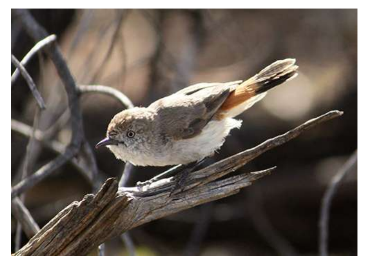
Chestnut-rumped Thornbills were the most common small birds, and we heard Pallid Cuckoos and Crested Bellbirds calling every day.

While at the homestead we had Sacred Kingfishers as a regular wakeup alarm - and they called all day long - and after a while the incessant calling really started to get on our nerves - a good problem to have! It sounded and appeared like they had a nest nearby but we never found where it was unless they had borrowed a Fairy Martin nest - there were dozens under the eaves.