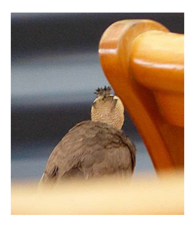
We are pretty sure that the bird shown above was an Indian Mynah - having a very bad hair day!

BirdLife Shoalhaven Newsletter - Summer 2016 - Page 3