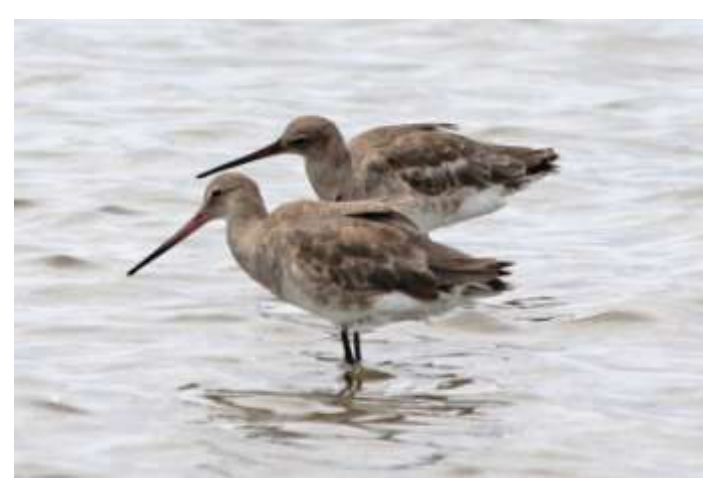
Blackwit, Barwit or Hudwit ???