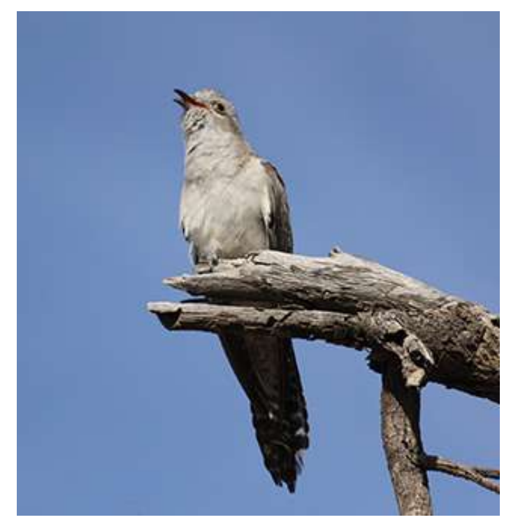
Other bird highlights for us were a Latham's Snipe residing at the lagoon for the duration, Sharp-tailed Sandpiper at the lagoon for one day, Crimson Chats in numbers, Pied Honeyeaters, Black Honeyeater, Red-

winged and Mulga Parrots, Budgies and Cockatiels, Blackeared Cuckoos, Red-backed Kingfishers, Major Mitchell Cockatoos, Hooded and Red-capped Robins and of course the finches - Double-barred and Zebra.