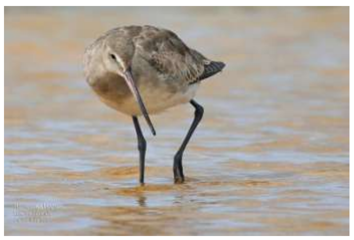
Hudsonian Godwit

Early in January I saw a White-winged Triller near Jindyandy. I have only seen it twice before at Culburra – both times in 2004 – again in January and also in October.