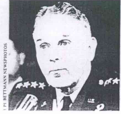
General Maxwell Taylor authored the three policy directives which rocked the CIA, the Pentagon and the State Department.

And in May 1959, this White House presidential committee had suggested in the same report, "Military equipment and labor can expedite completion of village communal projects. . . Only thus can an enduring relationship be estab-