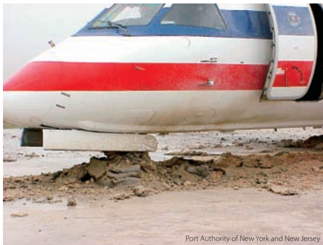
A Saab 340B arrestment occurred in 1999 at John F. Kennedy International Airport.