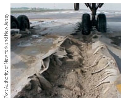
Port Authority of New York and New Jersey

An arrestor bed at John F. Kennedy International Airport was crushed by a McDonnell Douglas MD-11 in 2003.