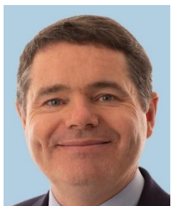
Paschal Donohoe (F.G.)