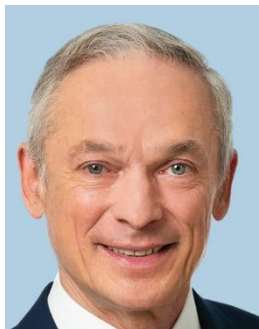
Richard Bruton (F.G.)