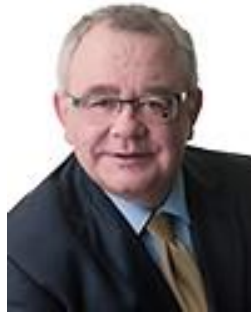
Ceann Comhairle Seán Ó Fearghail (F.F.) *