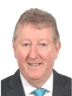
Seán Canney (N.P.)