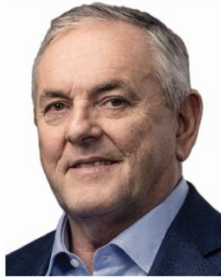
John McGuinness (F.F.)