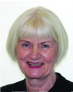
Marian Harkin