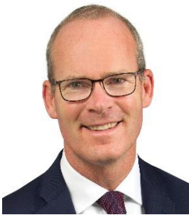
Simon Coveney (F.G.)