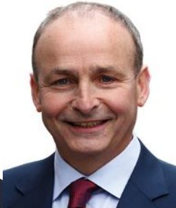
Micheál Martin (F.F.)