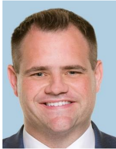
Neale Richmond (F.G.)