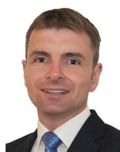
Ruairí Ó Murchú (S.F.)