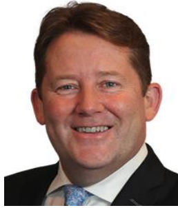
Darragh O'Brien (F.F.)