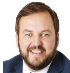
Pádraig MacLochlainn (S.F.)