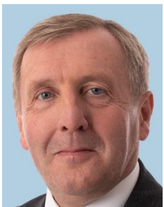
Michael Creed (F.G.)