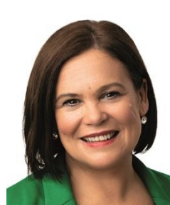
Mary Lou McDonald (S.F.)