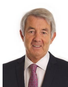
Michael Lowry