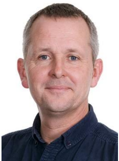
Richard Boyd-Barrett (S.P.B.P.)