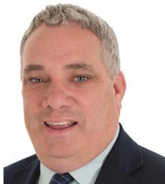
Aengus Ó Snodaigh (S.F.)