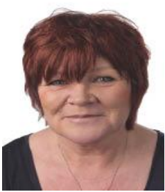
Joan Collins