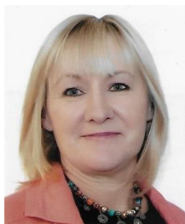
Imelda Munster (S.F.)