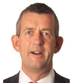
Maurice Quinlivan (S.F.)