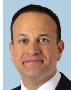
Leo Varadkar (F.G.)