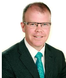
Peadar Tóibín (A.)