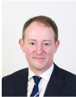
Sean Sherlock (Lab.)