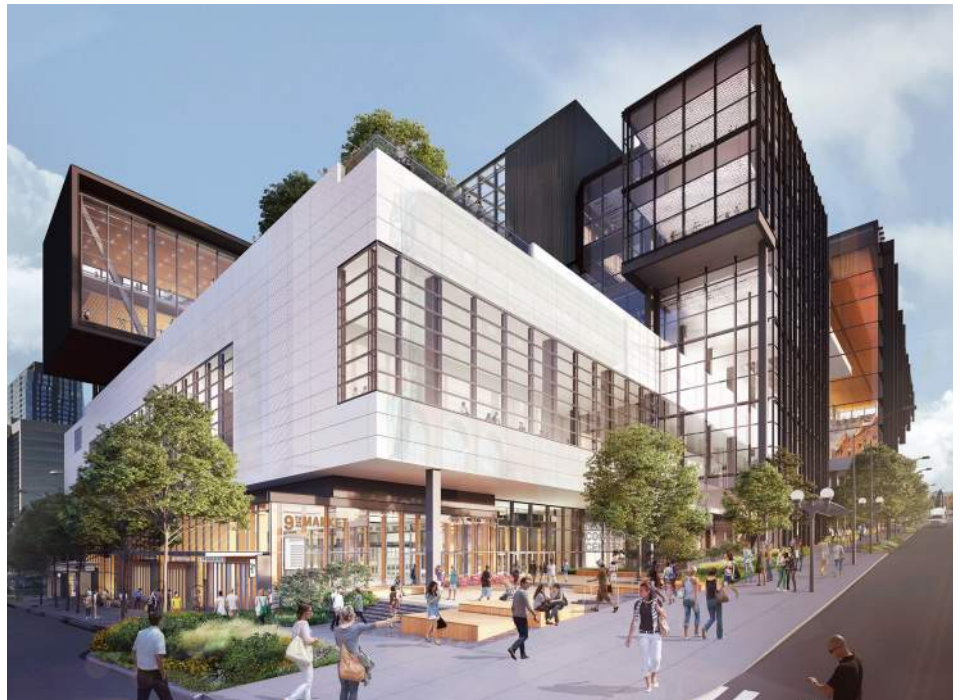
View of Summit looking northeast from Ninth and Pine

In the past five years alone, the Convention Center could not accommodate some 350 event proposals due to a lack of space or available dates, which cost our region an estimated $2.13 billion in potential revenue for local hotels, restaurants, cultural attractions and other hospitality businesses. The addition of Summit will double the Convention Center’s capacity to address Seattle’s growing event needs.