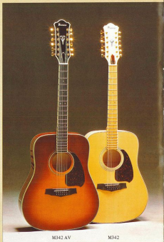
M342 AV M342

M370 models feature beautiful body binding bound with careful handcraftsmanship to ensure the attractive quality appearance.