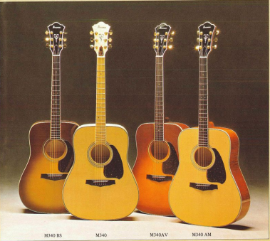
M340 BS M340 M340AV M340 AM