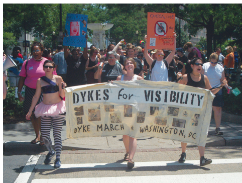
Dyke March through Dupont Circle

Dupont Circle has played a major role in all aspects of LGBT life in D.C.: a meeting spot and a place to “see and be seen”; a place of celebration, including a reviewing stand for the annual gay Pride parades, and home to Youth Pride events and Dyke Marches; and a place for the community to gather in protest and sorrow. It has a history as a meeting and cruising area for gay men that dates back to the early 20th century.