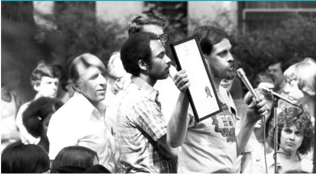
First D.C. Pride, 1975, 20th Street

The offices, restaurants and stores of today's Dupont Circle offer few hints of when the neighborhood attracted individuals and groups associated with a variety of progressive political causes, including a growing sense of LGBT community. In the 1960s, Dupont Circle took a central role in social change and activism for African-American civil rights, women's equality and an end to the Vietnam War. It also created a foundation for Washington, D.C.'s LGBT community to claim its own place in public life.