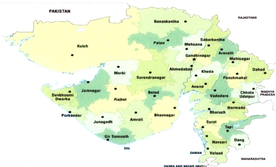
Figure: 2.1 Administrative Map of Gujarat (Districts with their Capitals)