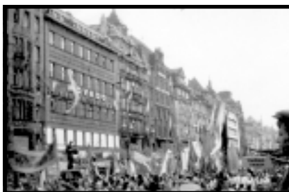
Prague welcoming its returning heroes - May 1945