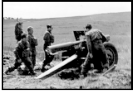
On the artillery range