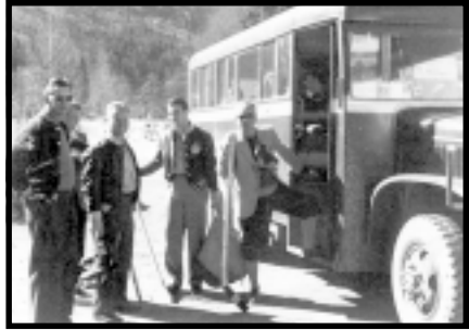
The Czech all-stars who defected - Germany, 1949