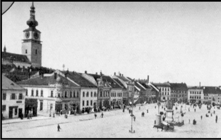
Trebic - Charles Square with Watch Tower in background