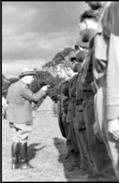
Exiled President Benes reviewing the Czech troops