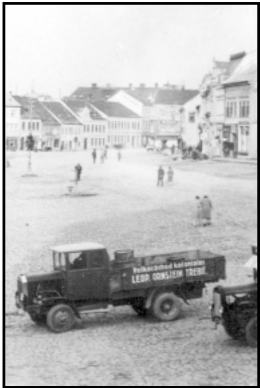
One of the Ornstein trucks - Charles Square, Trebic