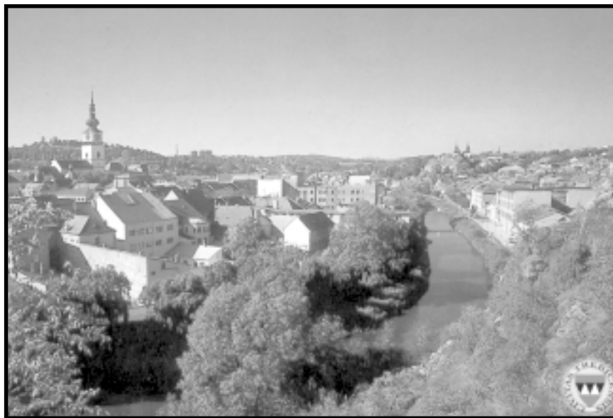
A Contemporary Setting of Trebič