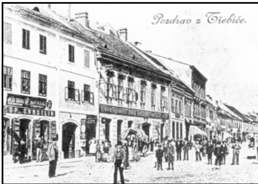
The Ornsten residence and business - Trebič, 1900