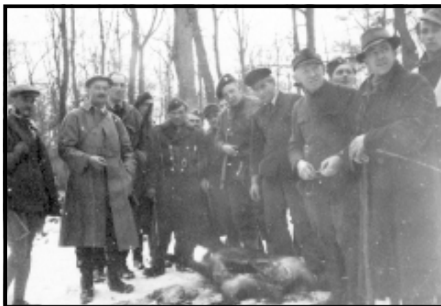
The Boar Hunt - Cleve, 1947