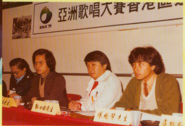
盧國沾與黎小田及張國榮擔任亞洲歌唱大賽香港區的評判(七九年攝) Jim Lo, Michael Lai and Leslie Cheung were Judges of the Asian Singing Contest-HK Region (1979).