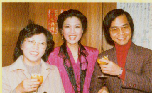
薰妮不少金曲出自盧國沾手筆，與盧氏伉儷已成好朋友 Jim Lo wrote a string of hits for Fanny who has become a good friend of him and his wife.

八一年，憑《找不着藉口》獲頒「CASH最佳中文(流行)歌詞獎」，這首作品運用了「棄車保帥」的寫法，將警句「 來吧，講吧，無謂再等候，或者我愛得深，你找不着藉口 」留到最後，令人聽罷，低徊不已。小調式情歌在該時期亦非常流行，《願君心記取》、《鮮花滿月樓》、《相識也是緣份》、《情若無花不結果》等，婉約深情；寫別後重逢的《相逢有如夢中》更是文學性甚強，意象極為豐富：「 疏林過盡晚風，枯了小草老了壽松，浮雲白了天空，初冬霧色已經變動..... 」，聽著歌詞，一幅幅蕭瑟冬景彷彿呈現眼前。其他還有多首雋永情歌，例如《人在旅途洒淚時》、《殘夢》、《雪中情》等等，今時今日的演唱會，依然有歌手選唱，依然感動樂迷的心。