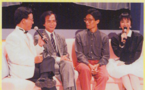
盧國沾與潘源良(右二)一起接受香港電台十大中文金曲頒獎禮兩位司儀的訪問 Jim Lo and Calvin Poon (R2) being interviewed by co-hosts of RTHK's Top Ten Chinese Gold Songs Award Presentation Concert.

盧沾說，每次作詞都很「驚青」，怕的是寫錯了，交了出去，也就覆水難收，所以字字句句都得苦心經營，填得好，也就份外有滿足感。問他作詞可有過人之處？他謙稱自己只是較多一點認真、多一點誠意、多一點心思。也許就是這麼的「一點點」，令盧沾的詞經得起年月的考驗，到了今天，依然贏得樂迷及樂界的掌聲。