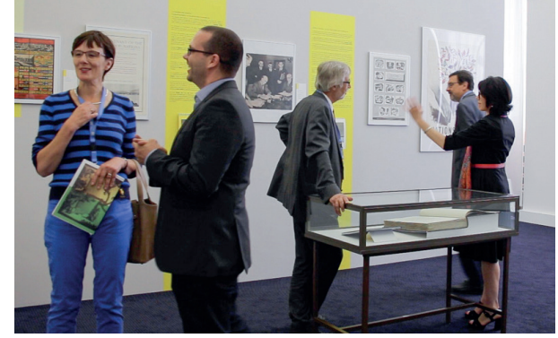
UNITED NATIONS MUSEUM AT GENEVA Building B - 1st Floor