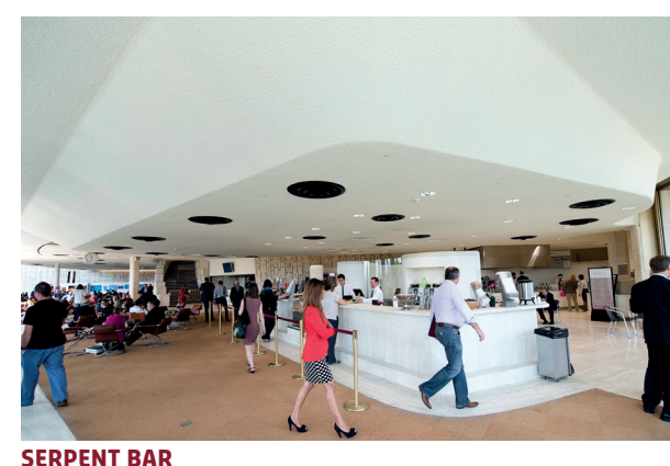
SERPENT BAR Building E - 1st Floor