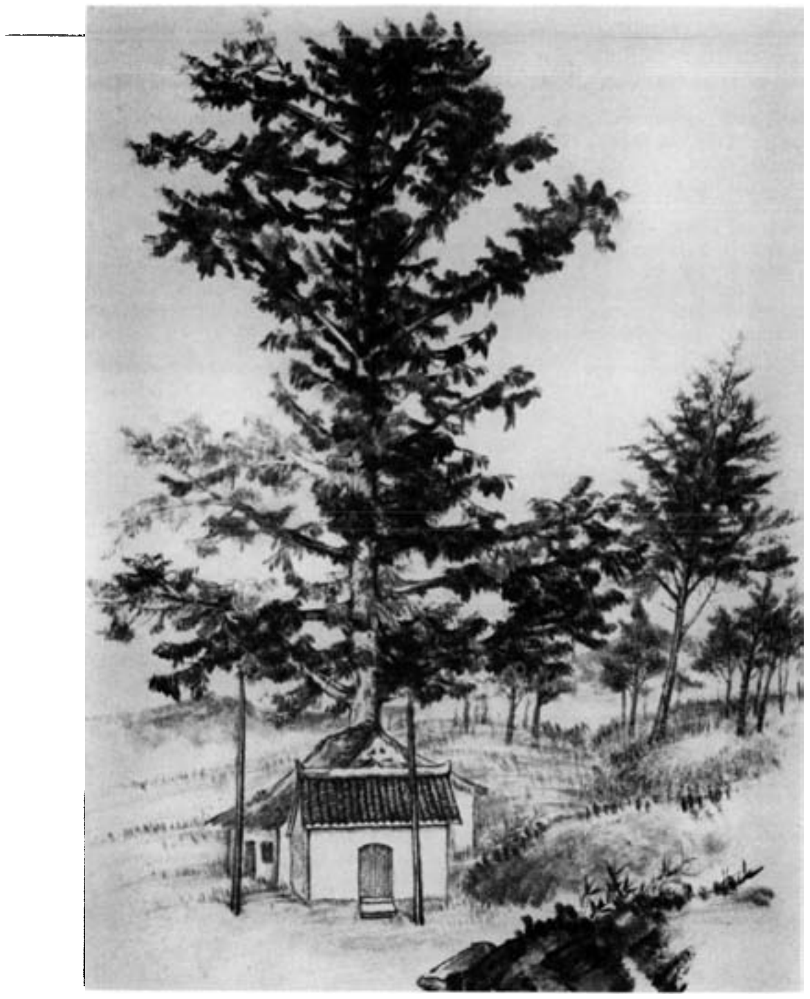
A drawing of the type tree of Metasequoia glyptostroboides growing at Modaoqi village. This illustration, provided through the courtesy of Dr. H H Hu, is from the Archives of the Arnold Arboretum.