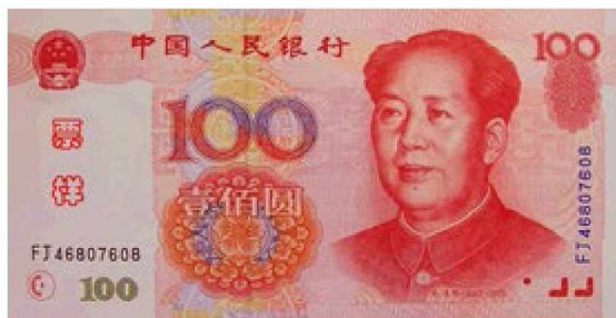
Image: Sample of a Chinese 100-yuan banknote in circulation (front)

Mao's death during the Cultural Revolution came almost as a shock to most Chinese people, as his health problem had not been publicized. The purge of the Gang of Four 14 - which included his last wife Jiang Qing - came soon after. Remaining leaders immediately engaged in a series of political struggles and disputed the legacy of Mao. The CPC's Resolution on "Certain Questions in the History of Our Party Since the Founding of the People's Republic of China", issued later, lend insights into the final consensus. The resolution carried sharp criticism of Mao, deemphasizing him and stressing the contributions of other individuals. The Mao Zedong Thought was still largely acclaimed, but no longer seen as the contribution of Mao alone, but rather as a collective effort by many people, and Mao just happened to be the most noteworthy contributor (CPC 11 th Central Committee, 1981). However, probably to leave room for successors to claim some continuity with Mao and thereby to establish legitimacy, the Resolution refrained from a total repudiation of Mao.