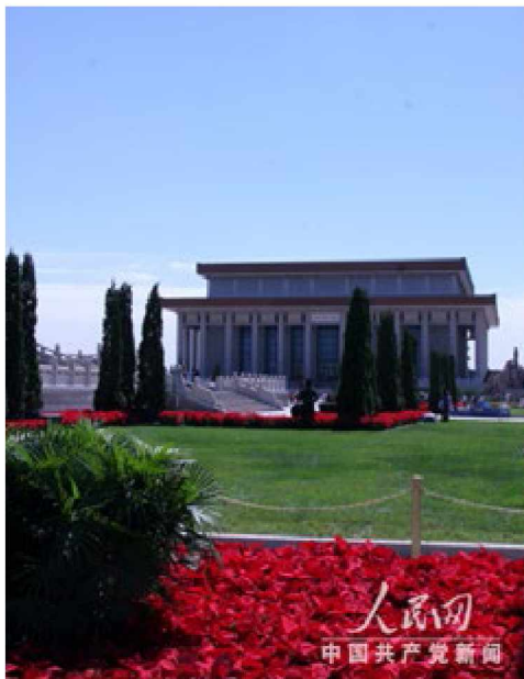
Image: The Mao Zedong Memorial Hall on Tian'anmen Square

Mao was the principal organizer and theoretician of the seizure of power and subsequent nationwide regime establishment for the Communist Party of China (CPC). The Chinese regime, at least before the 1980s, was a totalitarian one, with the mass party of the CPC monopolizing control of all aspects of the country. The communist ideology was overwhelmingly propagated, and the flow of ideas and information was tightly dictated by the party. These conditions fit with the main traits outlined by Friedrich and Brzezinski (1956).