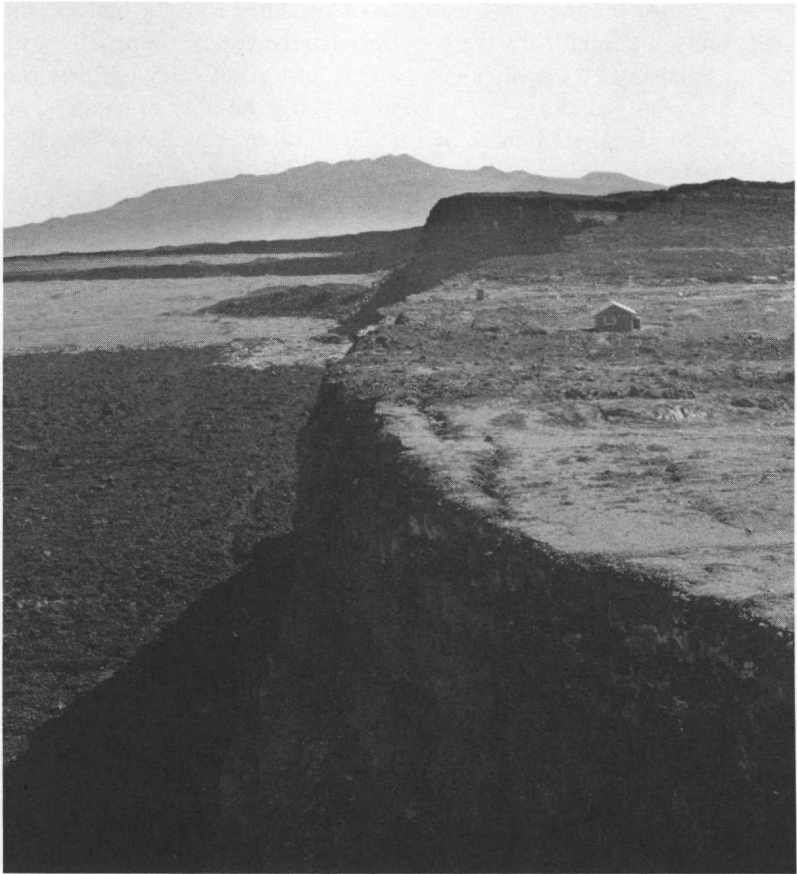
FIG. 2. The western edge of Kilauea crater, site of the Wilkes party camp.

. . . directly over the pool, or lake of fire, at the distance of about five hundred feet above it, and the light was so strong it enabled me to read the smallest print. . . . The whole party was perfectly silent, and the countenance of each individual expressed the feeling of awe and wonder which I felt in so great a degree myself.