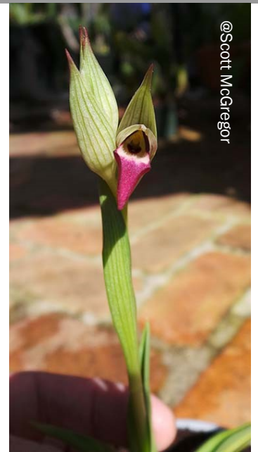
Serapias lingua, another view

Serapias lingua grows in north Africa, Portugal, Spain, France, Greece, Yugoslavia, Turkey, and many of the Mediterranean islands. The climate of all of these Mediterranean lands is very similar to our own. Clearly, this plant feels right at home in southern California.