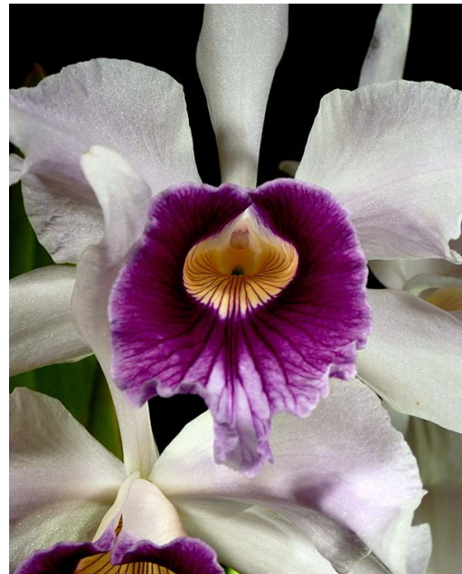
Laelia purpurata f. roxo-violeta

Psychopsis papilio is not portable, with its 4' spikes. A given inflorescence can bloom on and off for several years. This species is a classic example of a very important lesson—do not be in a hurry to cut anything! Sometimes the spikes die at the tip after many bloomings, but then produce a branch and keep on going. If the tip of the spike is light brown, skinny, and brittle, it can be trimmed, but don't cut anything that isn't dry and crispy. In general, I am inclined to leave anything that is green, even if I know it isn't going to bloom again, since one of the efficient strategies of many orchids is to re-absorb the nutrients from spent spikes and pseudobulbs. It's one of the ways that orchids have evolved to not need a lot of fertilizer to support growth. They are excellent recyclers. This species doesn't like its roots disturbed, so an ideal mix is one that won't break down readily, such as Orchiata bark and