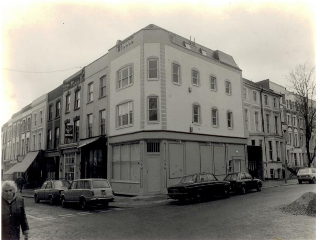
Figure 6: 309 Portobello Road in 1985: The newly acquired base for the Royal Court's Young Peoples' Theatre. 310

It had been condemned by the GLC because it was falling down, so we bought it for something like £40,000: three flats, basement, and shop and we got £100,000 from the GLC to repair it. The flats were all sold and we had the shop and the basement...The basement was offices and a meeting room and the ground floor was the studio with a proper lighting rig. 309