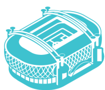
Johan Cruyff Arena

UEFA EURO 2020 is being held across the continent for the first time in the competition's 60-year history, with 12 host cities in all.