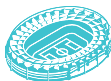
Olimpico in Rome