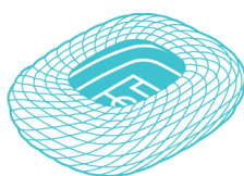
Football Arena Munich