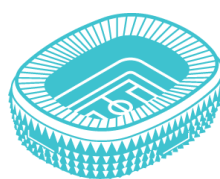
San Mamés Stadium