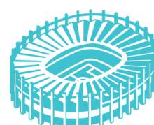
National Arena Bucharest