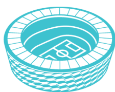
Baku Olympic Stadium