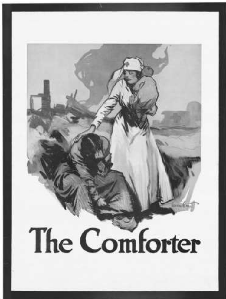
[Photograph of “The Comforter, Red Cross Nurse”.] War Records Survey Posters [graphic material] (R1185-67-0-E, Acc. No. 1983-28-2515)