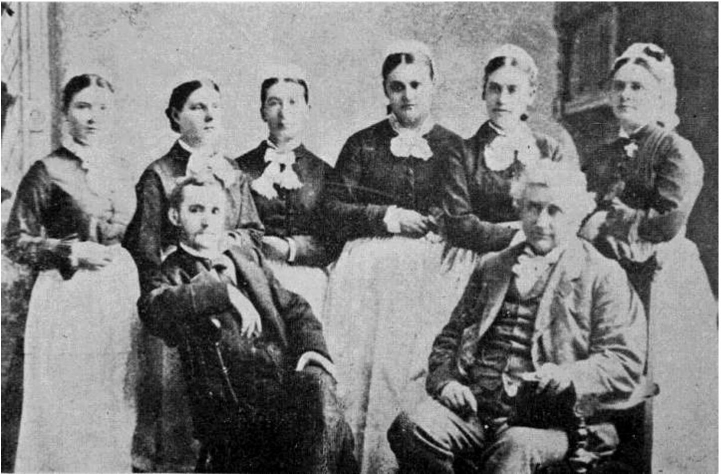
[Photograph of staff and first graduating class of the Mack Training School for Nurses, 1878.]