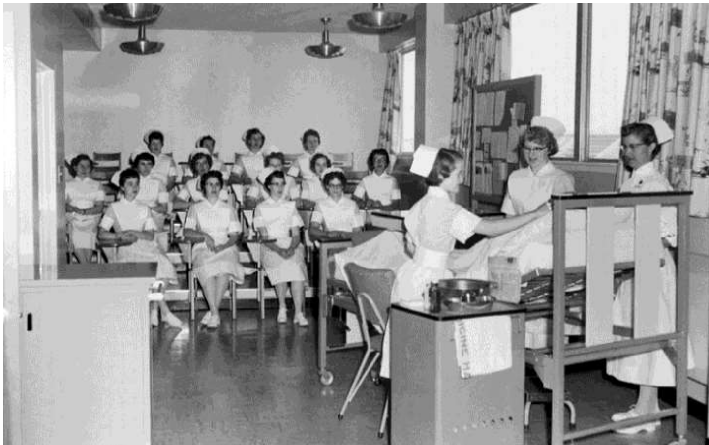
[Photograph of a German, a British, and a French nurse working alongside a Canadian nurse at l'Hôtel-Dieu in Kingston, Ontario.]