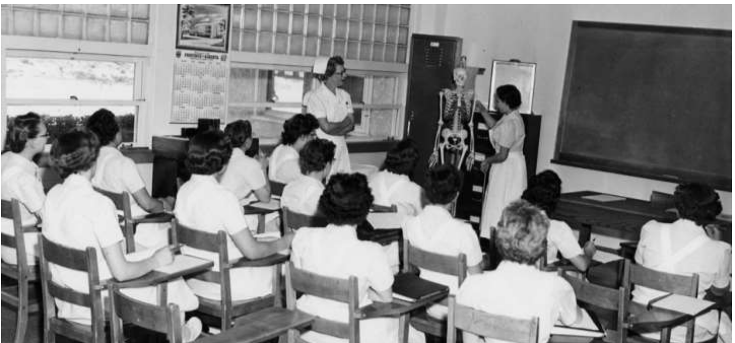
[Photograph of an anatomy class in progress.]