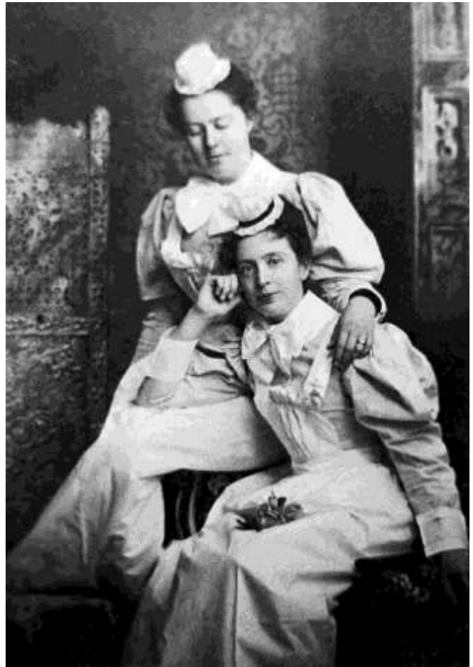
[Photograph of two nurses from the John H. Stratford Hospital Training School for Nurses (later re-named the Brantford General Hospital School for Nurses) in their student nurse uniforms.]