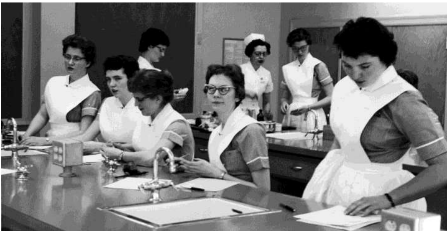
[Photograph of a nurse instructing students at the University of Alberta Hospital.]