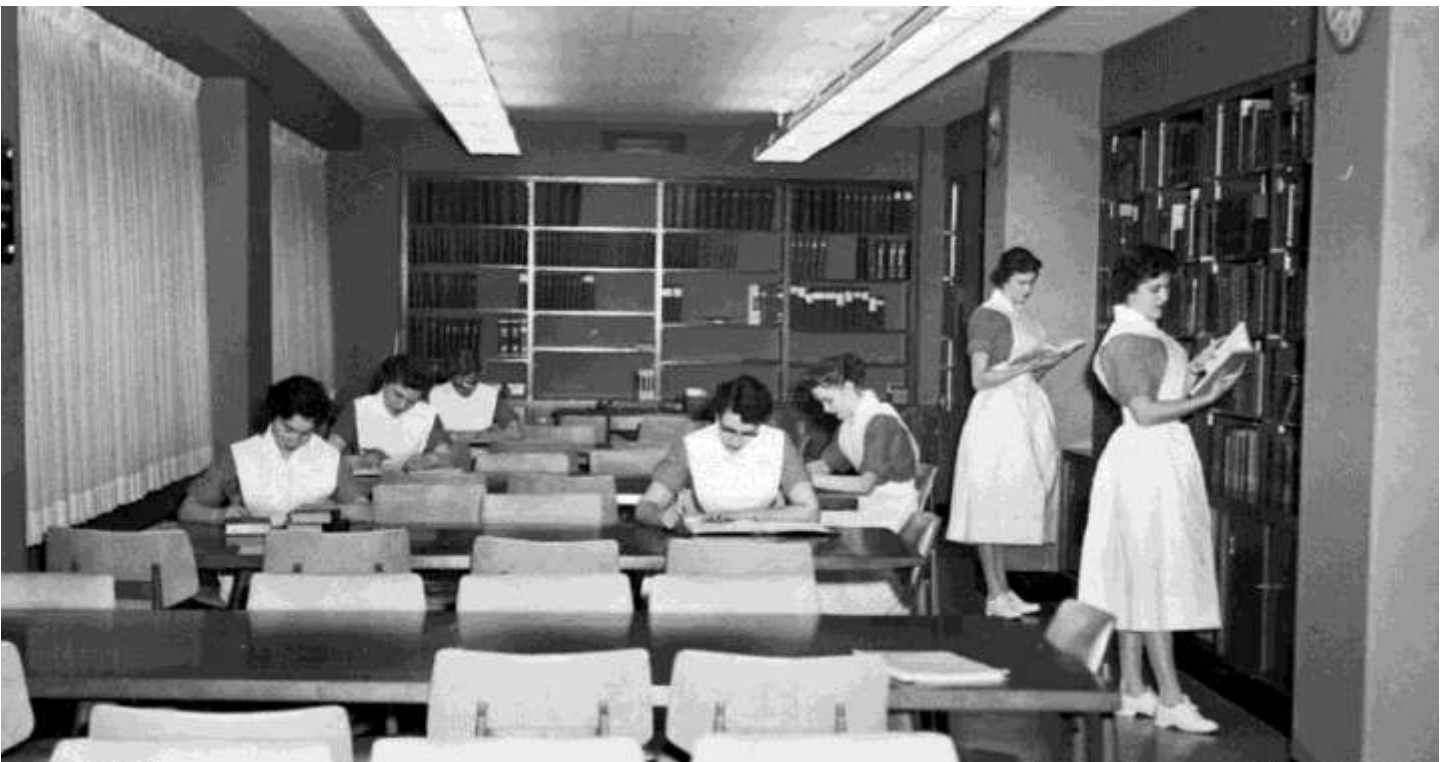
[Photograph of nurses-in-training working in the library at the Winnipeg General Hospital's School of Nursing.] Canadian Nurses Association, Photographs [graphic material] (R4440-16-3-E), Library and Archives Canada, Ottawa, Ontario.