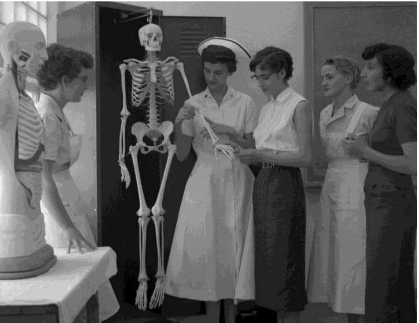
[Photograph of nurses looking at skeleton.]