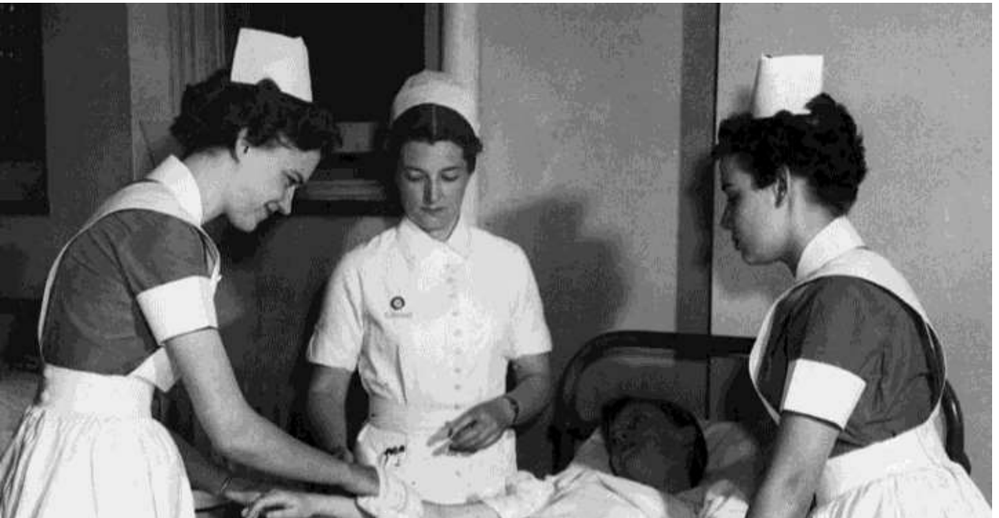
[Photograph of a nurse observing as a nurse in training tends to a patient's arm at the School of Nursing at Sherbrooke Hospital.]