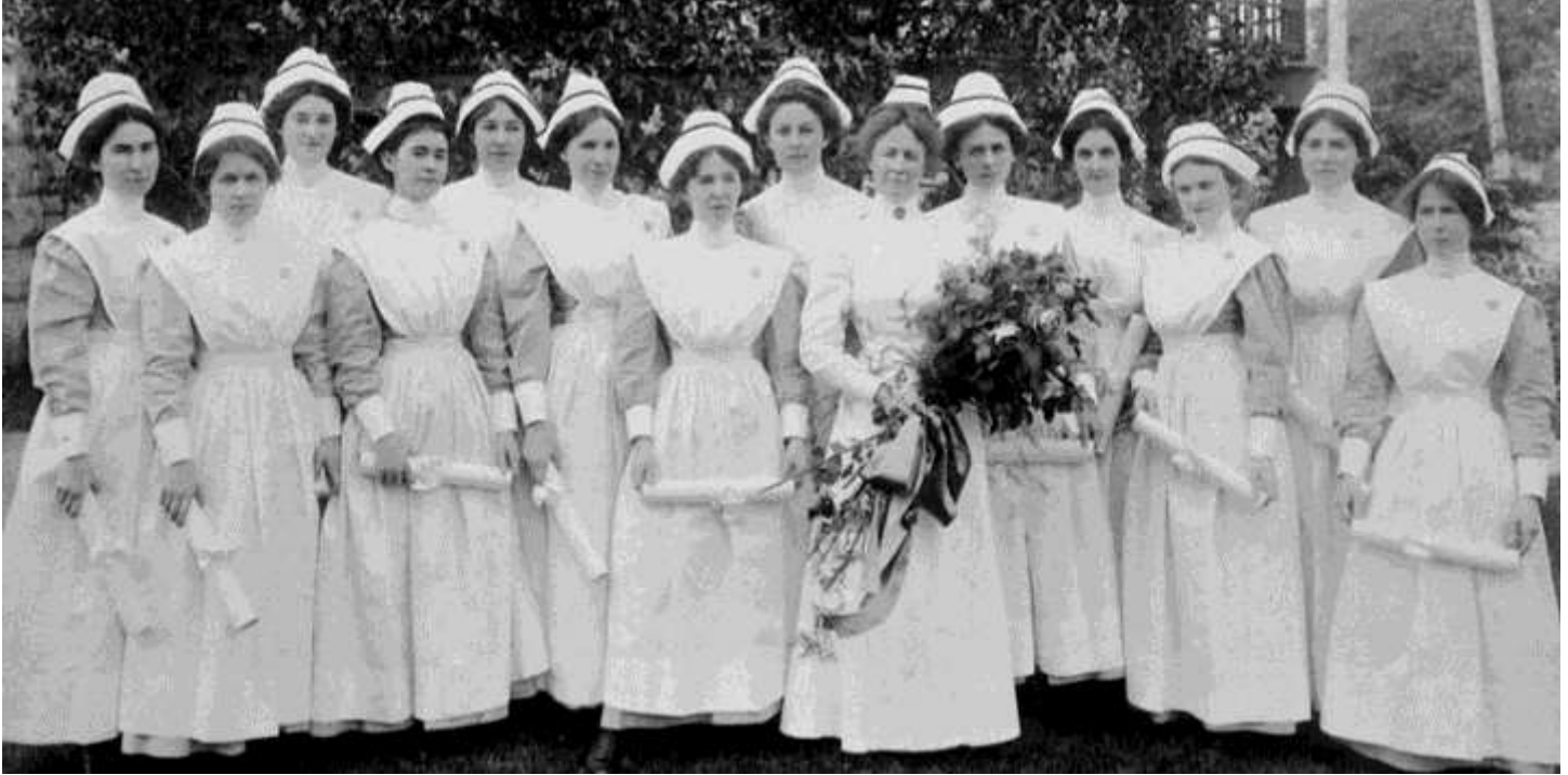
[Photograph of a group of Nursing graduates, Lady Stanley Institute for Trained Nurses of the County of Carleton General Protestant Hospital, Ottawa, Ont., 30 May 1913.] Lady Stanley Institute Nurses Alumnae Association fonds [textual record, graphic material] (R2822-0-4-E), Library and Archives Canada, Ottawa, Ontario.