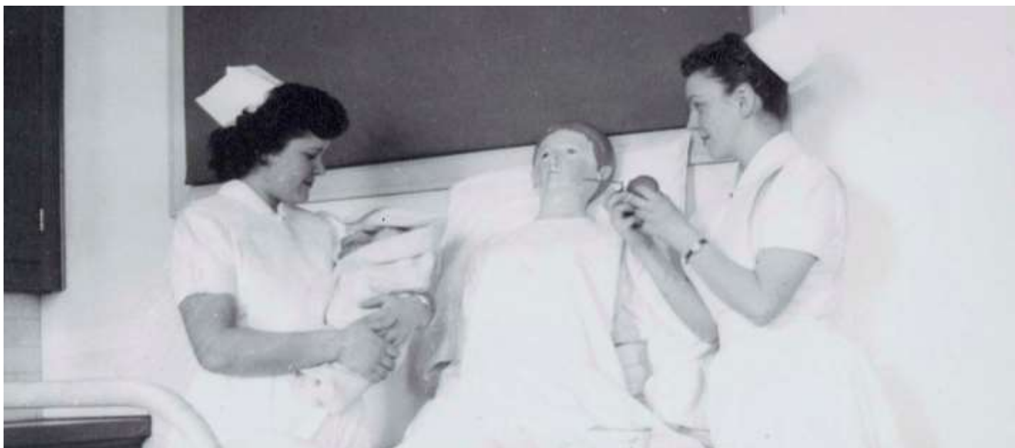
[Photography of a class demonstrating procedures on dummies in St. Boniface School of Nursing, 1949].

In 1985 Council addressed two key issues that were being discussed in the debates around the country on the question: the quality of the numerous programs that would be required to meet demand, and the fate of the diploma-nurses. At the November 1985 Council meeting, two motions were passed; the first called for “extending generic programs,” while the second called for “primacy [to] be given to the development/expansion of baccalaureate programs for post-diploma nurses.” ([CASUN], [Untitled minutes of November 7 & 8, 1985 Council meeting], [ca. 1985]).