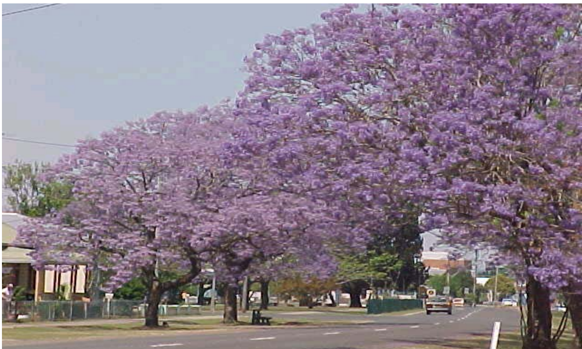
Jacarandas - Grafton