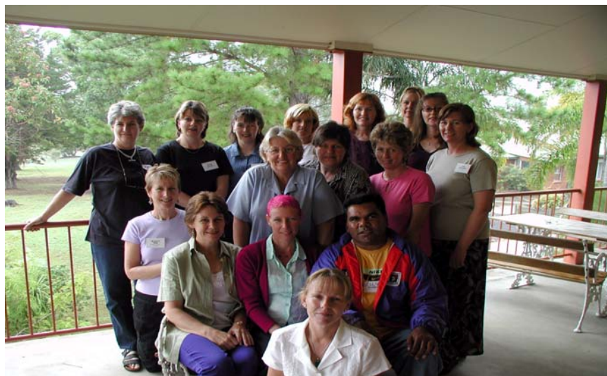
Priority Health Care Program Team, Northern Rivers Area Health Service

This will also require a focus on the skills and capability of health professionals providing health services as well as the facility design, equipment and staffing.