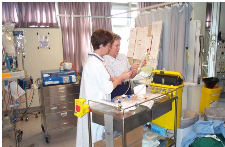
Lismore Base Hospital

In a broad sense, steady recognition and improvements have been made to terms and conditions of employment and support for professional development as well as support and sponsorship of undergraduate and postgraduate programs. There is also a growing recognition that rural health careers are professionally rewarding and offer advantages over specialised jobs within metropolitan areas. An important feature is the variety of work available within a given discipline and the satisfaction involved with being able to follow through with patients and their families. These closer links with the community allow for more enhanced clinical practice and a sense of belonging.